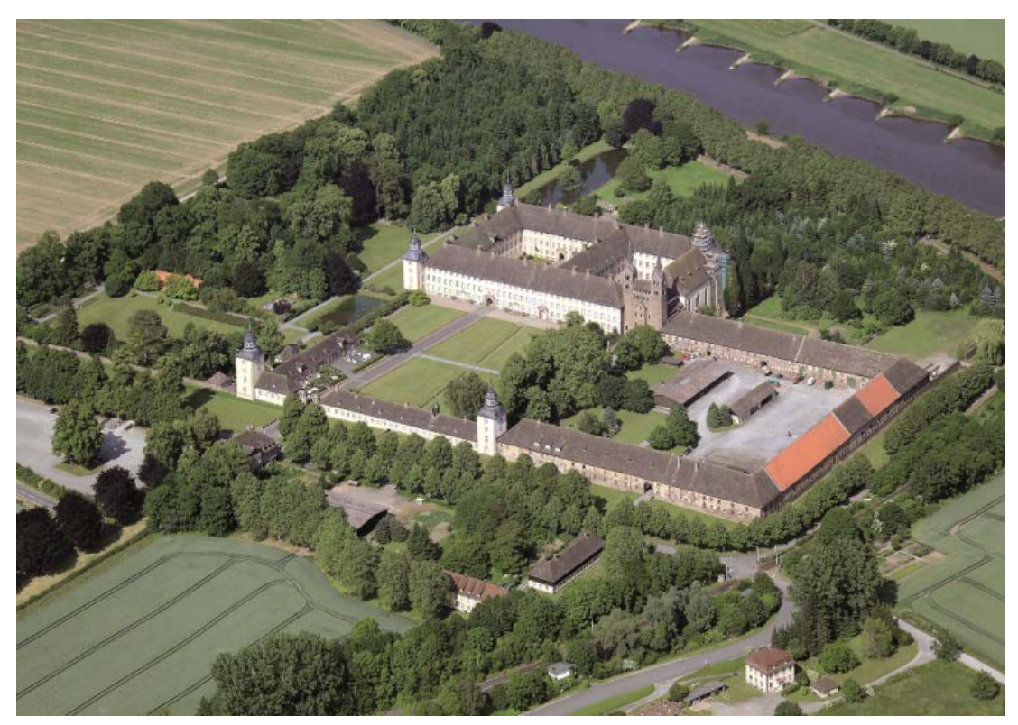
Aerial view of the nominated property