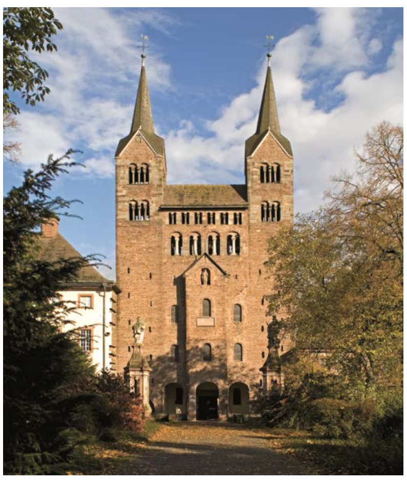
View of the Westwork of Corvey