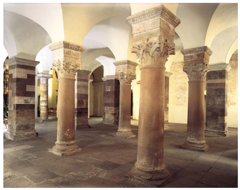
The westwork, ground floor