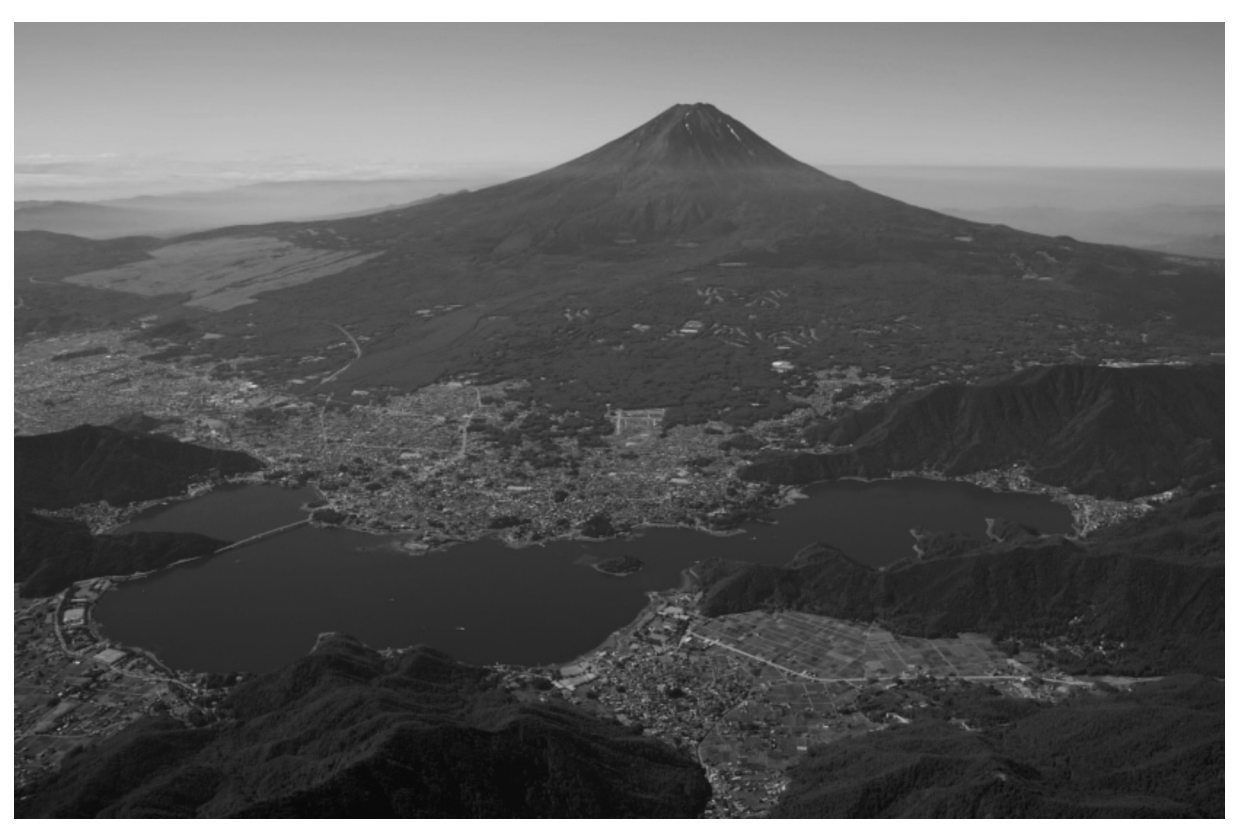
Aerial view of Fujisan from north