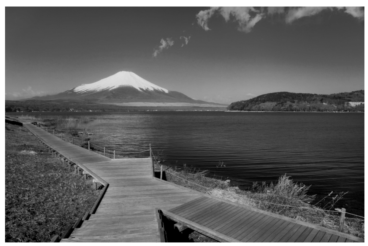
View of Fujisan from Lake Yamanakako