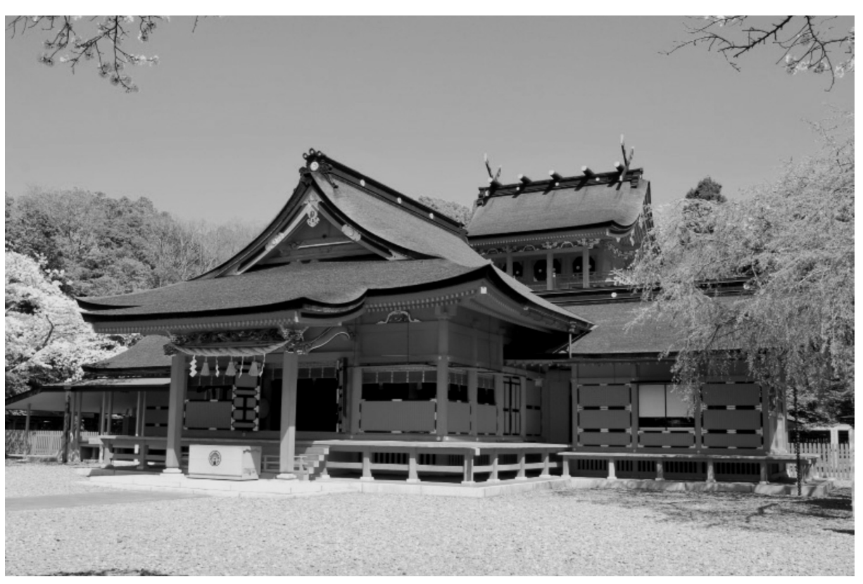
Fujisan Hongu Sengen Taisha Shrine