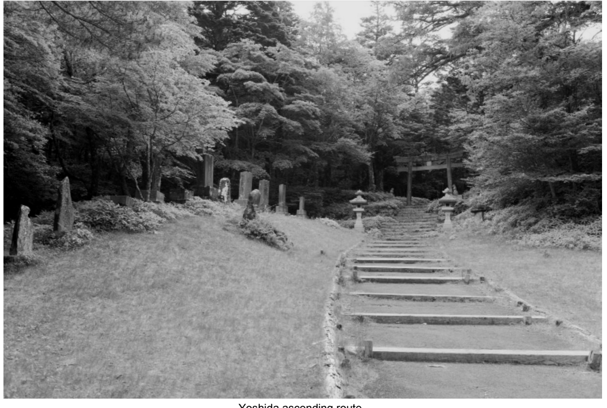
Yoshida ascending route