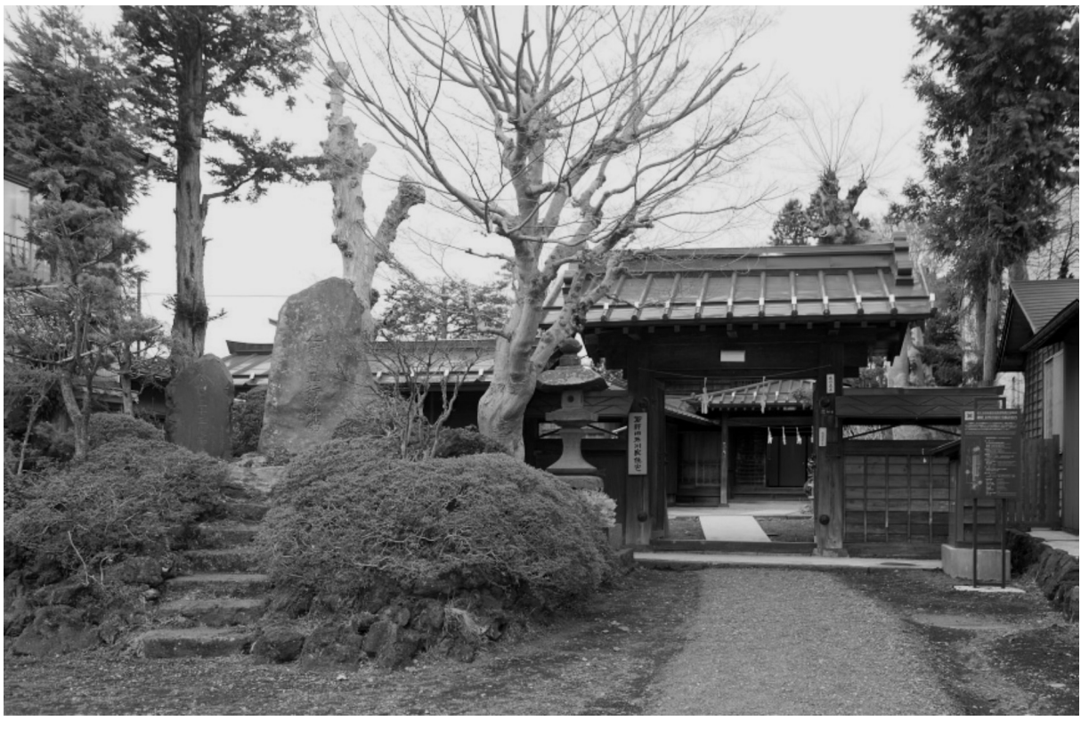
"Oshi" Lodging House (Former House of the Togawa Family)