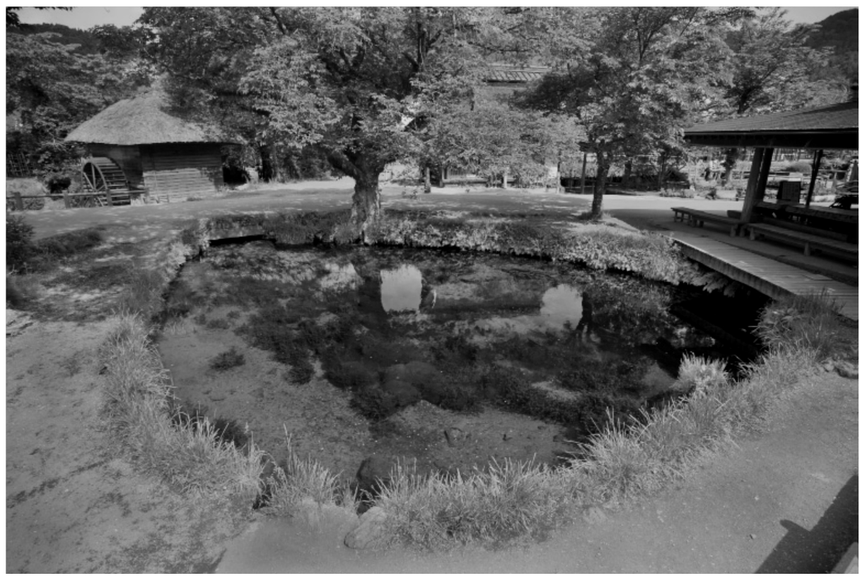
Oshino Hakkai springs (Wakuike Pond)