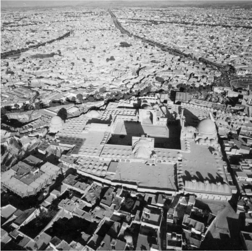
Aerial view of the nominated property