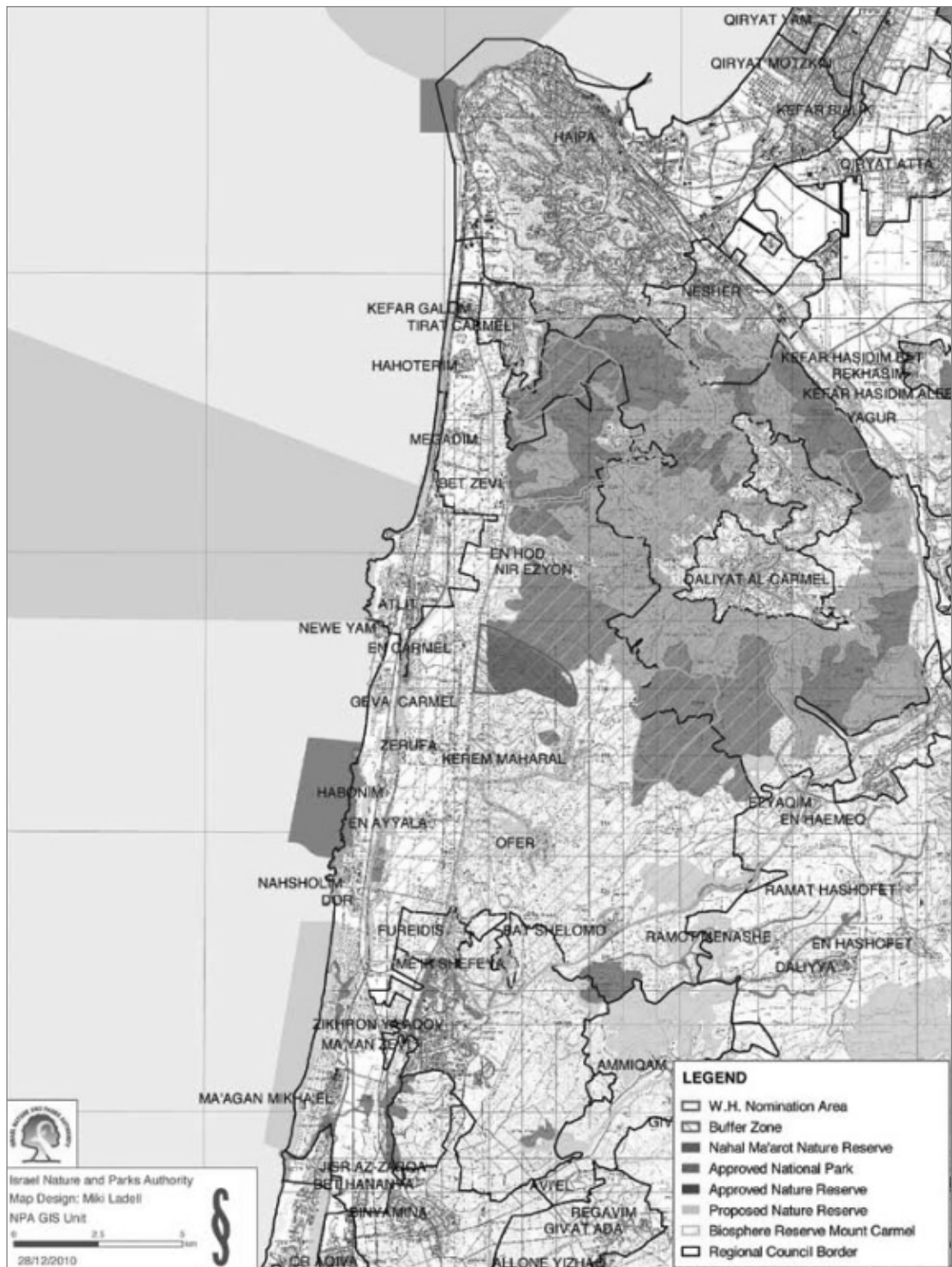
Map showing the boundaries of the nominated property