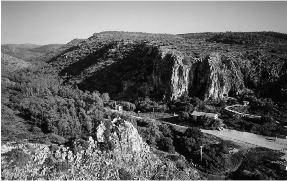
General view of the site