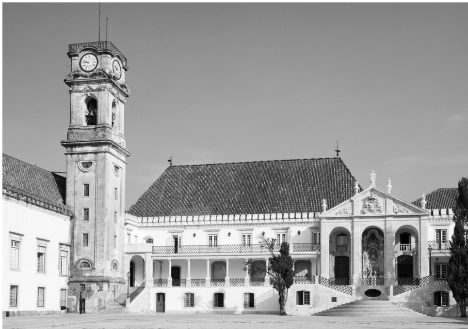
The Via Latina after conservation works