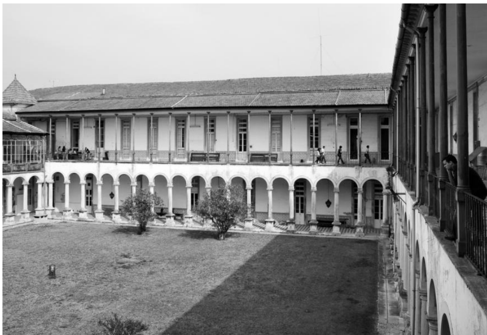
Sofia – Former College of the Arts