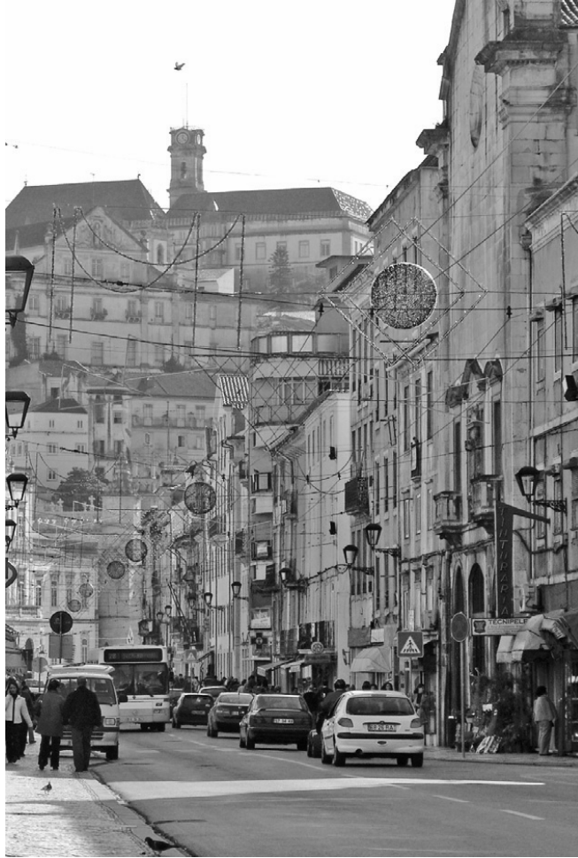
View of Sofia Street towards Alta