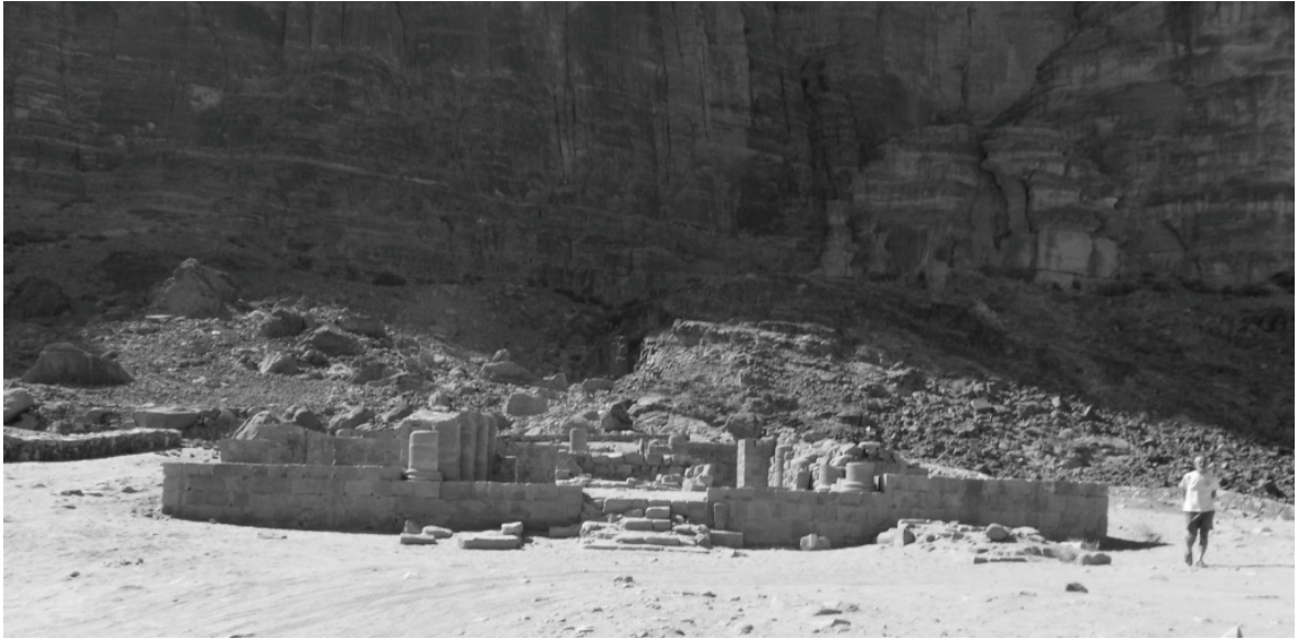
Nabataean temple remains