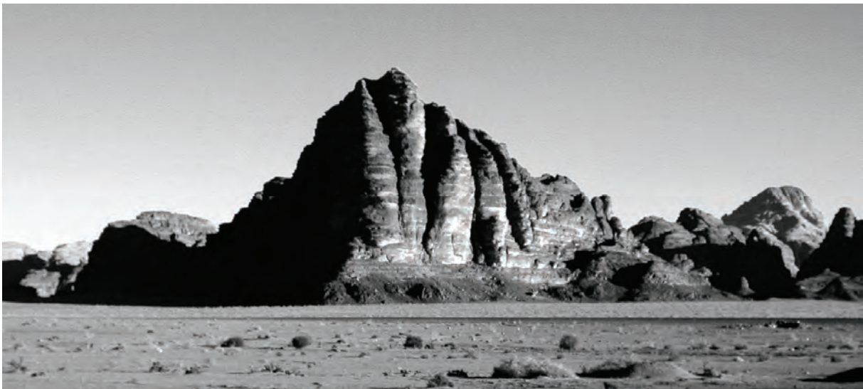
'Seven Pillars of Wisdom'