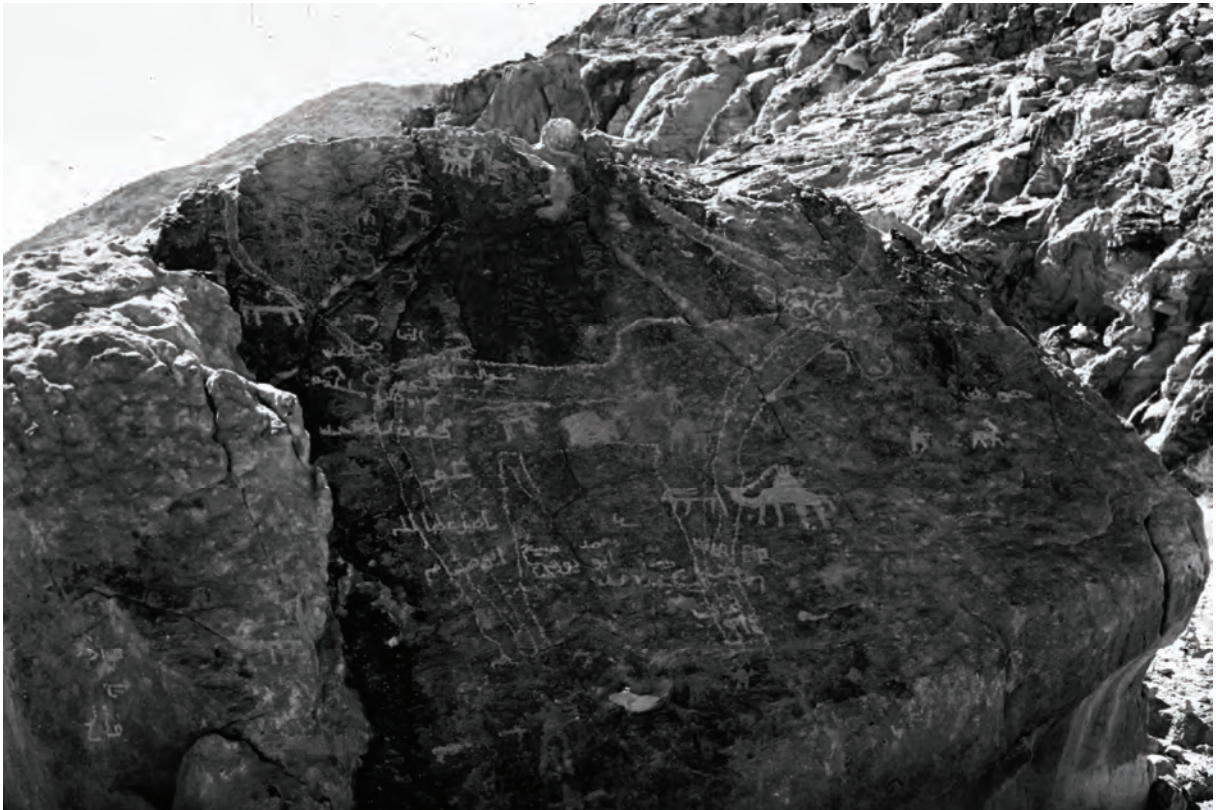
Petroglyphs and epigraphy