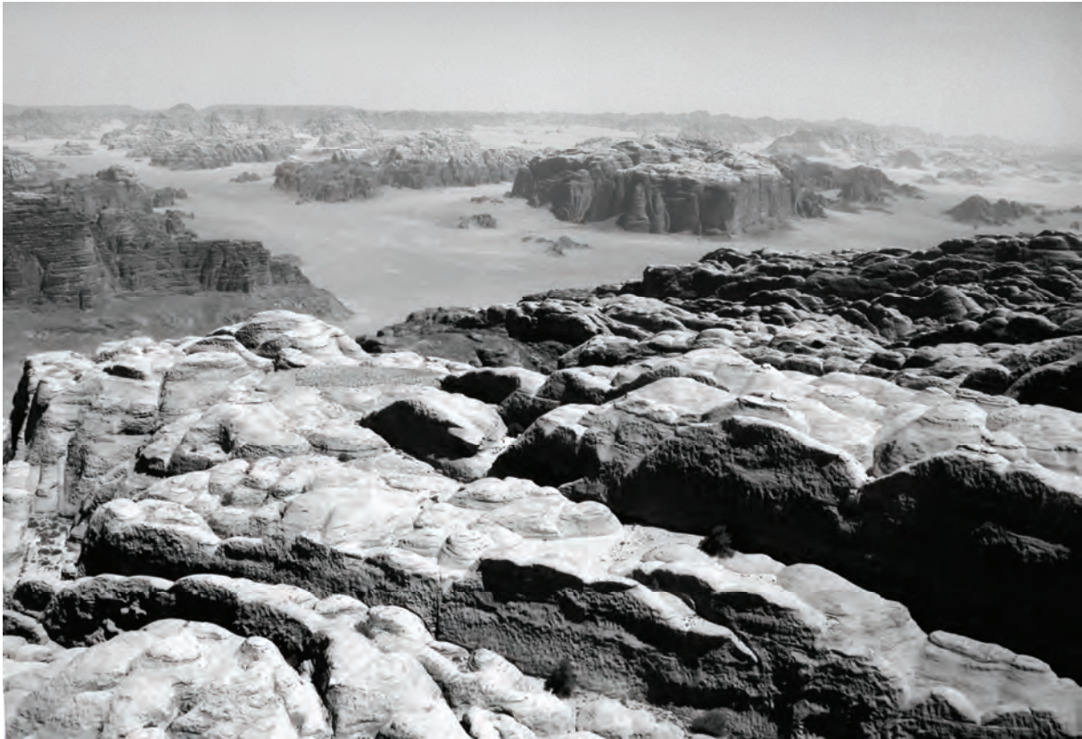
Panoramic view of Wadi Rum Protected Area from the top of Jebel Rum