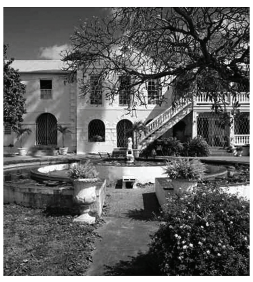
Plantation House - Bay Mansion, Bay Street