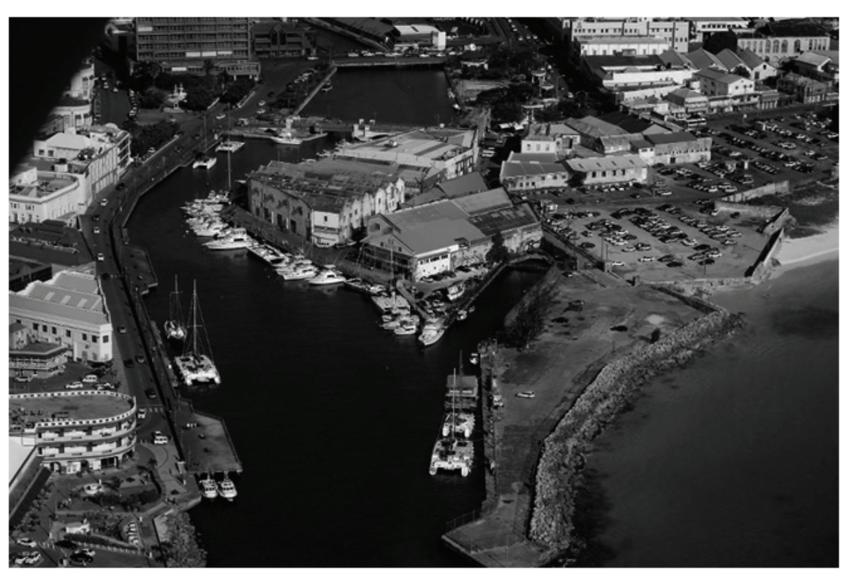
Warehouses and Screw Dock at Pier Head