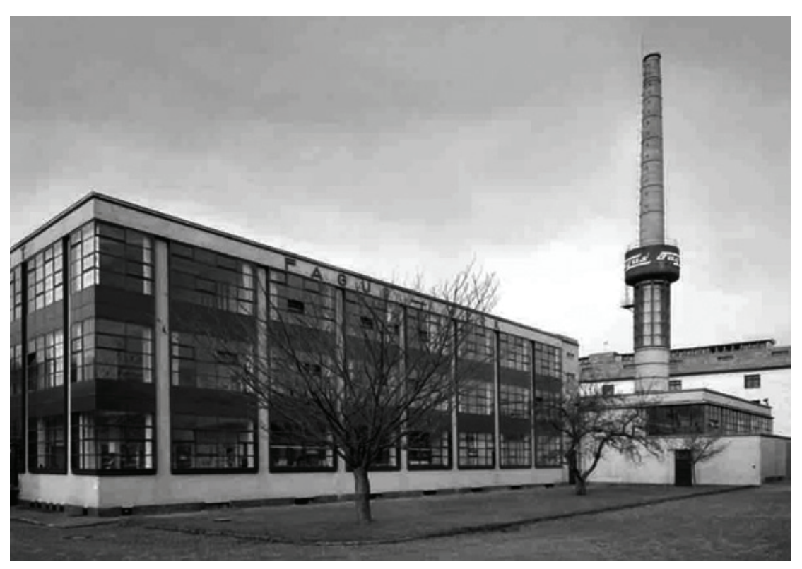
General south-eastern view