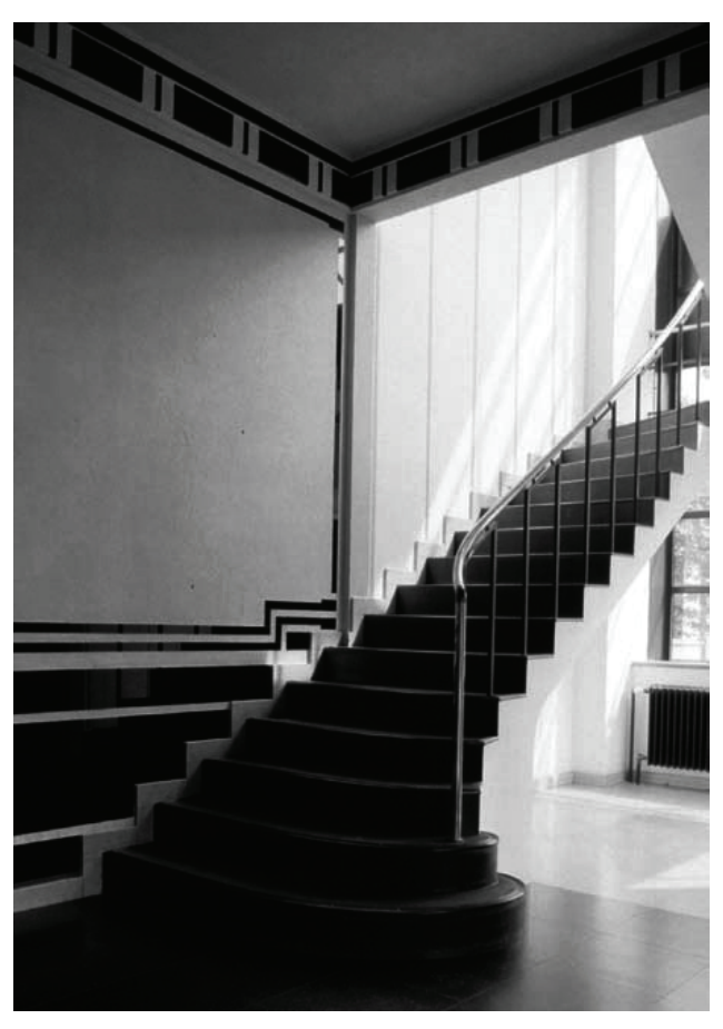
Main building foyer, staircase