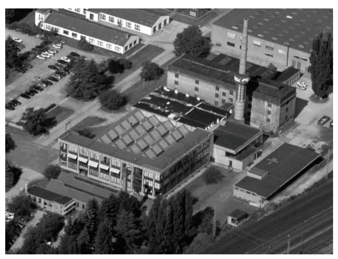
Aerial view of the nominated property