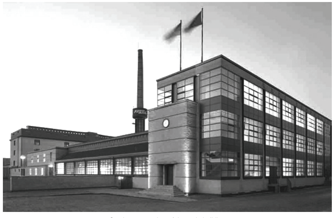
South-western view of the main building