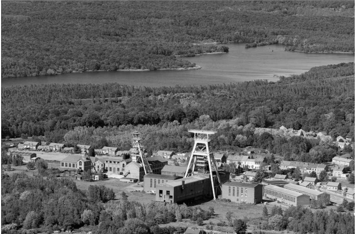
Anzin mining company – Arenberg pit in Wailers and subsidence pond