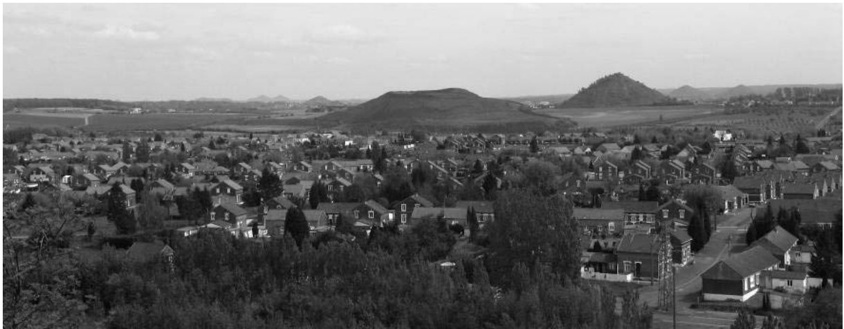
Marles mining company – Panoramic view of Auchel slag heap n°14 in Marles-les-Mines