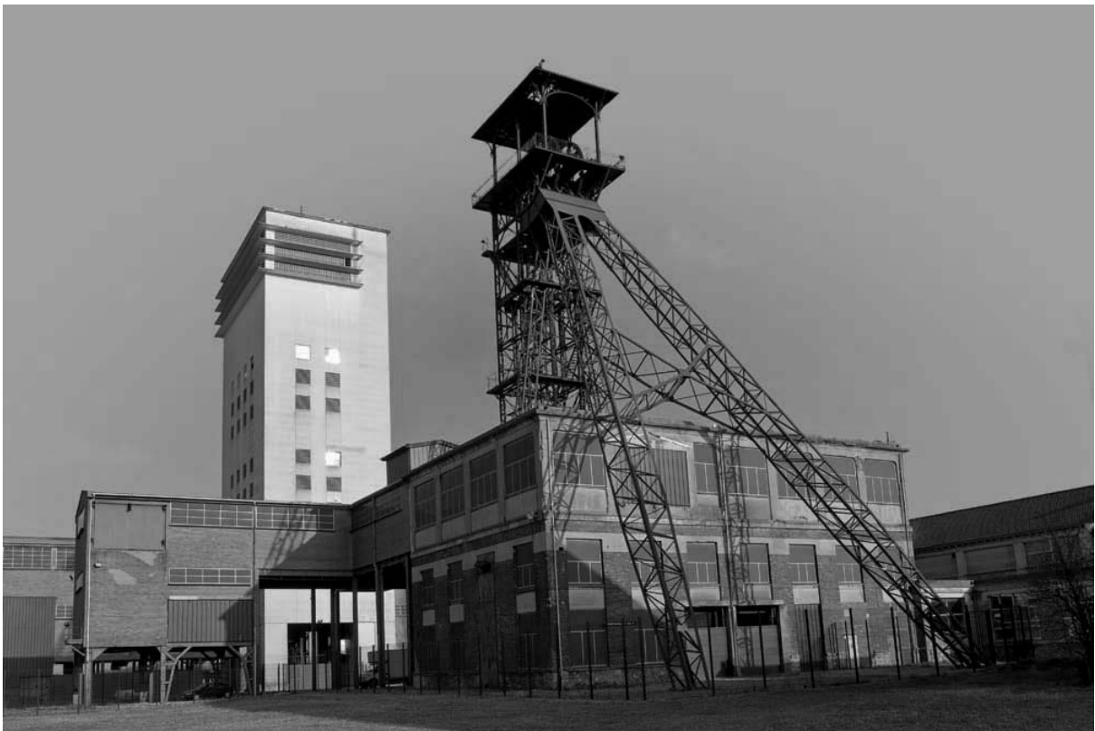
General view of pit n°11-19 of the Lens mining company