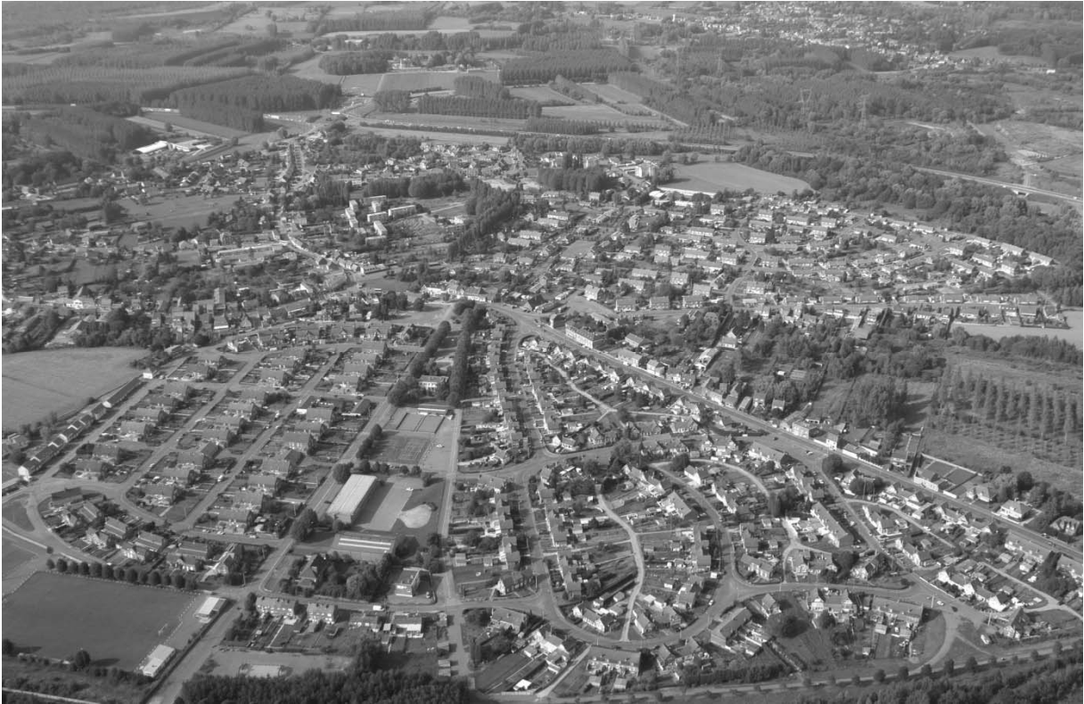
Aniche mining company - Worker estates of Sainte-Marie, Lemay and Pecquencourt