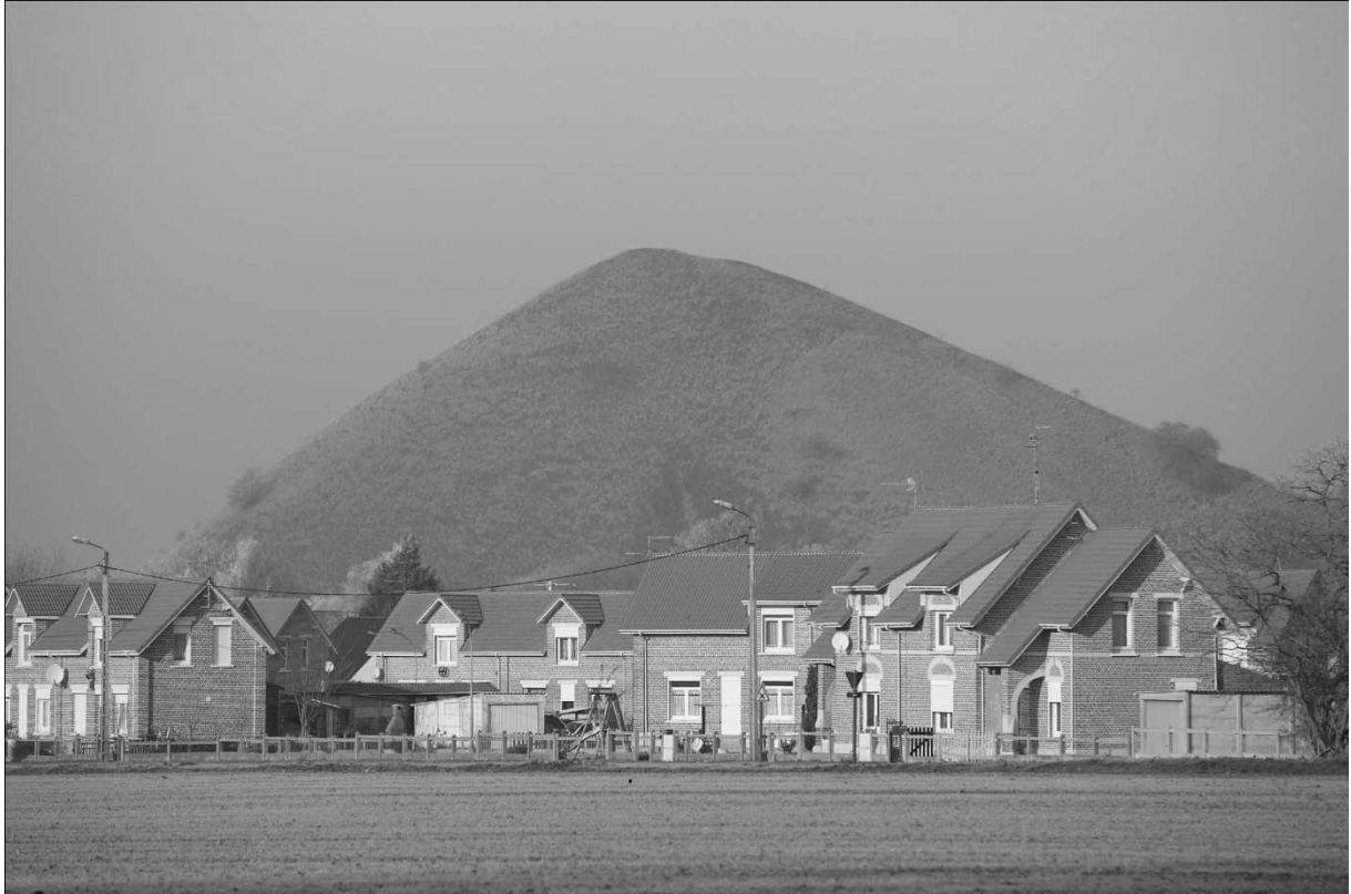
Courrières mining company – Social housing of pit n°24 below slag heap 98 in Estevesles