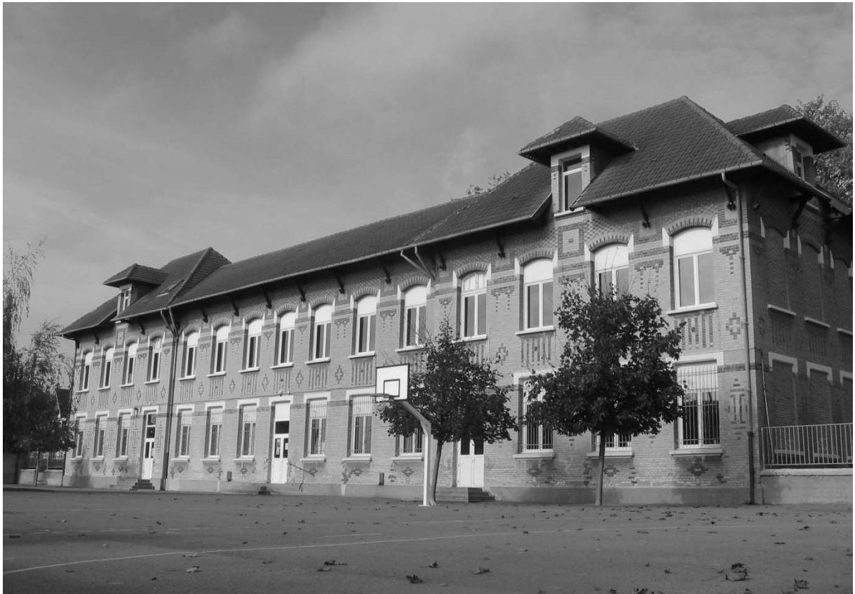
Liévin coal-mining company – school of estate n°16 in Liévin