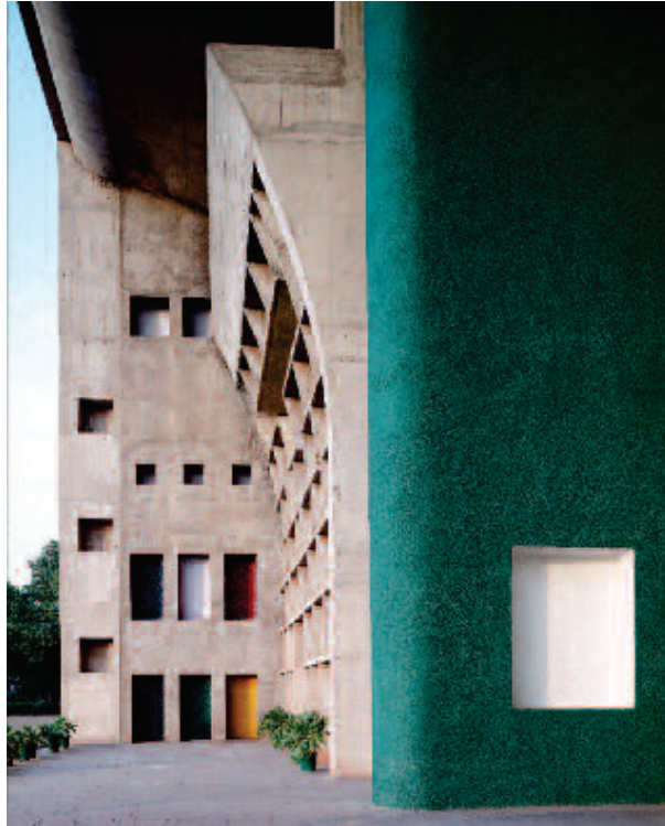
Element 14: Capitol Complex – Chandigarh, India