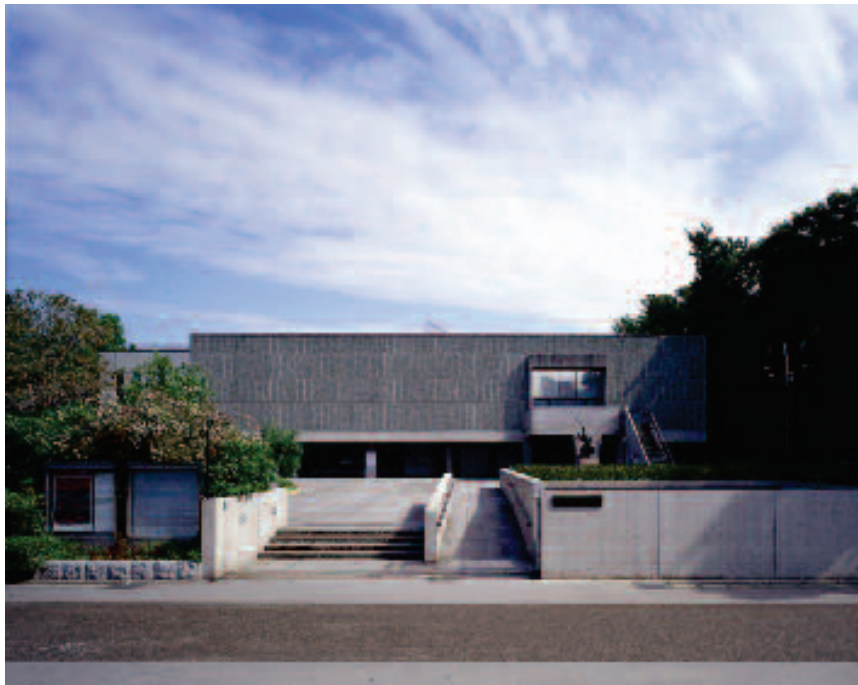
Element 16: National Museum of Western Art – Tokyo, Japan