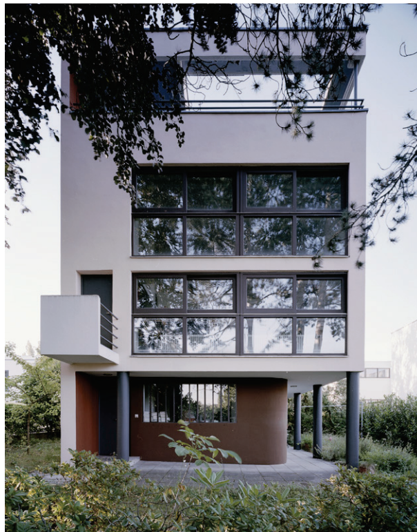
Element 5: Maisons de la Weissenhof-Siedlung– Stuttgart, Germany