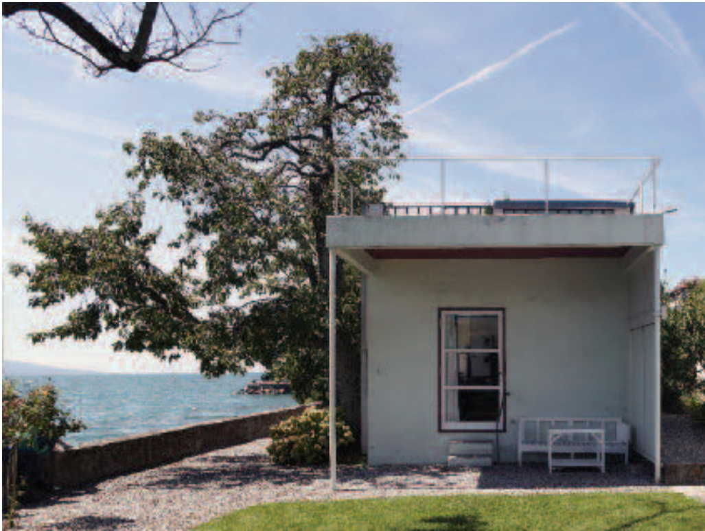
Element 2 : Petite villa au bord du lac Léman – Corseaux, Switzerland