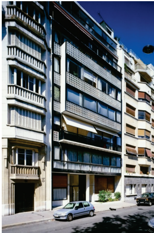
Element 8: Immeuble Molitor - Paris, France