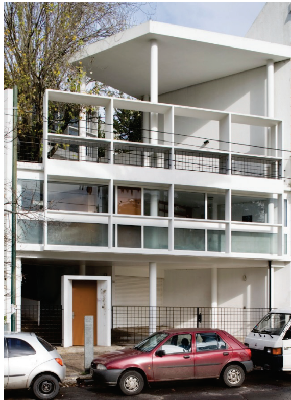
Element 11: Maison du Docteur Curutchet – La Plata, Argentina