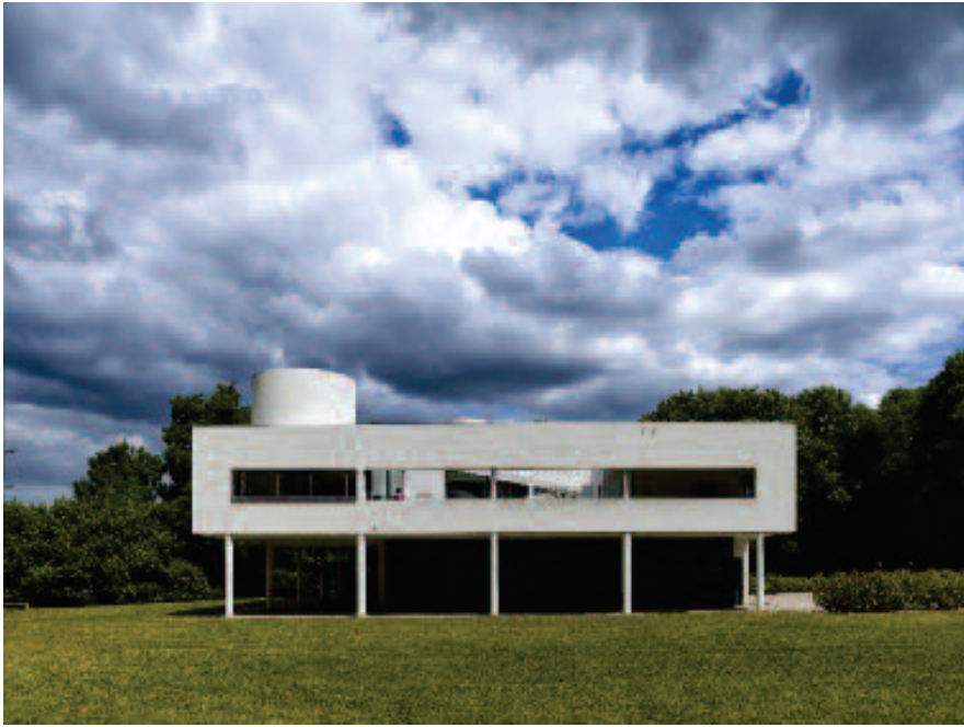
Element 6: Villa Savoye - Poissy, France