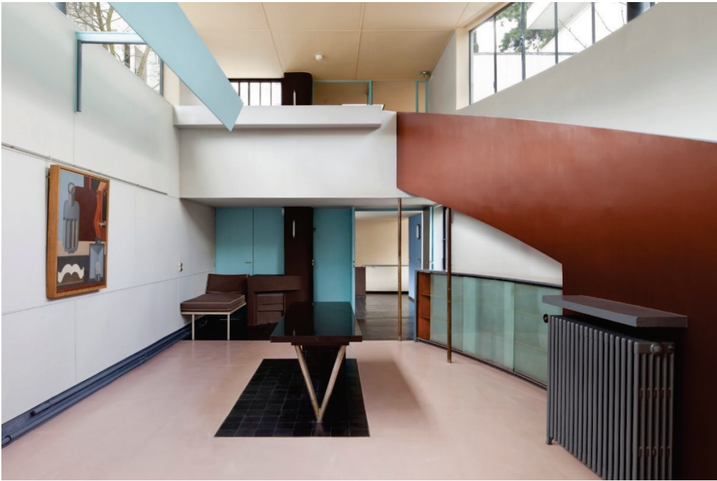
Element 1: Maisons La Roche et Jeanneret – Paris, France