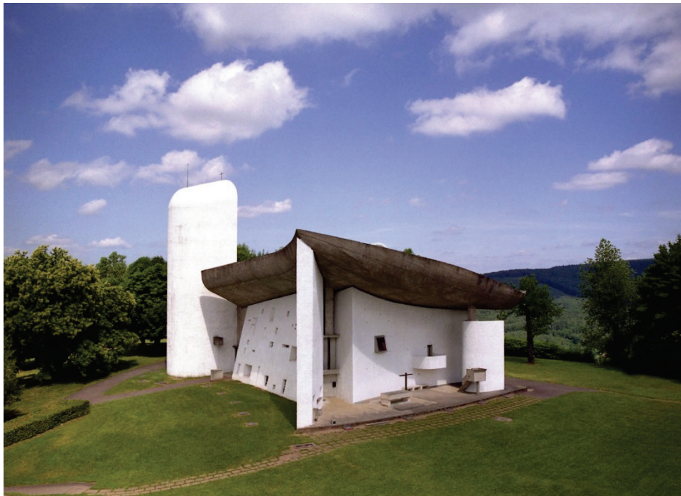
Element 12: Chapelle Notre-Dame-du-Haut – Ronchamp, France