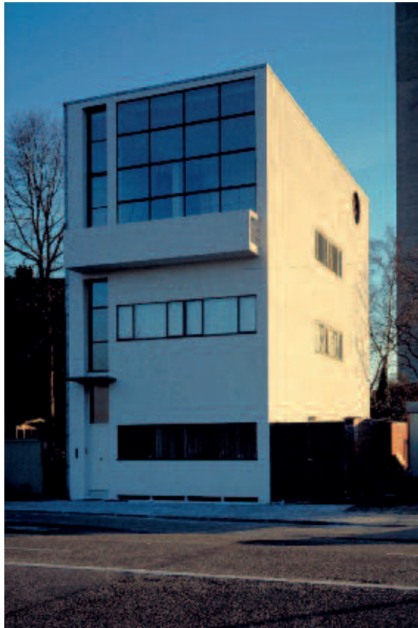
Element 4: Maison Guiette – Antwerp, Belgium