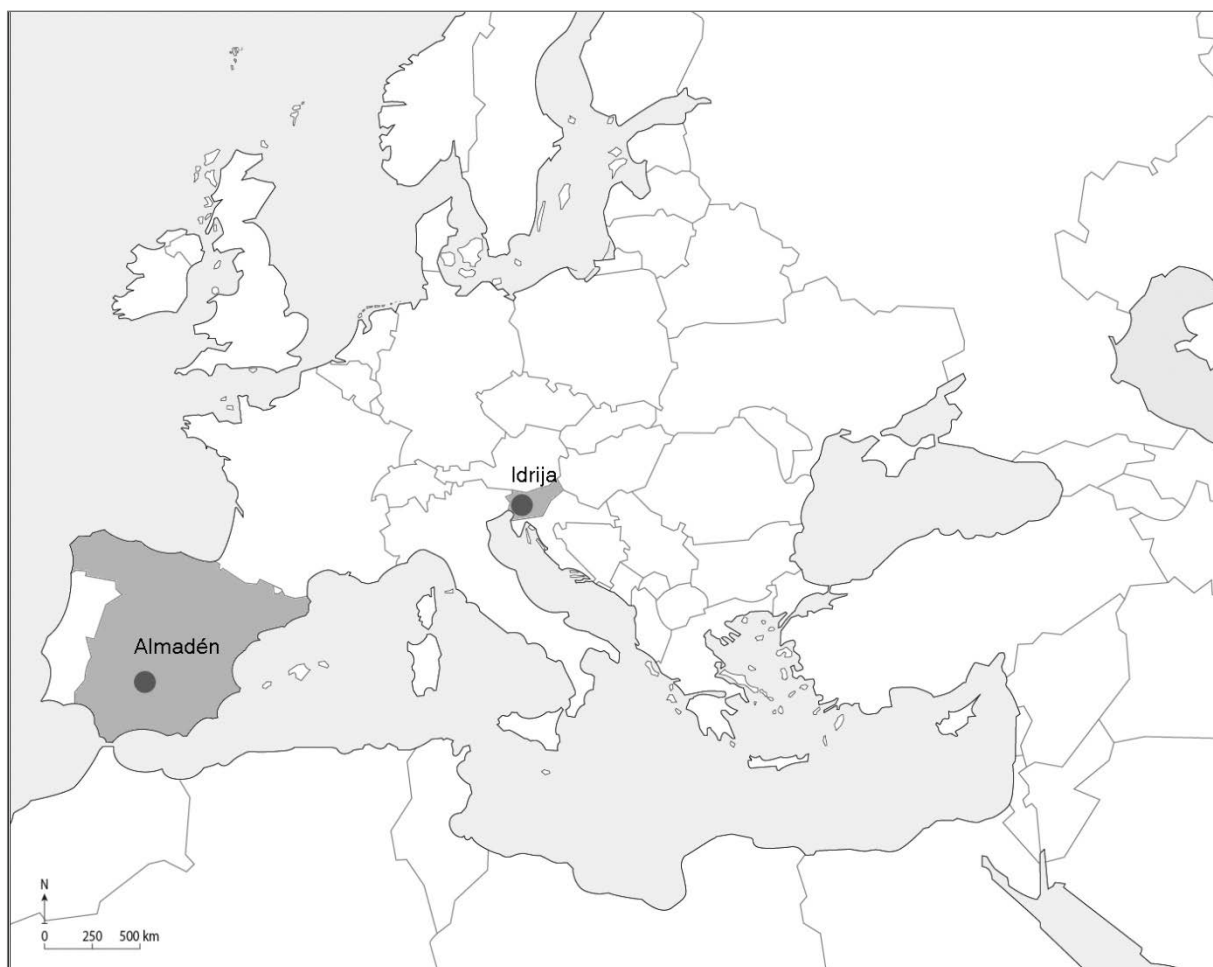
Map showing the location of the nominated properties