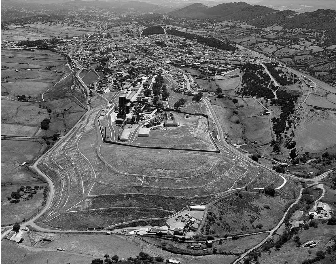
View of Almadén and the mine