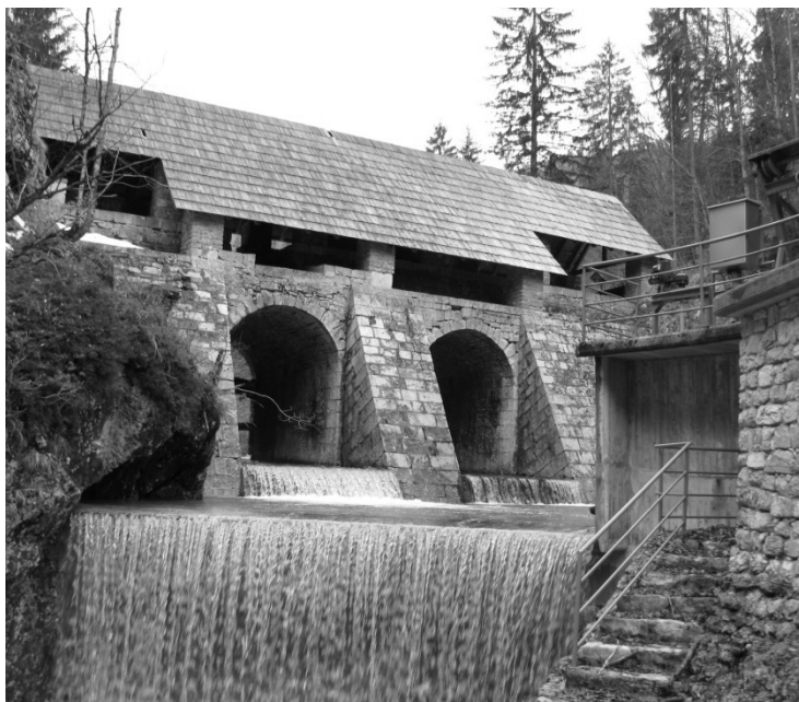
Idrija - dam