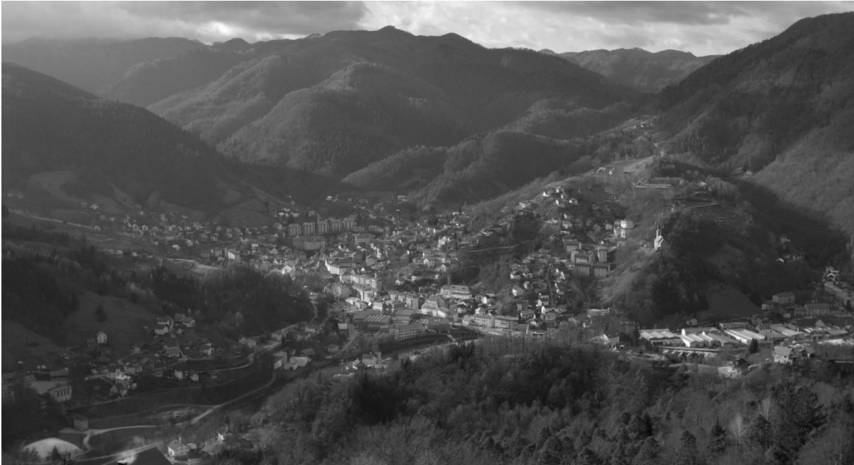
General view of the city of Idrija