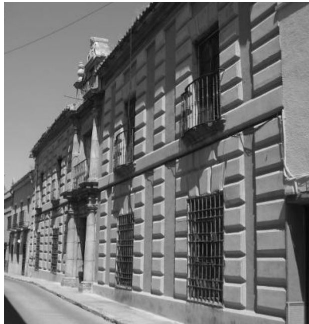
Almadén - Mining Academy building