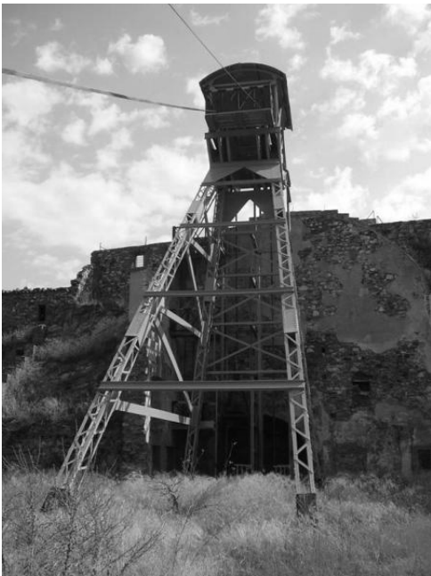
Almadén - San Aquilino tower