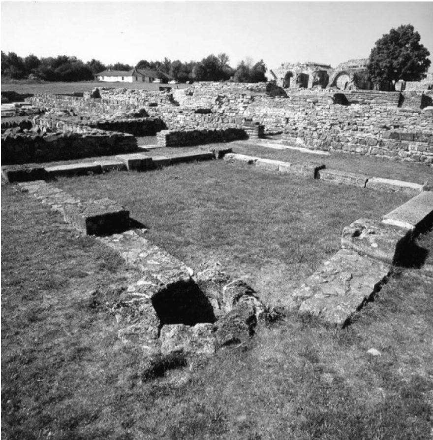
Atrium with well