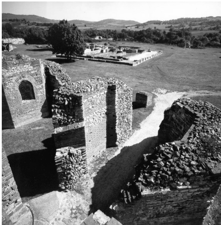
Remains of older fortification