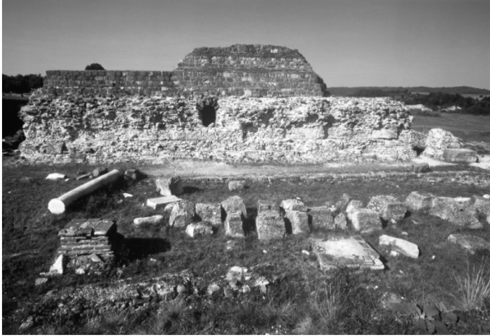
Remains of the great temple