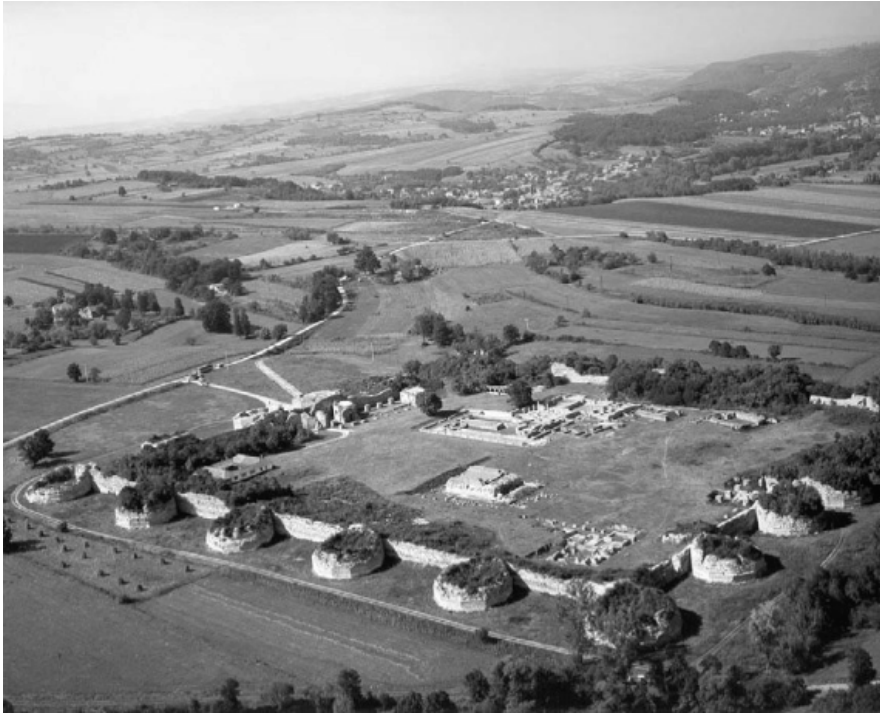
Aerial south-east view