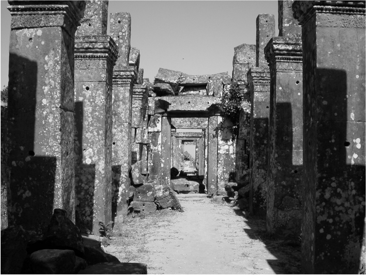
Gopura no. 2