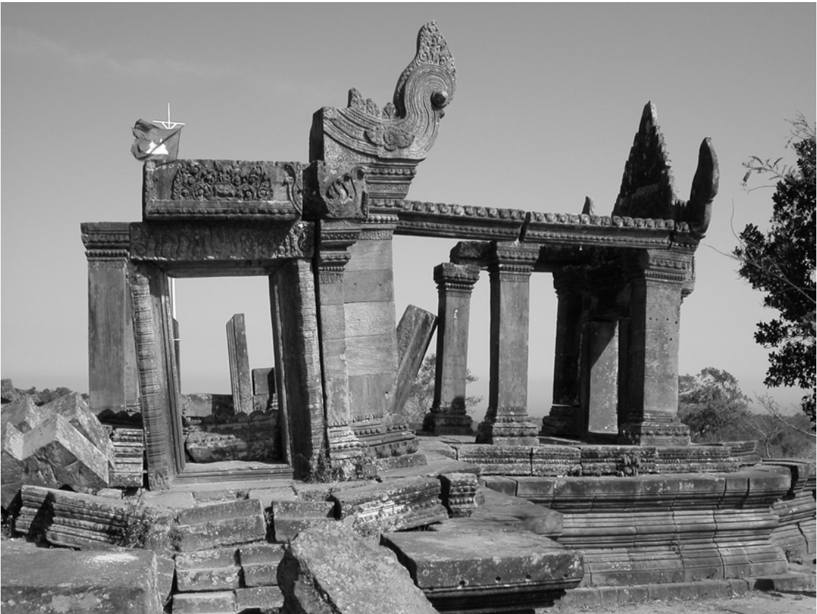
Gopura no. 5