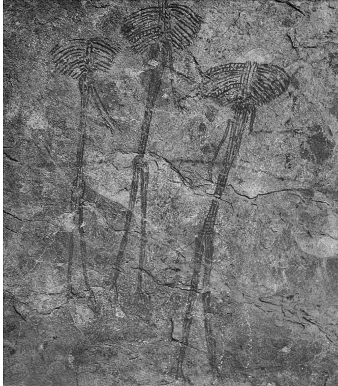
Early red paintings at the Kolo complex