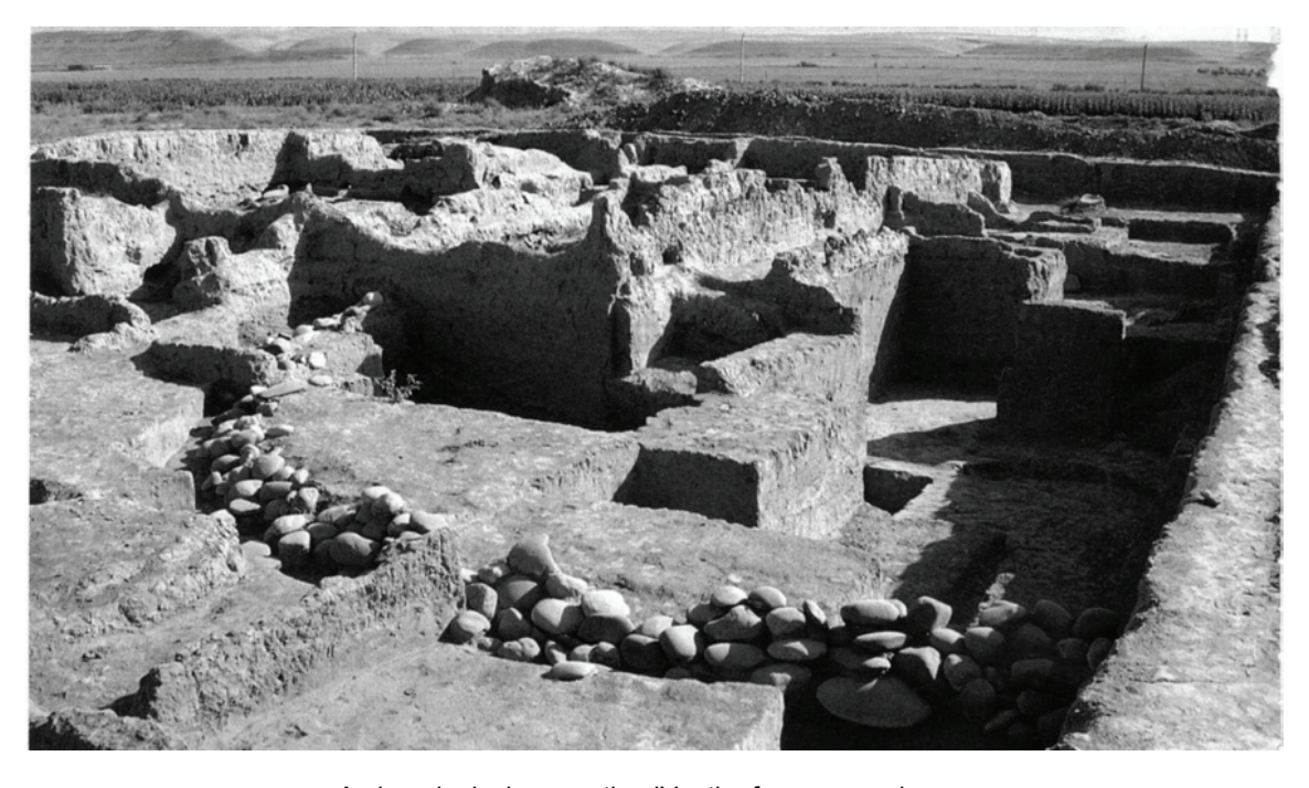
Archaeological excavation IV – the funerary enclosure