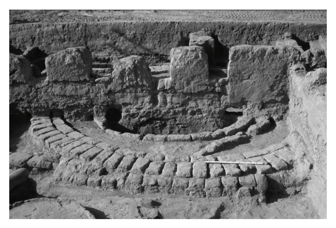
Archaeological excavation V – the palatial complex