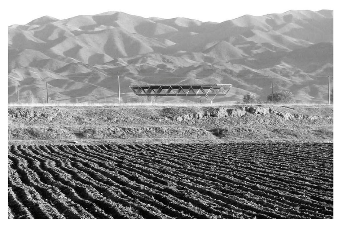
View of the terrace of Sarazm from the south