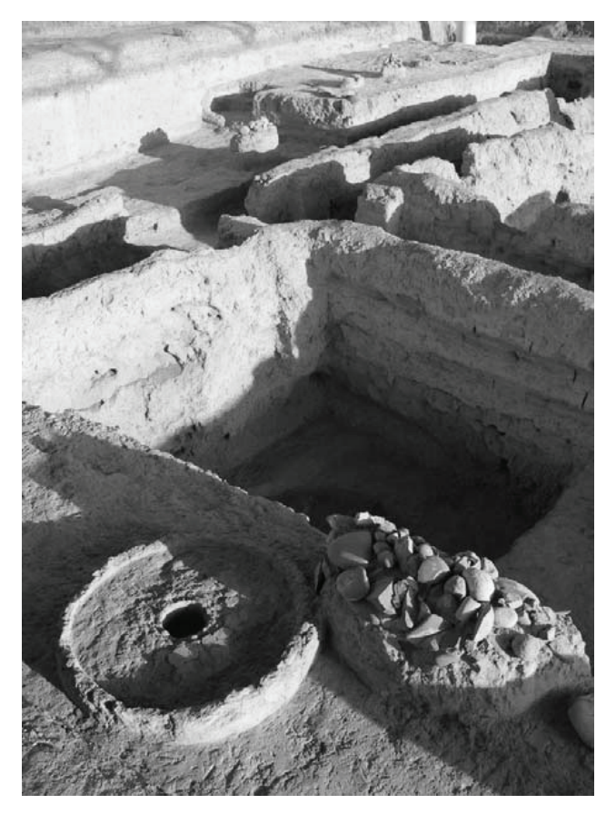
Archaeological excavation XI – the religious building