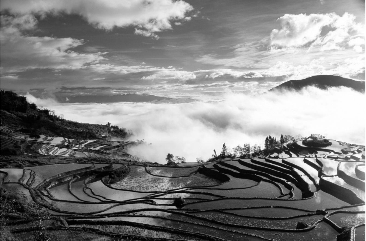
View of the terraces