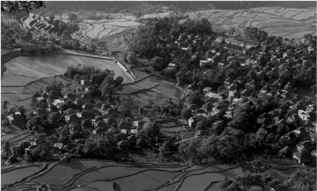
View of Hani village and houses