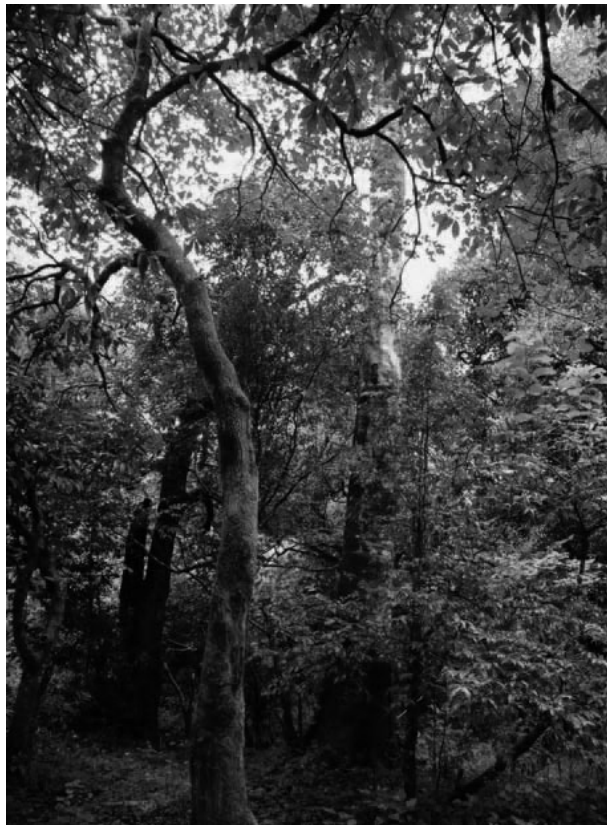
Forest in Aicun village