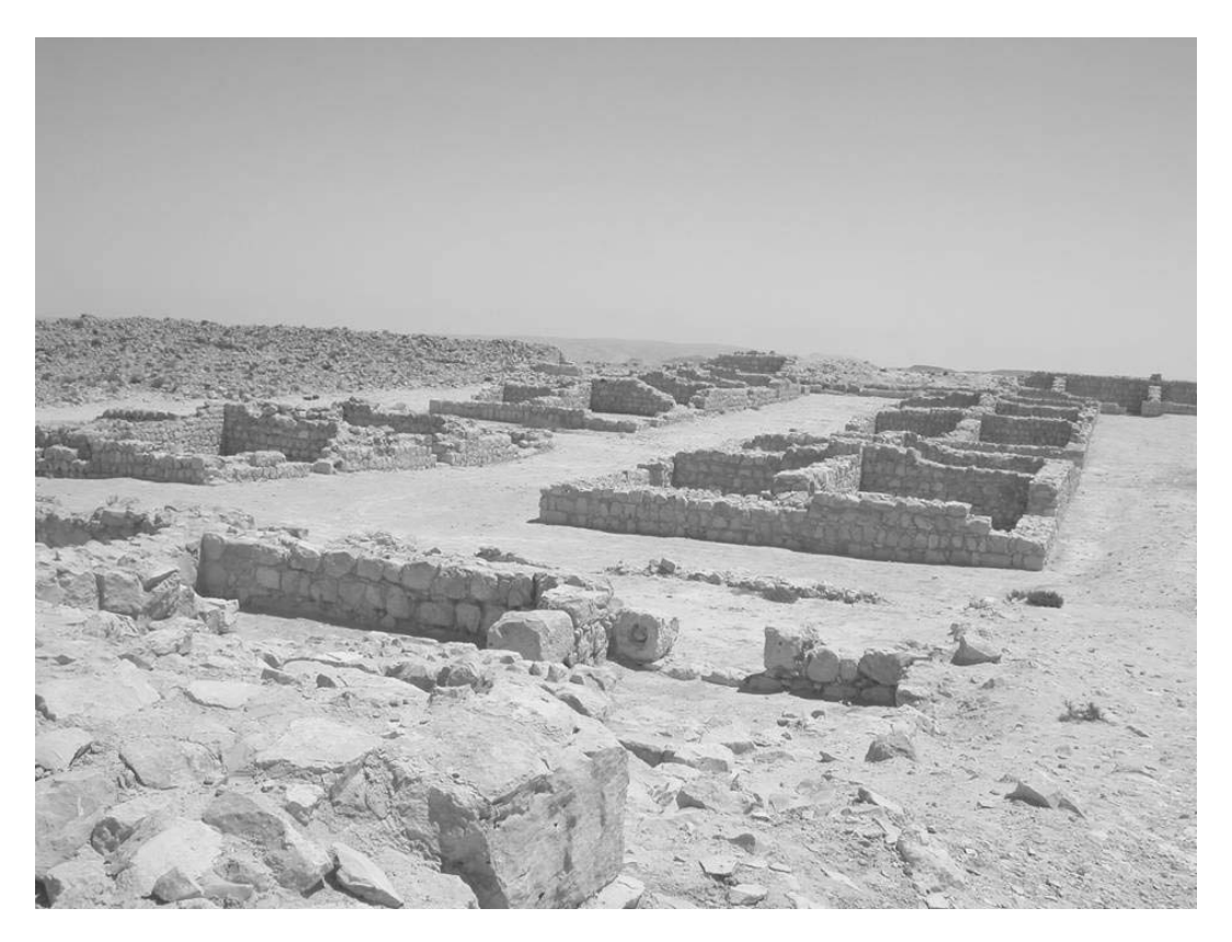
View of Avdat-Oboda