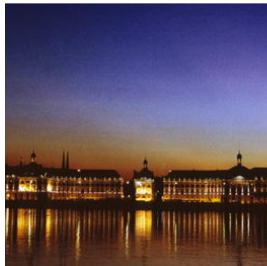
Bordeaux, Port of the Moon  

Patrimonio de la Humanidad. All Mexican cities, except Mexico City which has its own programme, participated in the association.