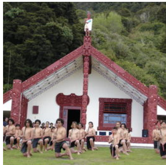
Tongariro National Park

Tongariro National Park (New Zealand) uses the Outstanding Universal Value of the site as a key message for visitors. It is communicated to the public through site signage, publications and interpretation at visitor centres, including audiovisual displays and media releases. These messages have increased awareness and support among the indigenous Maori owners of the site. The park's website includes tourist information and publications on World Heritage status and is used to stress the need to responsibly protect the site.