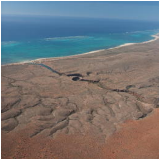
Ningaloo Coast

By contrast, there is evidence that World Heritage helps to bring lesser-known sites more into the public eye, even some sites run by national government agencies. These newer, lesser-known sites may see utility in using the status for tourism promotion.