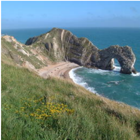
Dorset and East Devon Coast

increased awareness of the area regionally, nationally and locally but also internationally. The status was said to have provided recognition that the public and the media respond to, more than most national designations. (Management also reported that this helped to create enthusiasm and local community pride, which in turn brought together numerous other constituencies.)