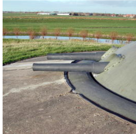
Defence Line of Amsterdam

Line of Amsterdam and the Wouda Steam Pumping Station has led to a higher financial commitment from regions. The windmills of Kinderdijk also received funding from the regional authority after World Heritage designation.