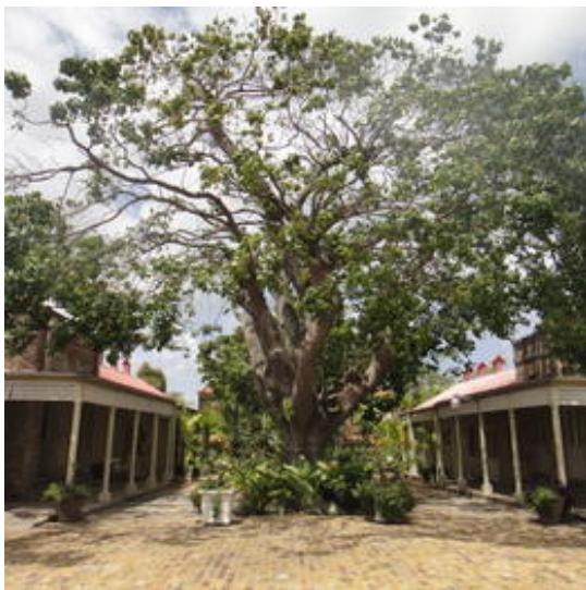
Historic Bridgetown and its Garrison

Barbados was seeking to attract a different kind of visitor to the Island, repositioning it to attract more upscale tourism. The Minister of Community Development and Culture reported that inscription of Historic Bridgetown and its Garrison on UNESCO's World Heritage List would provide a 'critical window of opportunity for the island to do so'.