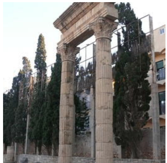
Archaeological Ensemble of T rraco   Calafellvalo

In the early 1990s, the mayors of the old towns of Santiago de Compostela and  vila created a Spanish association of World Heritage cities, which is used to promote cooperation and enhance the selective image of each city.