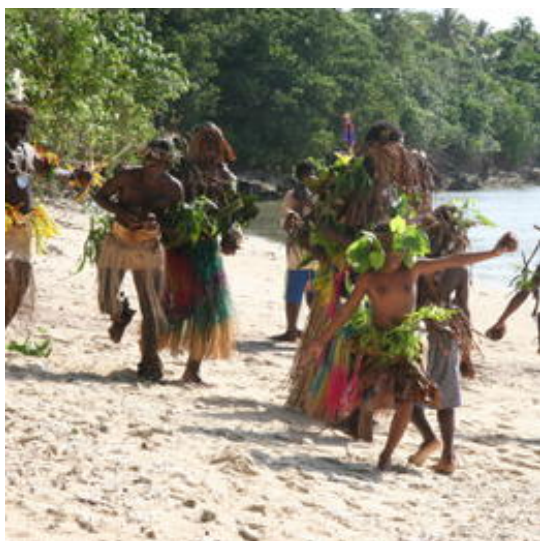
Chief Roi Mata's Domain

Advisory Group remain at the heart of management. The group coordinates site management and conservation, craft production and water security. It runs a community-owned cultural heritage venture, Roi Mata Cultural Tours, and a programme of bungalow development.