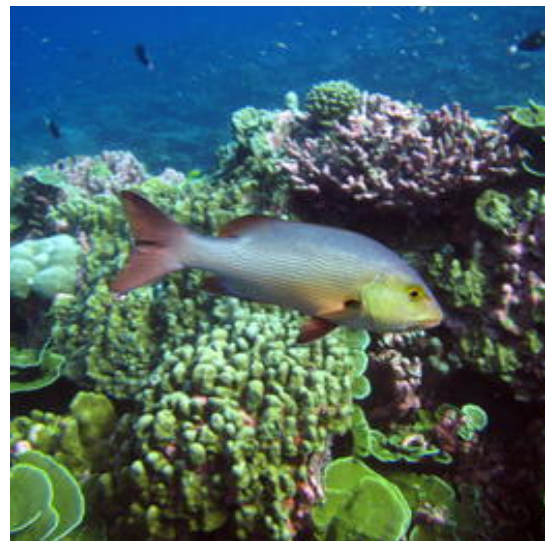
Phoenix Islands Protected Area

For example, it was reported by those working on the nomination of Phoenix Islands Protected Area (PIPA), in Kiribati, the world's largest and deepest World Heritage site, that World Heritage designation contributed to an increased sense of national pride. At Dorset and East Devon Coast, management found World Heritage to be a concept that people can identify with and celebrate.