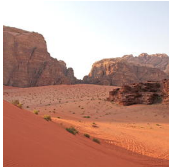
Wadi Rum Protected Area

management efforts to reorient tourism to higher-end cultural markets. After inscription the site managers are informally referring to the site as the 'New Wadi Rum' as they attempt to increase opportunities for raising the quality of local products and services.