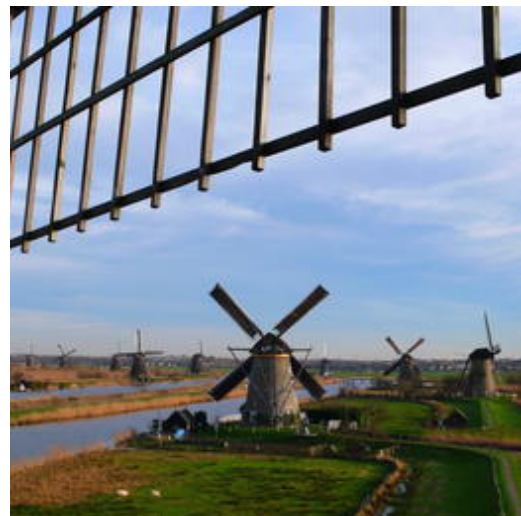
Mill Network at Kinderdijk-Elshout

At the Dorset and East Devon Coast site there was a reported change in funding body attitudes after World Heritage inscription. The Dorset and Devon County Councils provided an additional £300,000 for more staff, conservation projects, interpretation and publications budget, and to support sustainable tourism marketing projects.