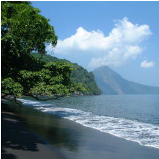
Ujung Kulon National Park

Ujung Kulon National Park (Indonesia) uses World Heritage to communicate the park's important value. It does this by explaining World Heritage status to residents, visitors and the public through leaflets, booklets, pictures, posters at the information centre, and through the extension activities for elementary schools.