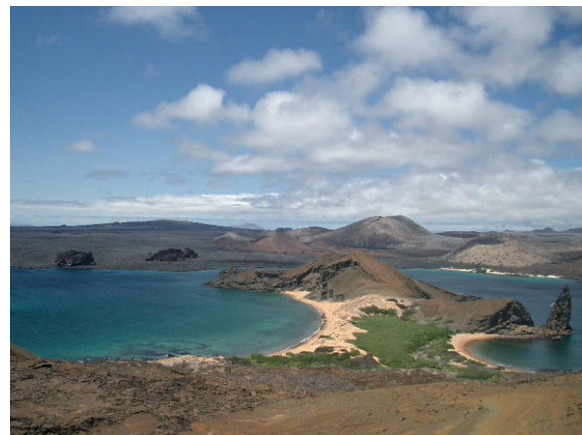
Galápagos Islands

Galápagos Islands site managers use World Heritage status to increase donor enthusiasm. World Heritage is mentioned in most funding applications. Ujung Kulon National Park and their WWF colleagues also mention World Heritage in funding proposals in order to increase donor enthusiasm.