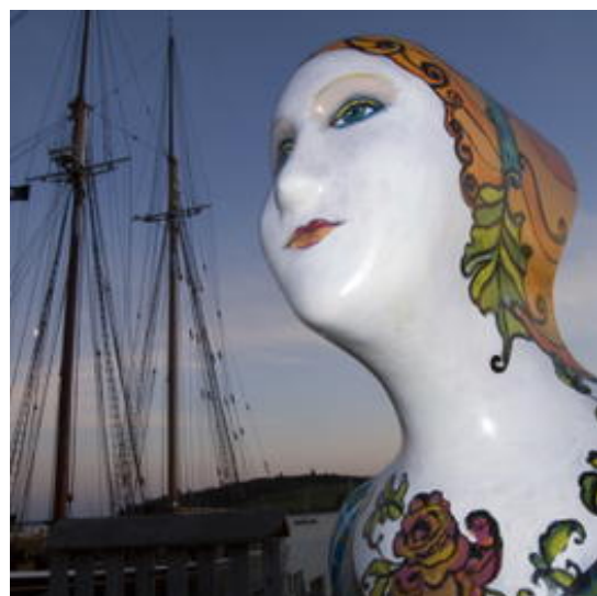
Old Town Lunenburg

Also in Jordan, Petra officials are concerned with strengthening culturally oriented tourism experiences that will keep people in the local communities for longer periods. To attract this niche market to the community, an international archaeological conference at this World Heritage site was being discussed by the Petra Regional Development Agency.