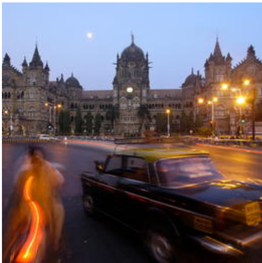
Chhatrapati Shivaji Terminus

In India, through the site inscription process and the resubmission of the site nomination, management for the Chhatrapati Shivaji Terminus (formerly Victoria Terminus) site was able to nominate a cluster of significant buildings, all contributing to a much wider and inclusive cultural landscape.