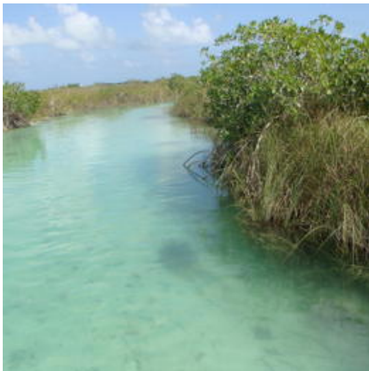
Sian Ka'an

The Sian Ka'an management team has reported that World Heritage status has acted to position the site as one of central importance in national conservation efforts in Mexico. This has translated into budget advantages from the protected areas department of the Mexican Government and the Mexican Tourism Board.