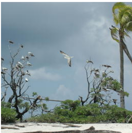
Tubbataha Reefs

Positive marketing is reported as being aided by World Heritage status. A dive operator at Tubbataha Reefs Natural Park (Philippines) reported that the status gives the reefs more importance compared with other areas, making it a must-see destination for foreign, mainly European and American, divers.