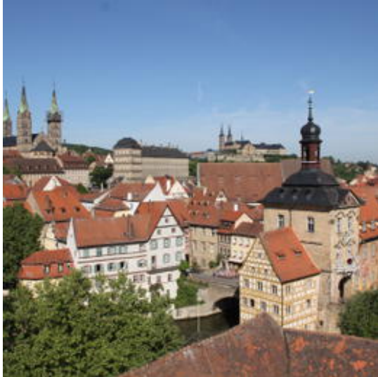
Town of Bamberg

Tourism marketing campaigns in the Town of Bamberg (Germany) have focused on the destination as a World Heritage site. Bamberg officials believe that World Heritage status has increased tourism numbers and has been an important factor in enhancing the city's overall quality of life.