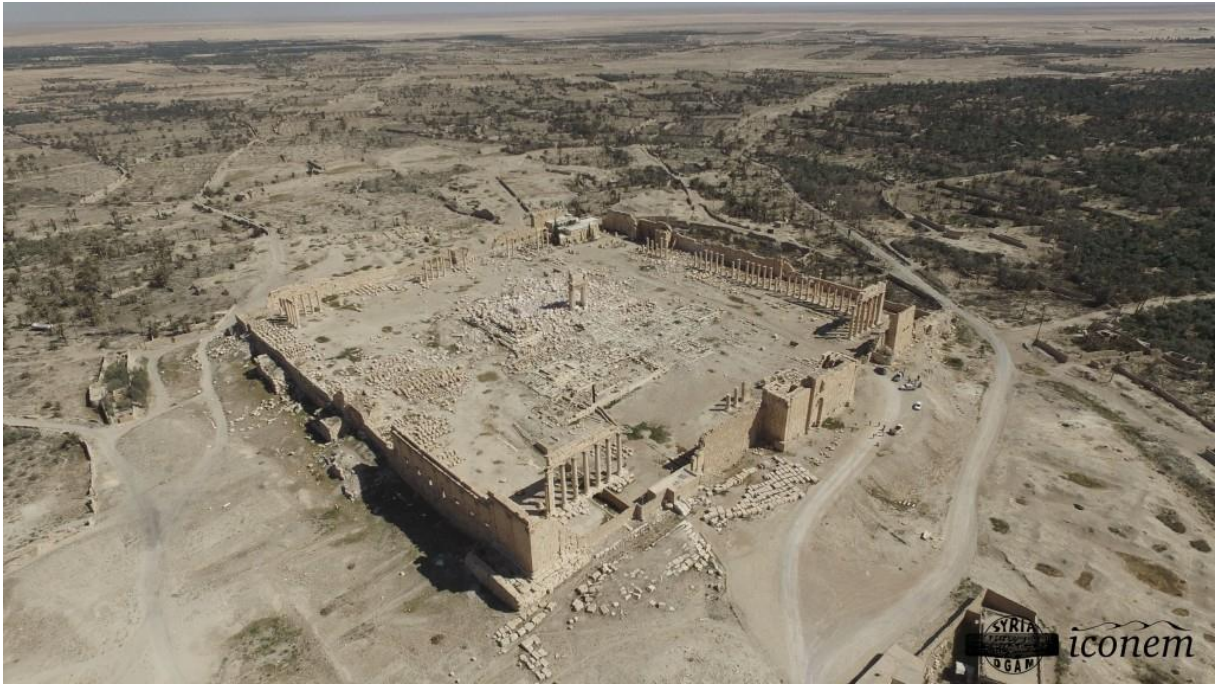
Fig. 3: Aerial photo of the Ba'al Temple (April 2016)