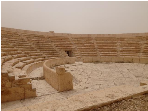
Fig 13: Amphitheatre