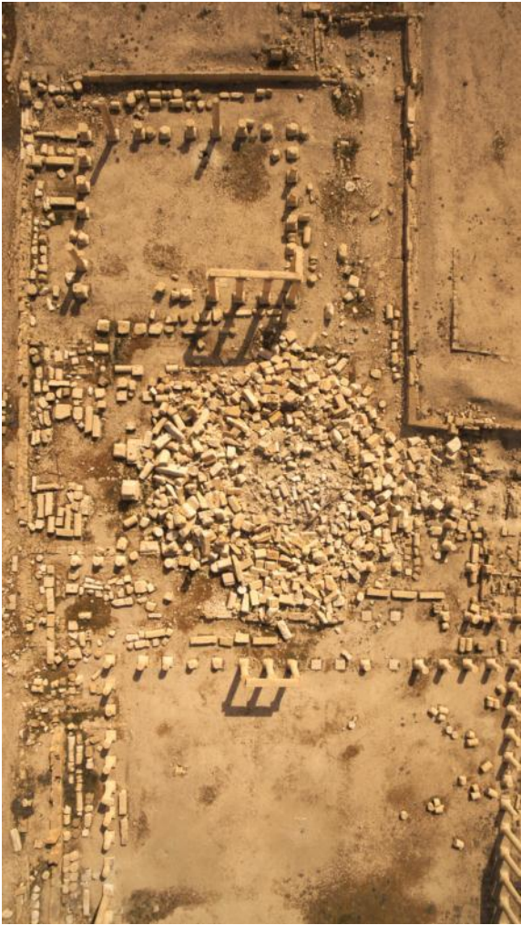
Fig.4: Aerial photo of the Ba'al Shamin Temple (April 2016)