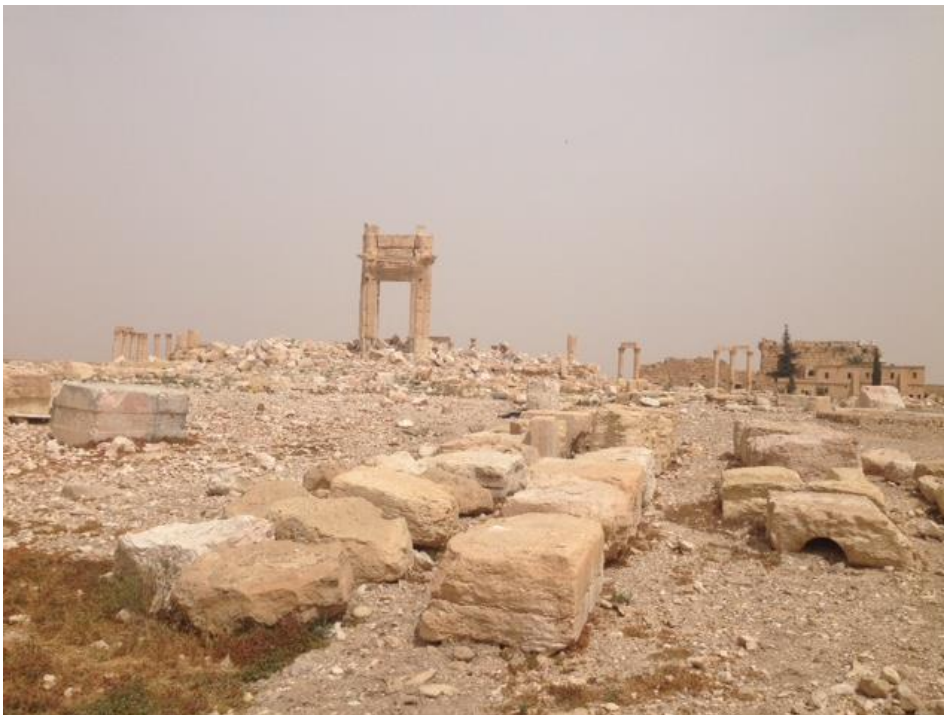
Fig 16: Destroyed Cella of the Temple of Bel (Ba'al)