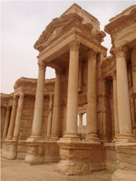
Fig 14: Amphitheatre