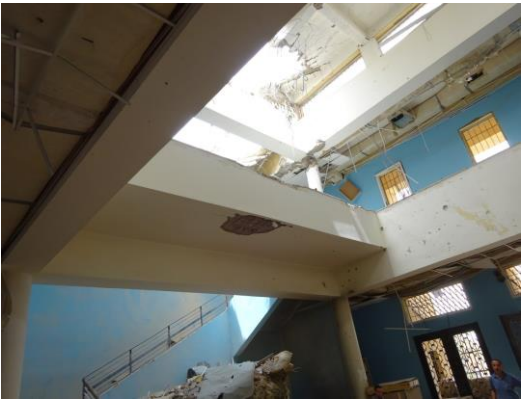
Fig 7: Museum interior