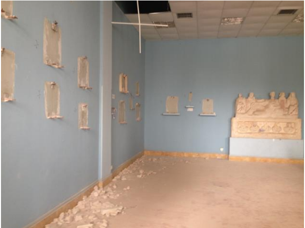
Fig7: Museum collections (evacuated and looted)