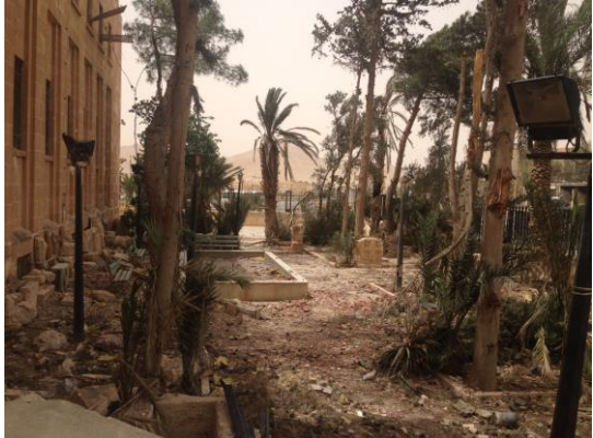
Fig 6: Museum garden