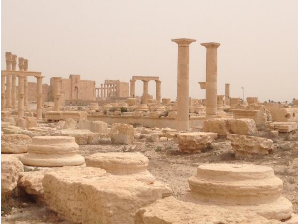
Fig 12: Overview of the site