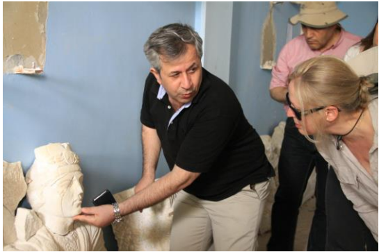
Fig 10: Assembling vandalized fragments