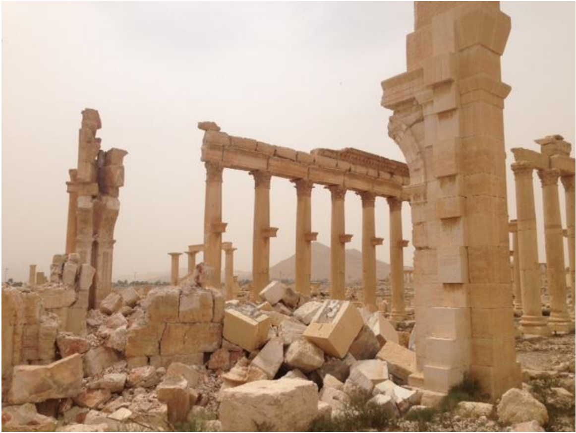
Fig 11: Destroyed Triumphal Arch