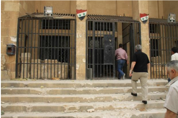
Fig 5: Museum entrance