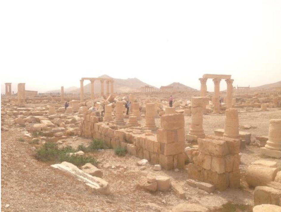
Fig 15: Destroyed Cella of the Ba'al Shamin Temple