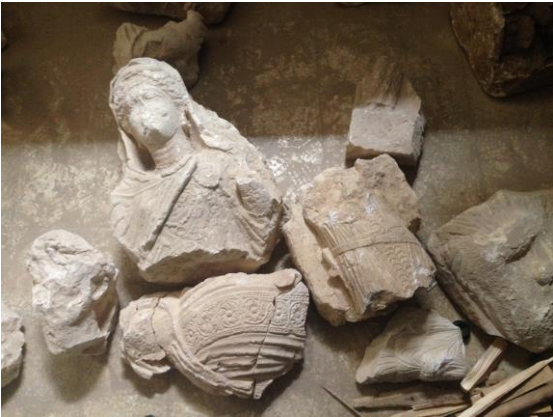
Fig9: Current sorting of artifacts in museum storage