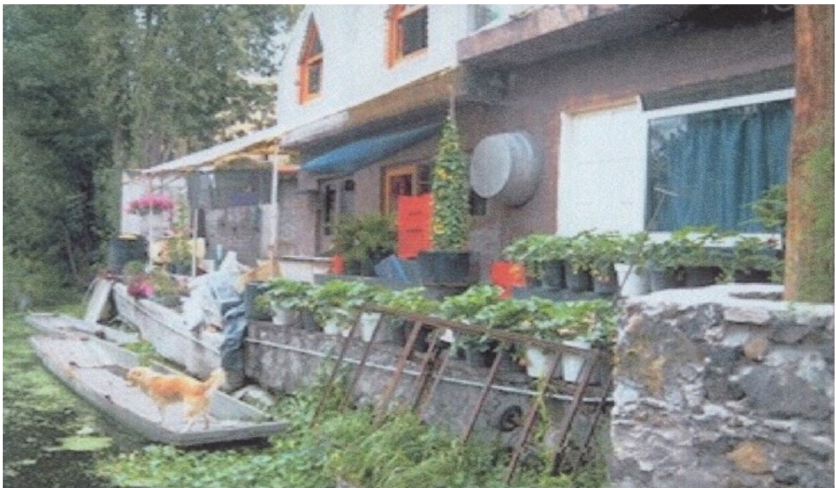
Informal settlements along a canal