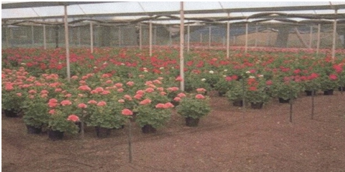
Greenhouses built on chinampas for intensive farming (Pictures taken from the study on guidelines for the management plan)