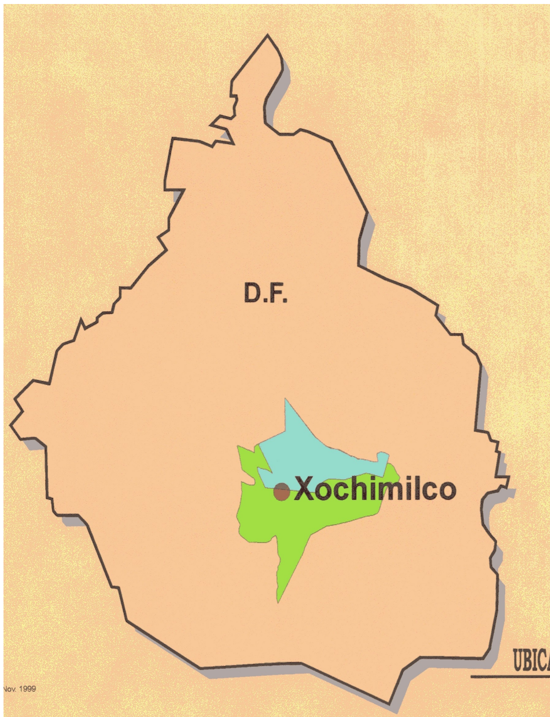
LOCATION OF THE DELEGATION OF XOCHIMILCO IN THE FEDERAL DISTRICT