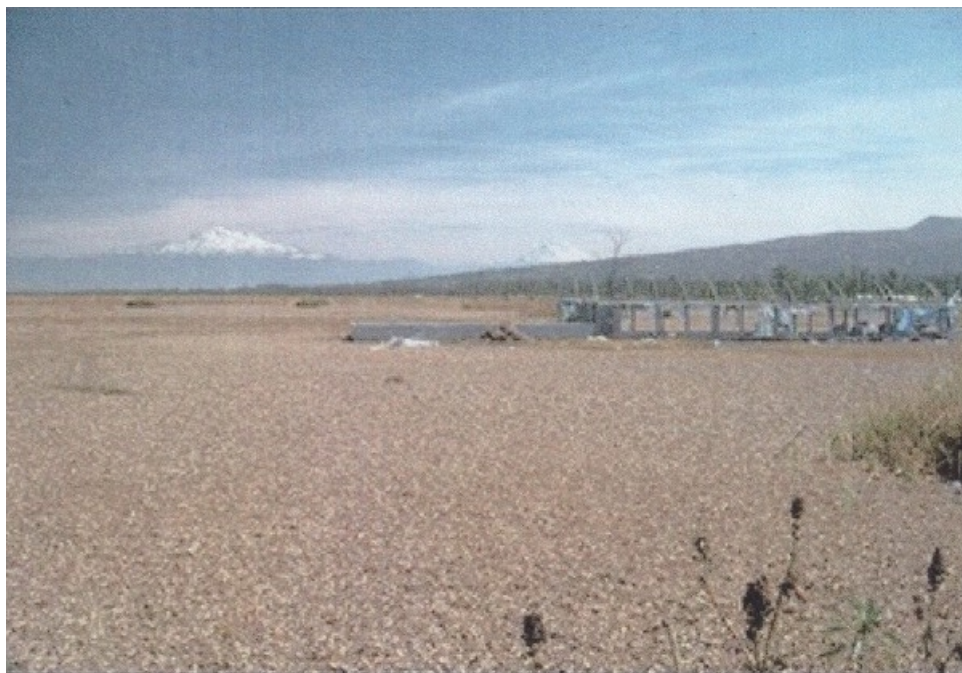
Photo 2 Southern chinampas Area with low water level