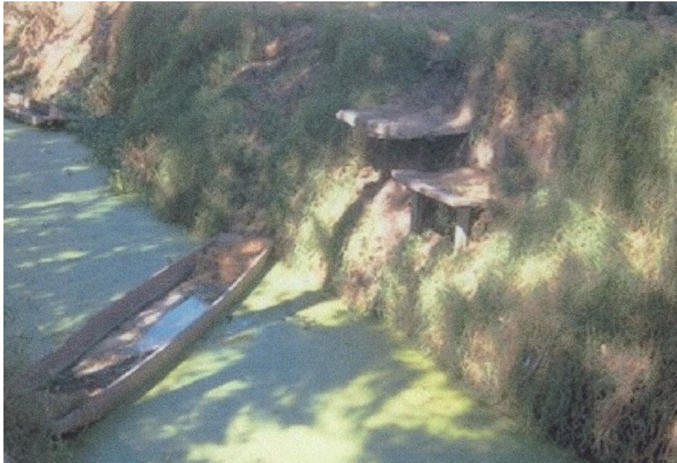
Photo 1 Central chinampas Area with collapsing land and flooding