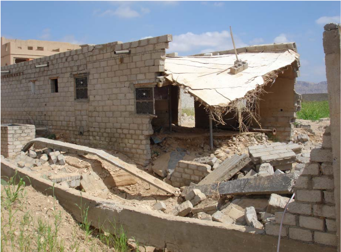
Damages caused as a result of the flood in a house situated in the wadi