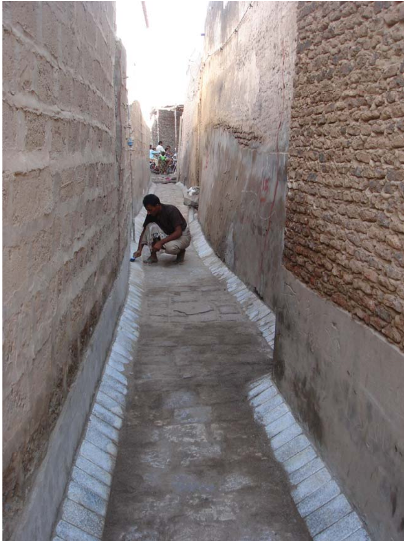
Pavement pilot project in Zabid.