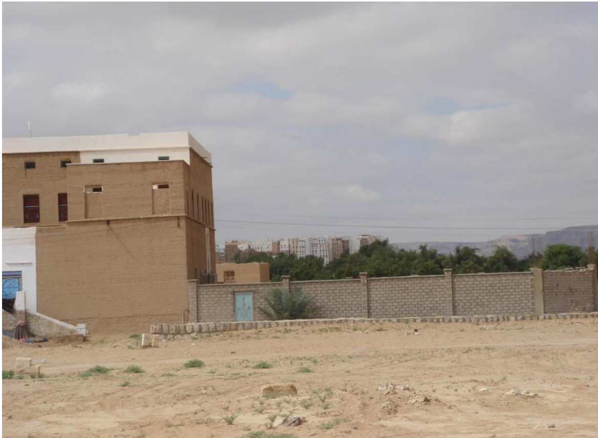
New construction in Shugaia with Shibam in the background