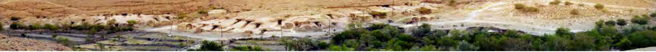
Fig.2.2 Seasonal rivers