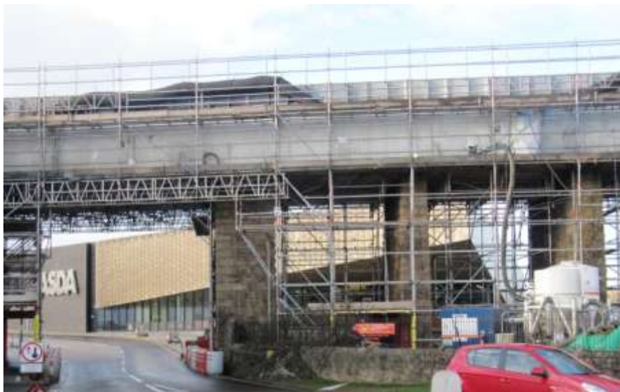
View of supermarket through viaduct (scaffold due to unrelated works) from Carnsew Road at Foundry Square. Source: H Lardner 28 January 2015