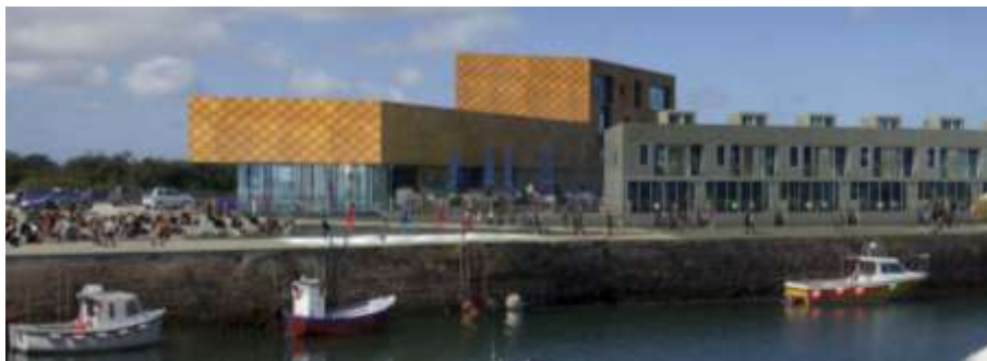
View of the consented development not yet built on South Quay.