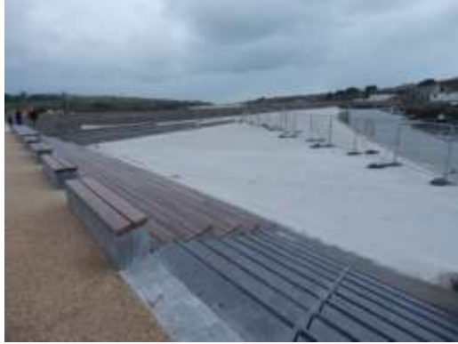
View of flood protection platform on South Quay from various vantage points Source: J King 28 January 2015