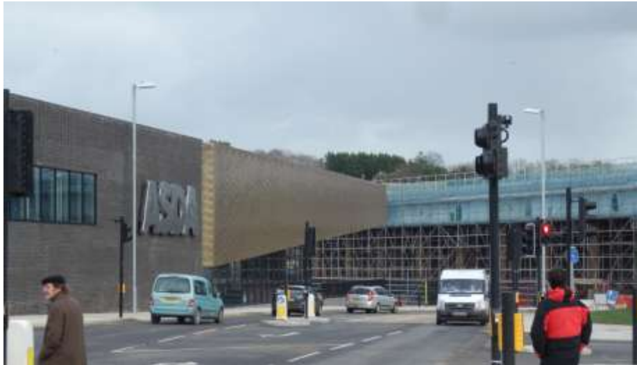
Closer view of the relationship between the overhang and the viaduct Source: J King 28 January 2015