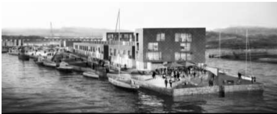
View of the consented development not yet built on South Quay.

In addition, the State Party reports that developers have made an application for an increased intensity in the retail use which was previously permitted on the former Harvey's Foundry car park opposite South Quay. This application is expected to be submitted shortly.