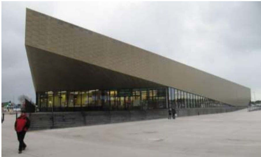
View of supermarket from entry on South Quay. Source: H Lardner 28 January 2015