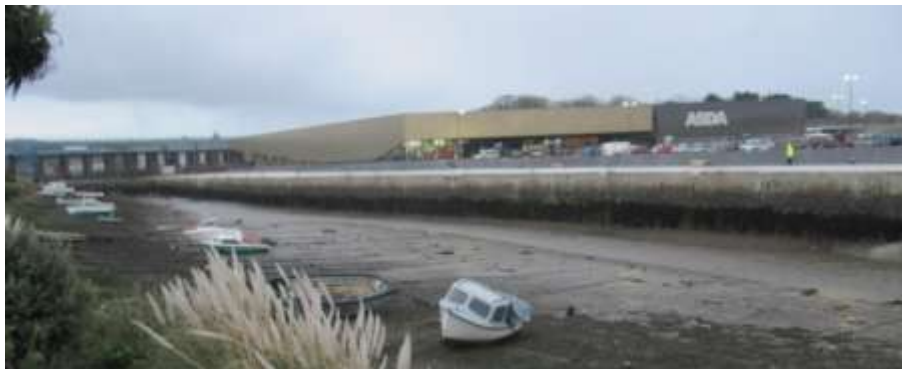
View of supermarket on South Quay from Penpol Terrace. Source: H Lardner 28 January 2015

The supermarket is a contemporary, large box design with open-air parking, on South Quay. The height of this building is just below the height of the railway viaduct that separates the quay from Foundry Square. The supermarket is located in the southern part of the quay, closest to the railway viaduct and Foundry Square. The new constructions on the quay are on a platform approximately 6 meters above datum (approximately 2 meters higher than the existing quay) to avoid flood levels (see above).