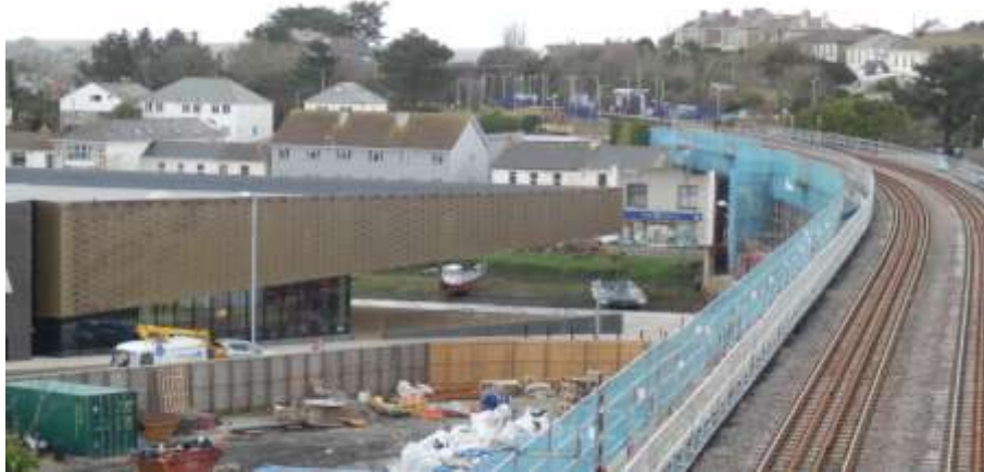
View of supermarket from the viaduct.