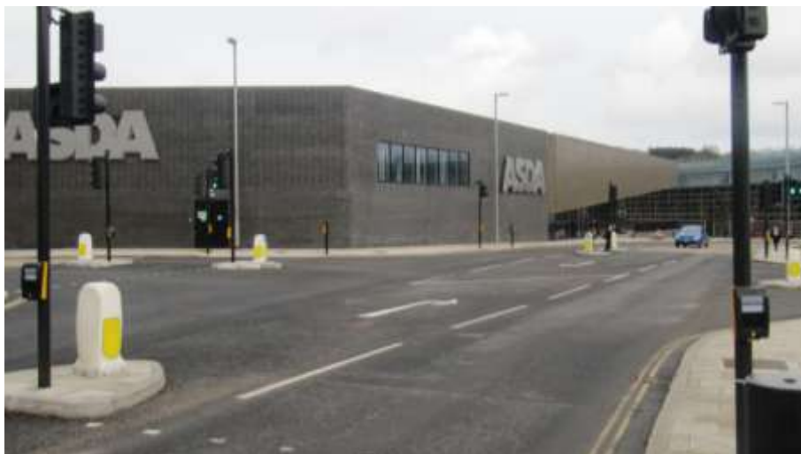
View of supermarket from edge of South Quay at Carnsew Road. Source: H Lardner 28 January 2015