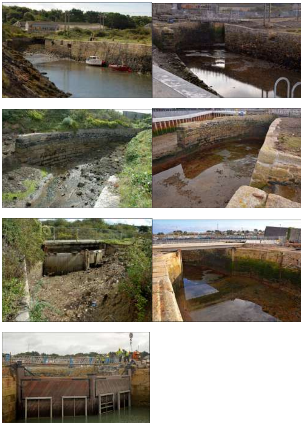
Before and After photographs of the conservation work done on the sluicing system

As part of the development of the supermarket, repairs were carried out on the Carnsew sluice and training wall and the sluice gate, as can be seen from the following before and after pictures. The mission was informed that the sluicing would begin again in the spring of 2015, 40 years after it was last carried out.