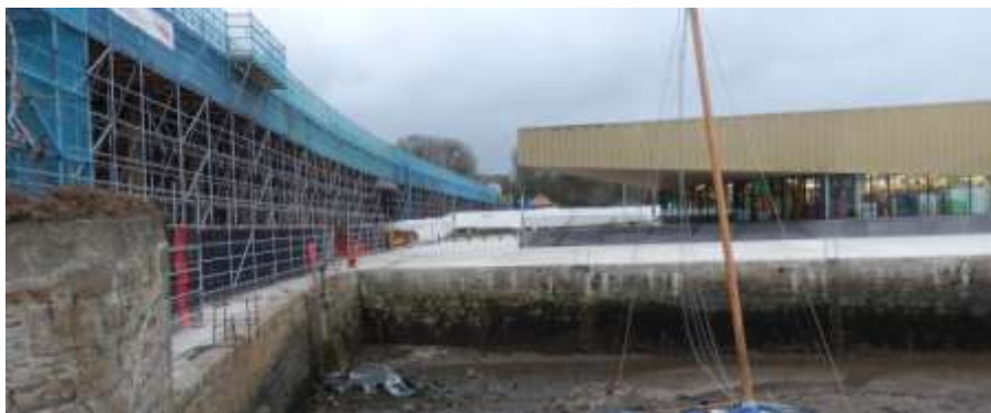
Closer view of supermarket entrance on South Quay from Penpol Terrace. Source: J King 28 January 2015