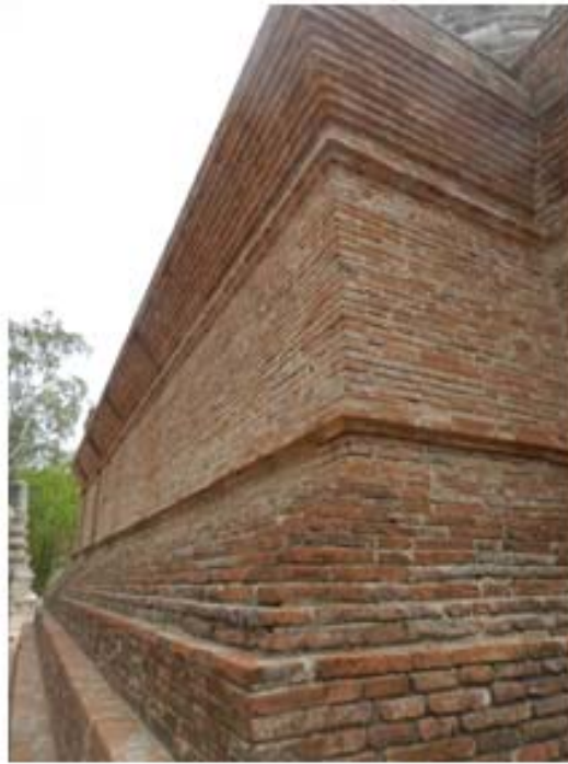
Reconstructed masonry, perhaps camouflaging the concrete tie beams?