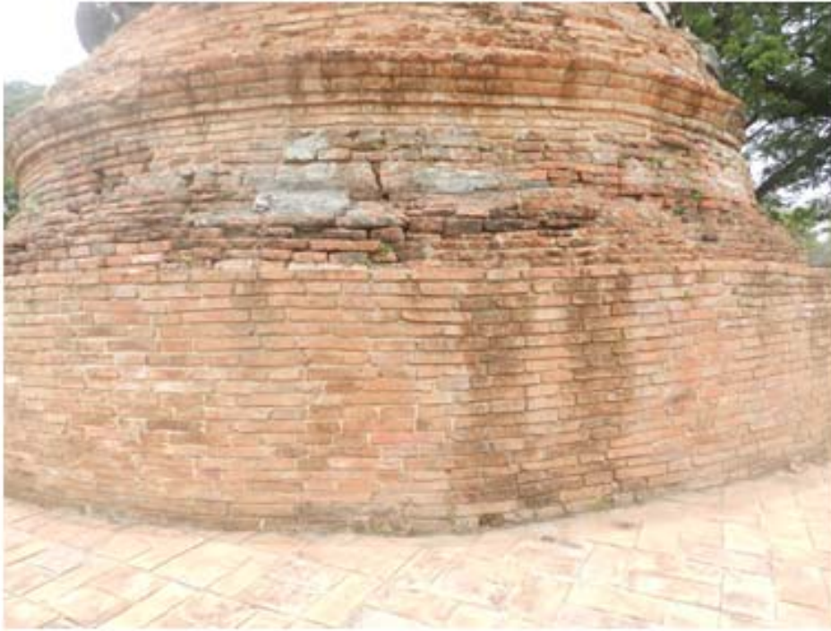
Reconstructed base - undulating brick layers not the best of workmanship