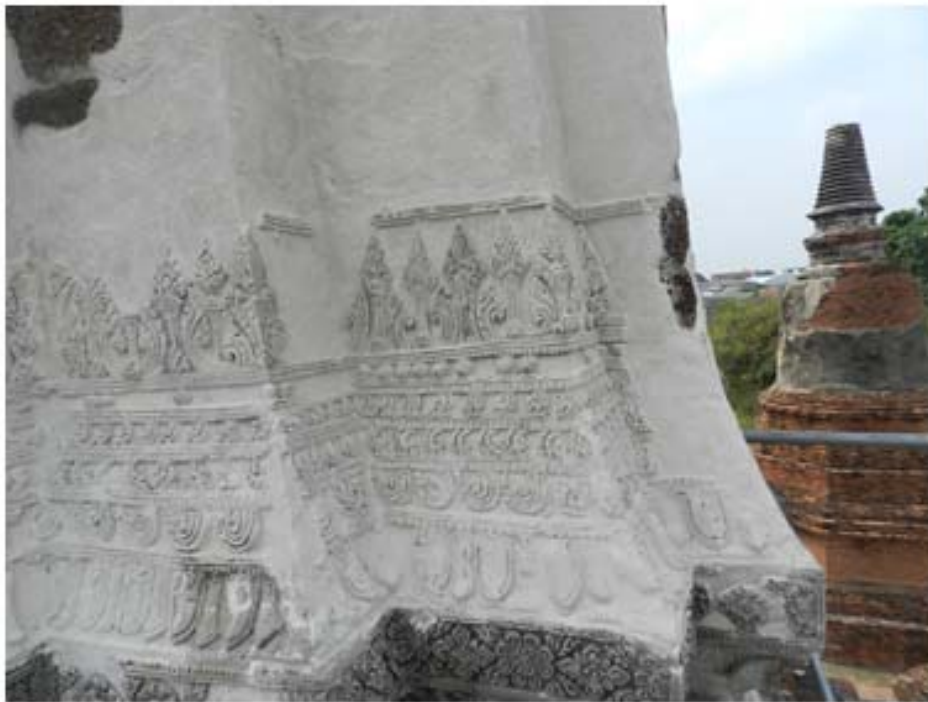
Recent lime render work