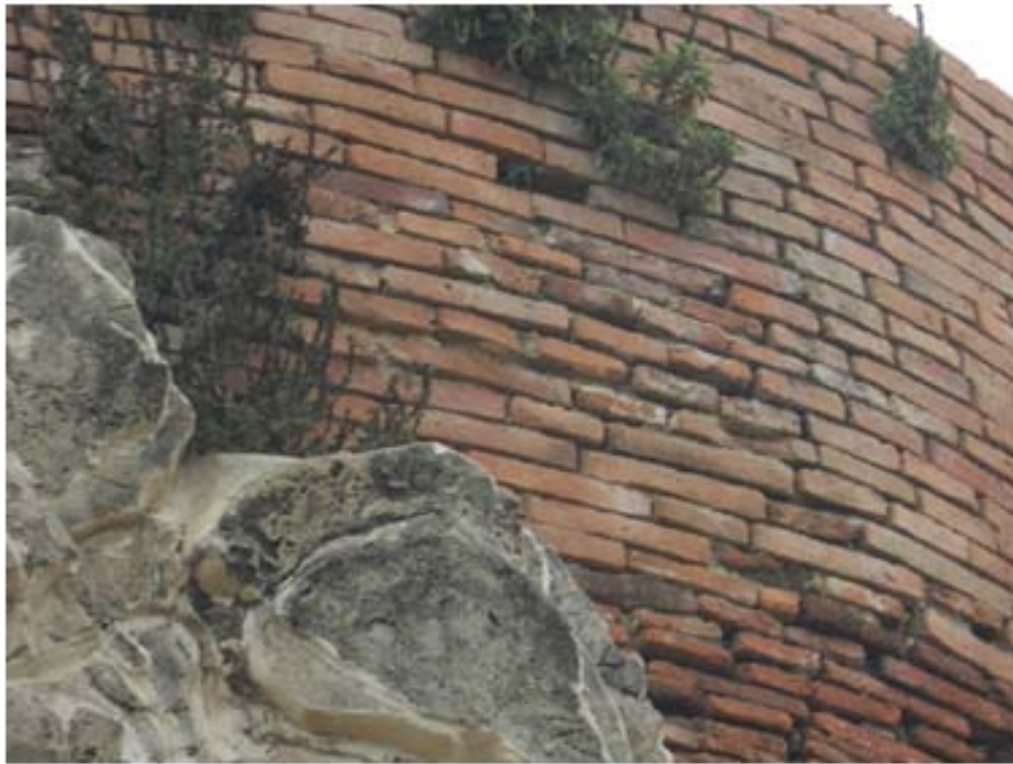
Pointing missing on the brick monument , a lot of vegetation growth then happens from here as seen in the picture