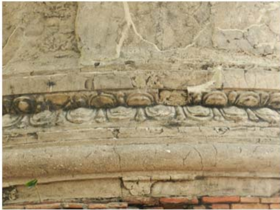
Traces of original render and decorations speaks of high quality and standard