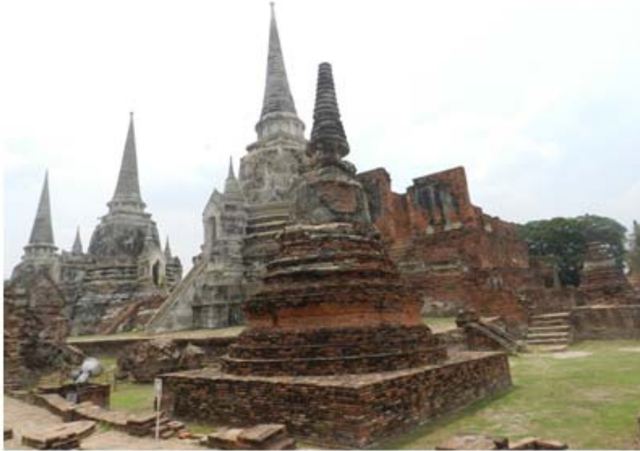
New square bases and some reconstruction possibly camouflaging the concrete tie beams?