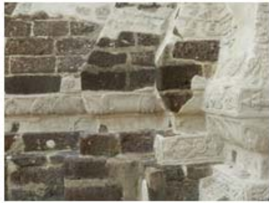
Old and new lime mortar decorations