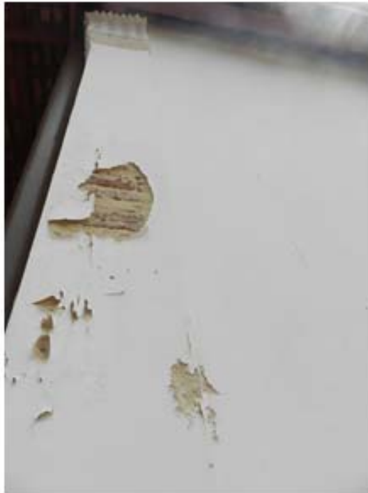
Flaking of newly done plaster perhaps due to synthetic paint??