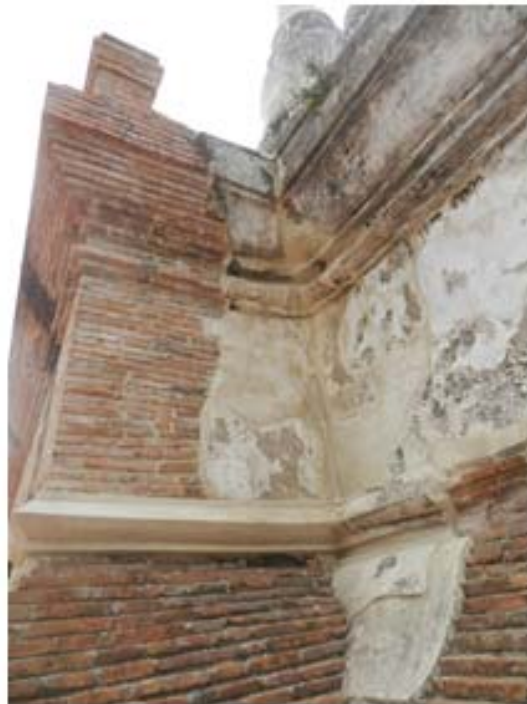
Conservation philosophy is not clear where to stop ?