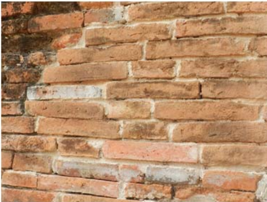
In the new brick laying work there is a lot of room for improvement