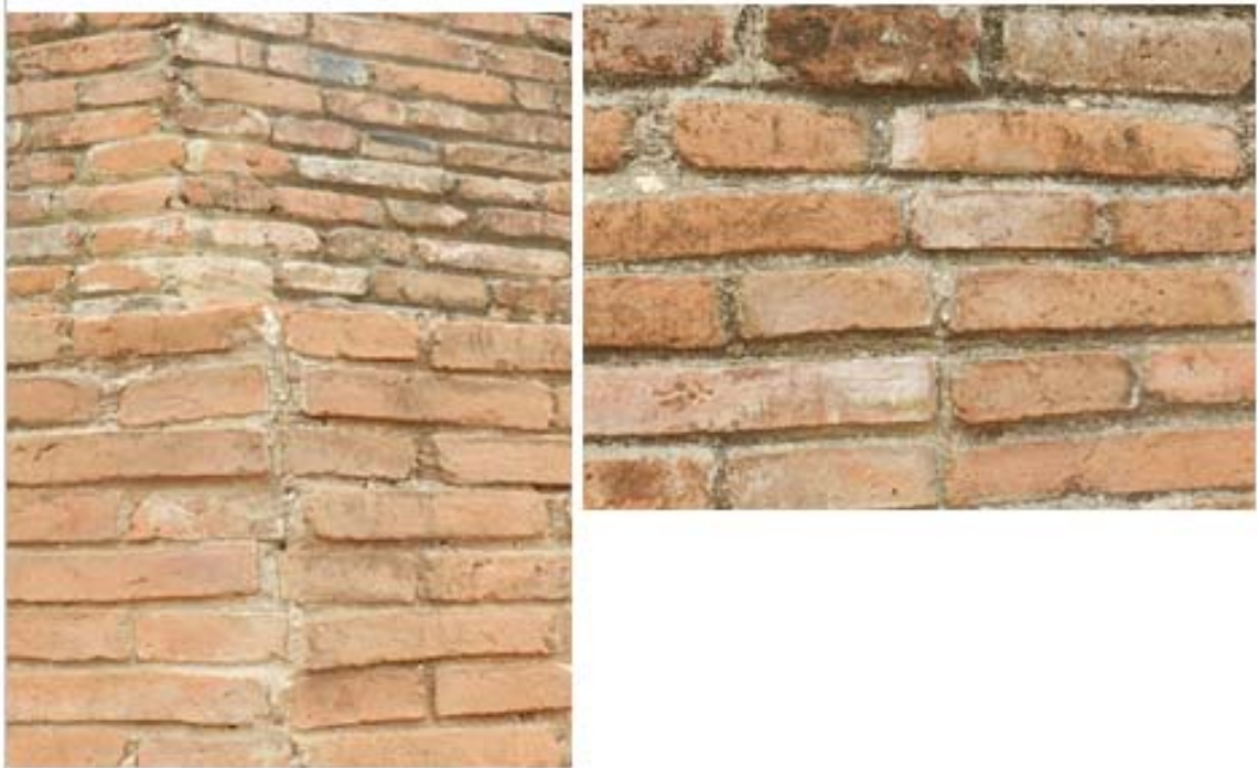
Straight Joints in recent works reflect poor workmanship