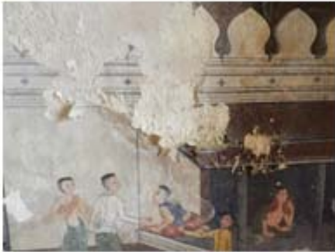
Rising dampness damaging the murals