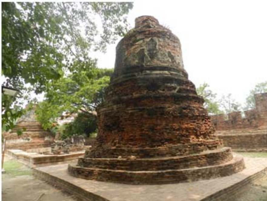
New reconstructed plinths – were these essential for structural strengthening?