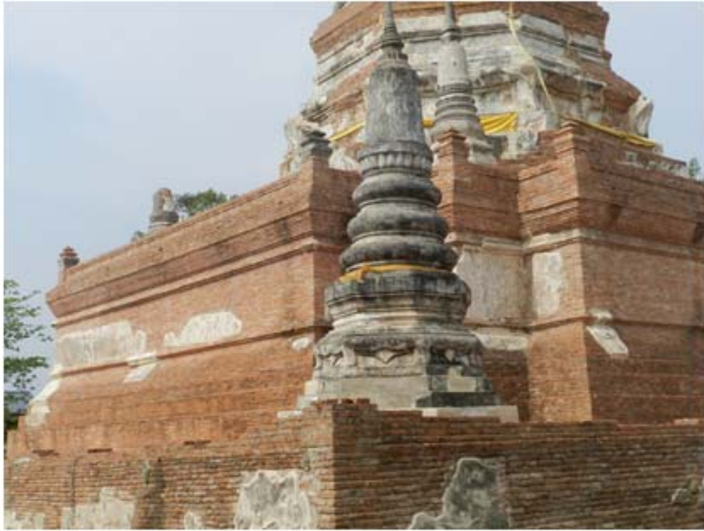
A lot of reconstruction is noticed with re-plastering in patches