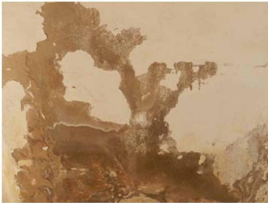
Flaking of new paint