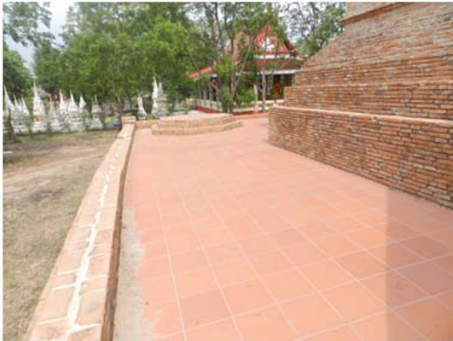
New tiles laid challenges the authenticity of monument. Need to be removed and replaced with brick paving