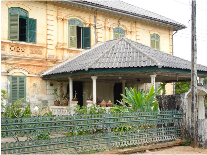
9. Modern addition to a prominent colonial building built in 1926 in Champasak town.