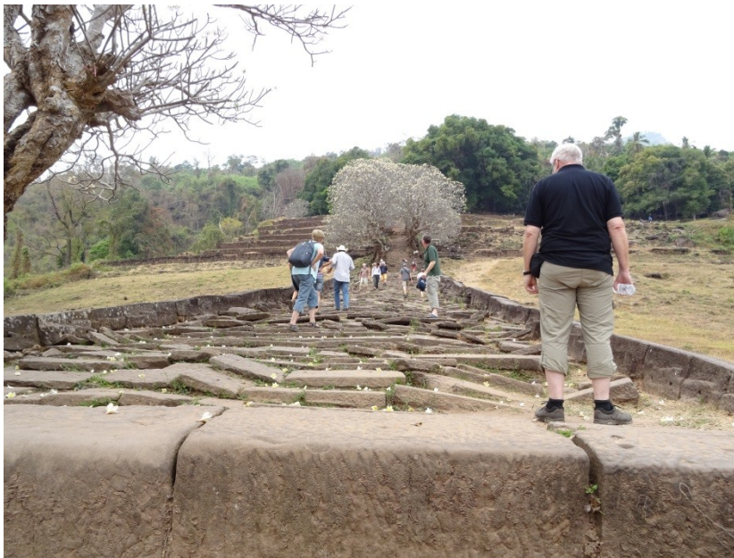
14. The central Vat Phou path surface, stairs and terraces would benefit from further consolidation (source: W. Logan).