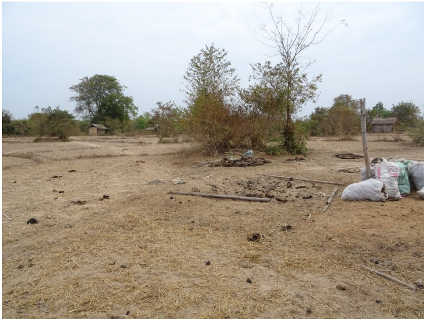
6. Route 14A was planned to run 24 metres from this north-western corner of the fourth enclosure wall of the Ancient City.