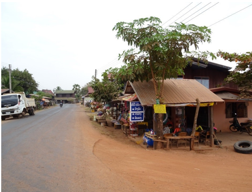
8. Traffic diversion through the Ancient City produces vibrations that may be damaging buried archaeological remains and causing visual, noise and air pollution (source: W. Logan).