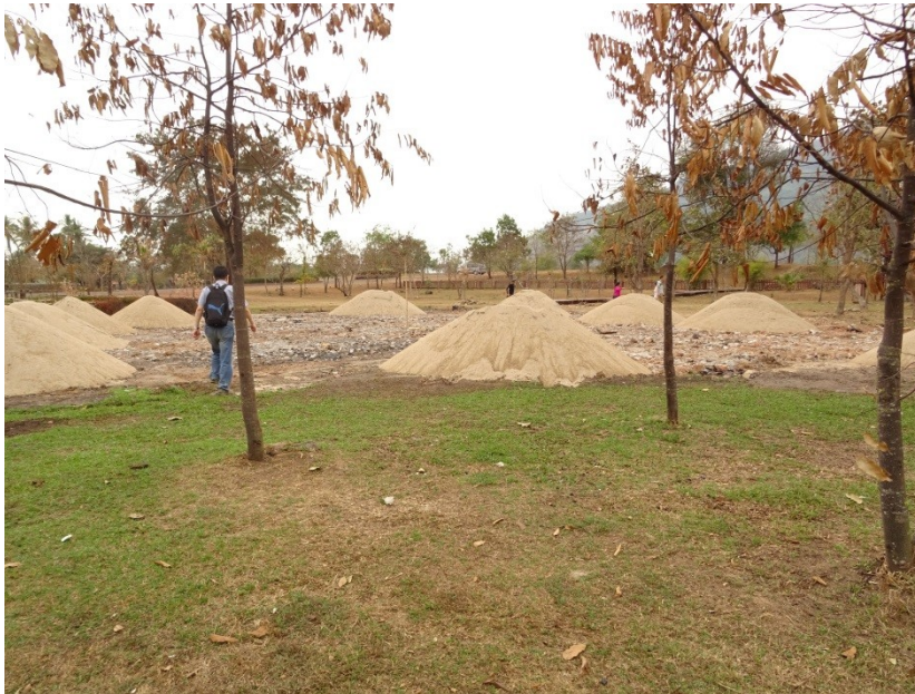
12. Location of the 2003 visitor pavilion destroyed by fire in early February 2015.