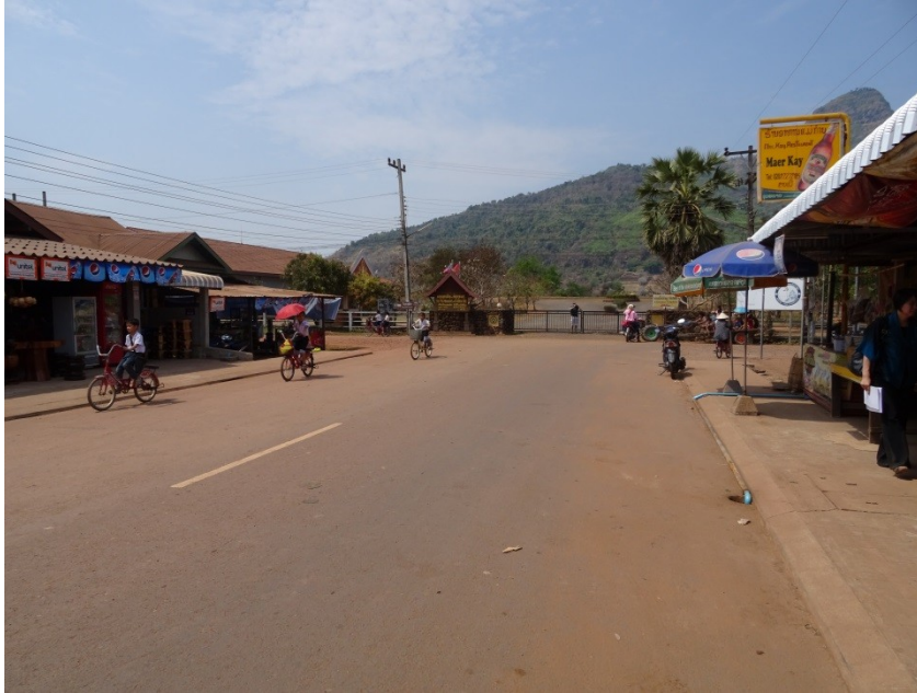
5. The road connecting Route 14A with the entrance of the Vat Phou monumental complex (Zone 4), now enlarged to a 9m carriageway with pavements on both sides, totalling 12m in width.