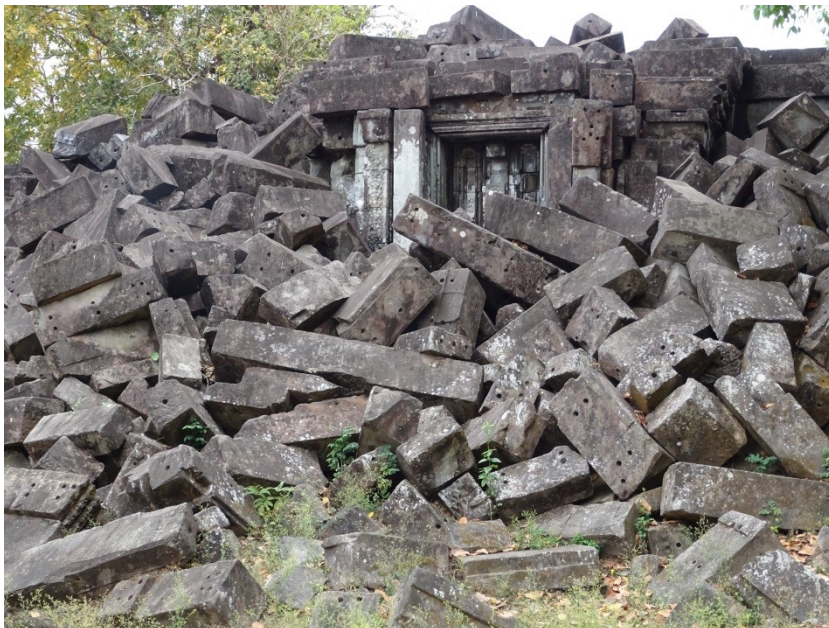
16. Hong Nang Sida is being reassembled in a Korean-funded project.