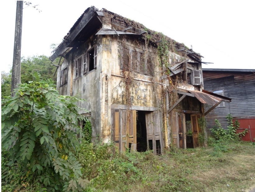
11. One of Champasak town's last remaining colonial-style buildings in derelict condition.