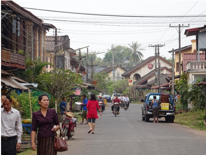
7. The busy district road through Champasak town.