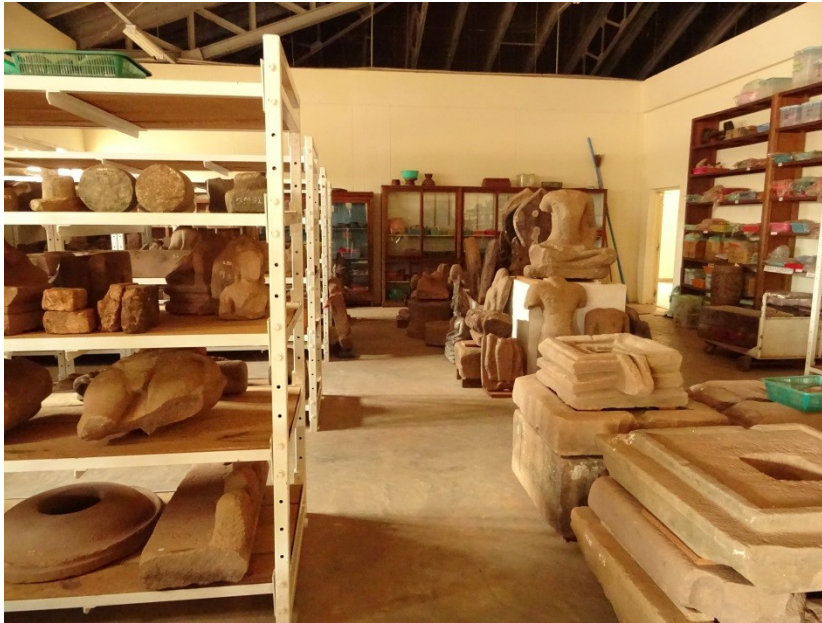
13. The concrete-floored Vat Phou museum laboratory and storage room.