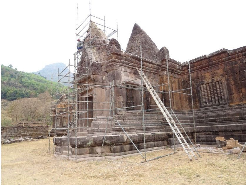
15. Restoration of the North Quadrangle by the India-Laos Cooperation Project is now largely completed.