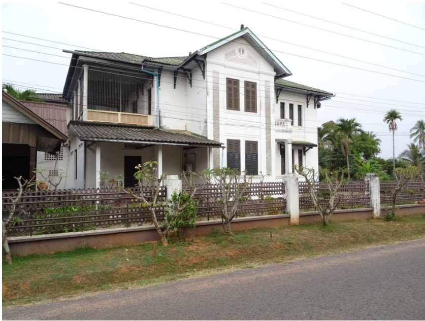
10. Large late-colonial building dating from 1952 in Champasak town.