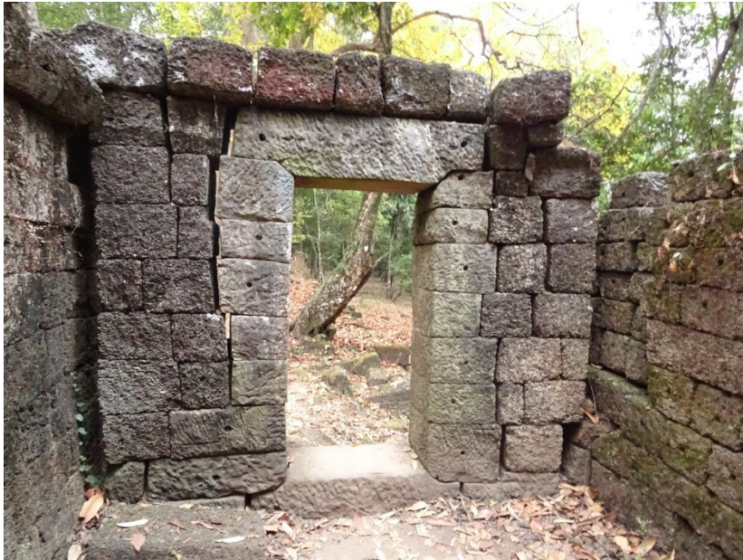
17. Tomo Temple, on the east side of the Mekong, has yet to receive major funding for restoration