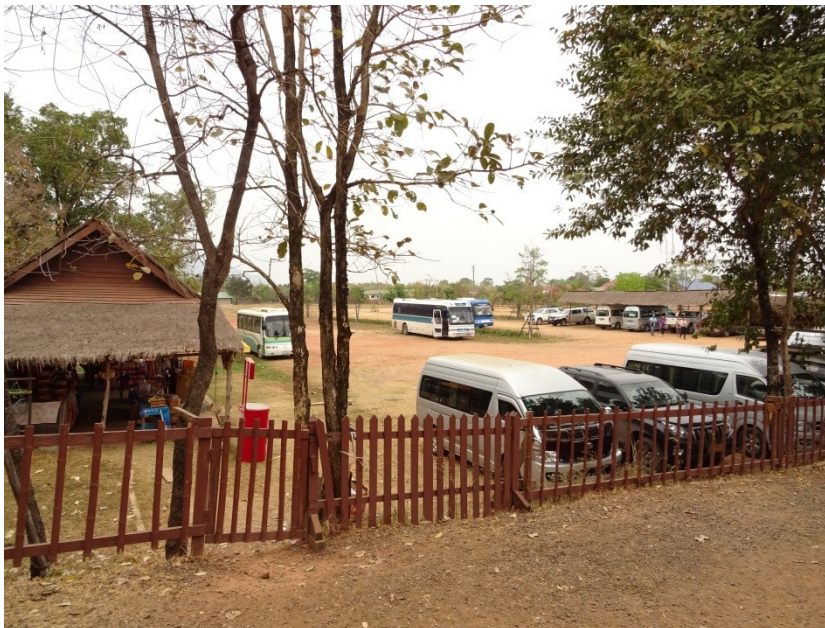
18. Tourist cars and coaches in the current parking areas at the entrance to the Vat Phou Monumental Zone 4.