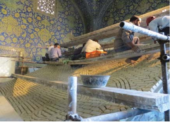
Figure 6. Stabilization of the dome's decorations