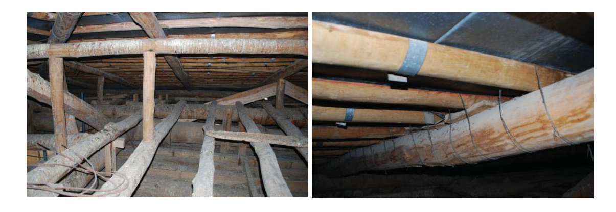
Figure 4. Stabilization of the buttresses

Stabilization of the buttresses of Ali Gapou ceiling