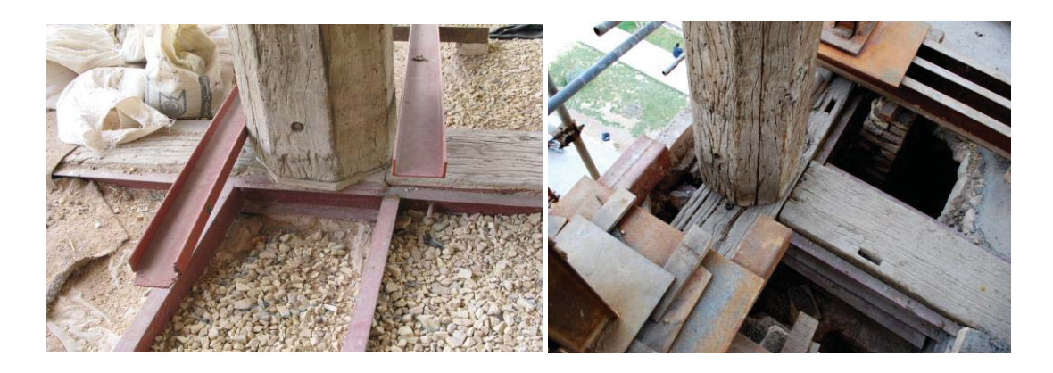
Figure 3. Stabilization of the porch

O Stabilization of the columned porch of Ali Gapou