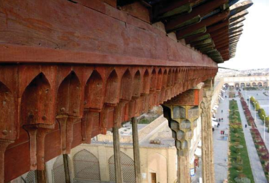
Figure 5. Stabilization of the sequential decorations