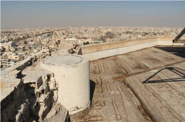
Figure 2. Demolition of the upper stories of Jahan nama building

5. Requests the State Party to keep the World Heritage Centre informed about any construction and emerging major development proposals in Esfahan in line with paragraph 172 of the Operational Guidelines;