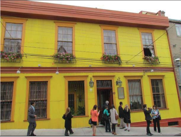
Cerro Alegre. Restored building for hotel use