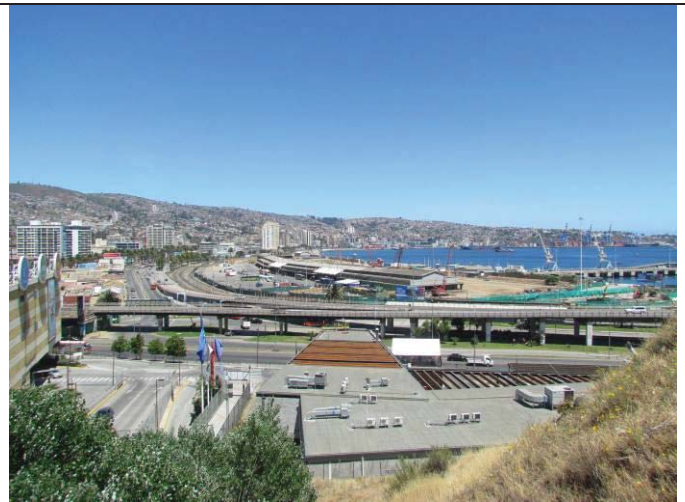
Puerto Barón and Bolívar Warehouses from Cerro Barón.