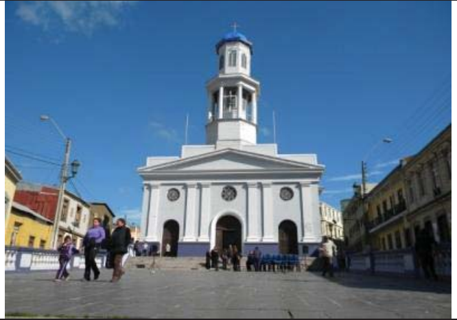
The Matrix Church Matriz. Recently restored.