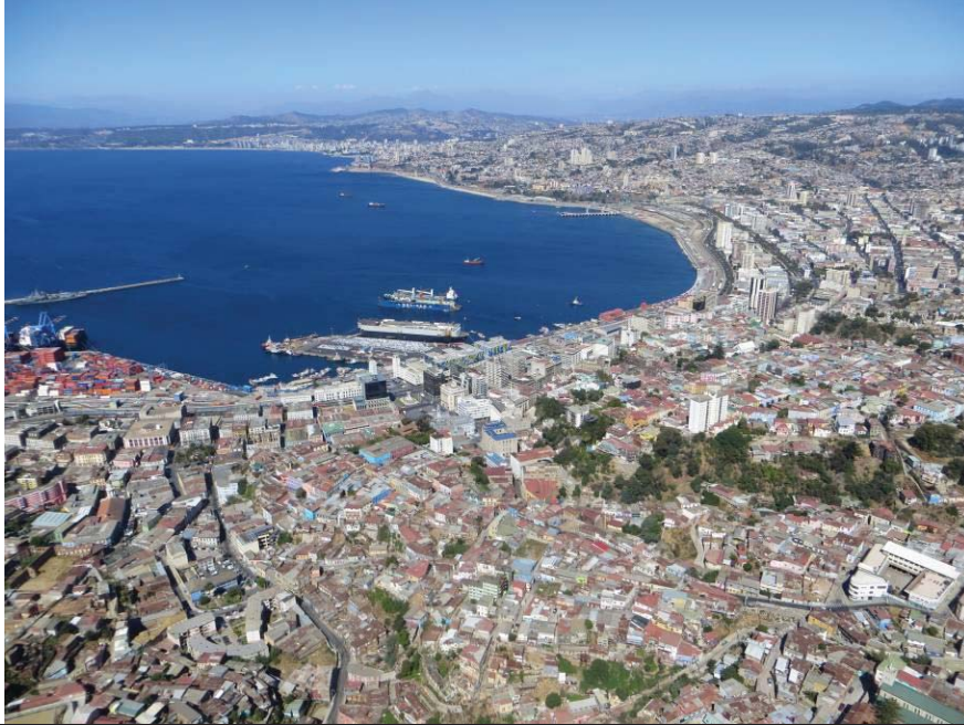
Bay, Port and City. In the middle: the World Heritage Site.