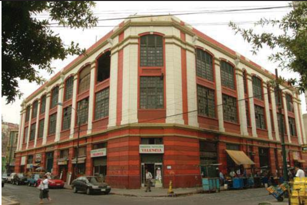
Mercado Puerto. Before its destruction.