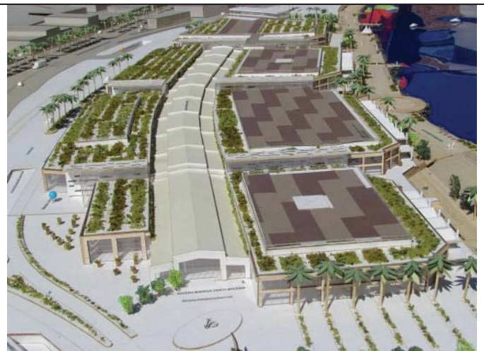
Model of the Baron Mall. The Bolívar Warehouses are subsumed within the Mall project.