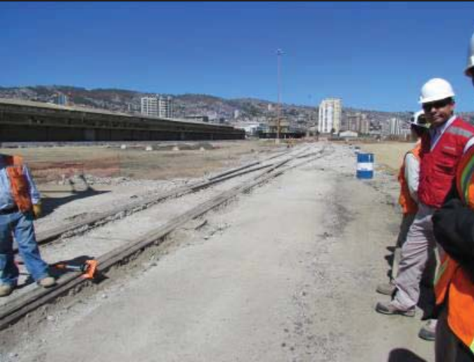
Archaeological evidence of railway infrastructure next to Bolívar Warehouses.