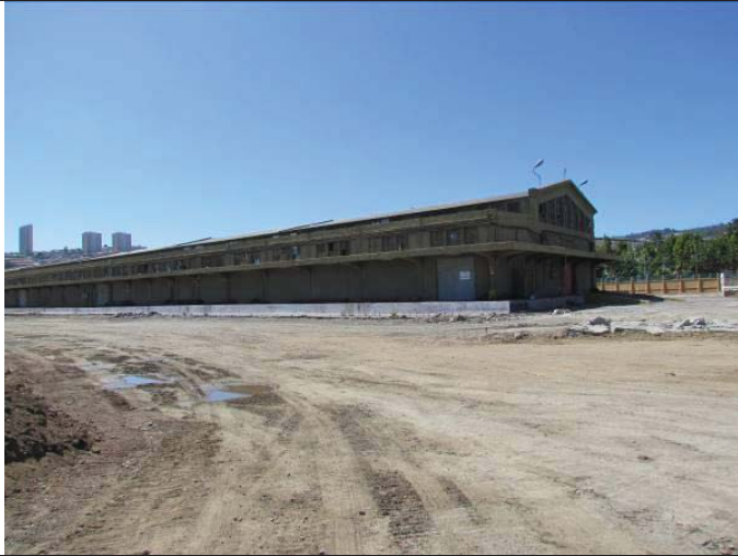
Bolívar Warehouses, sector to be demolished.