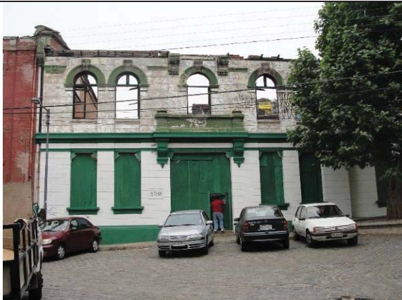
Severin Building (fuente: web). Abandoned and ruined.