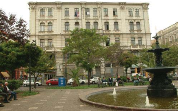
Astoreca Building, in front of Echaurren Square. An important abandoned building