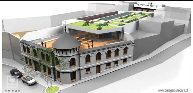
Severin Building. Recovery Project to host the Interdisciplinary Neuroscience Centre of Valparaíso (Centro Interdisciplinario de Neurociencia de Valparaíso)..