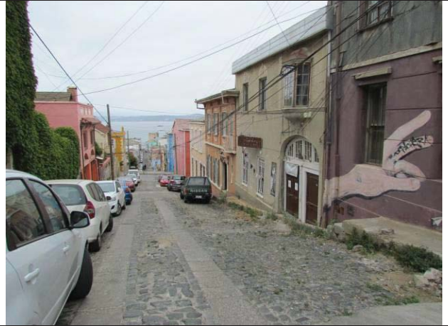
Cerro Alegre. Traditional roadway.