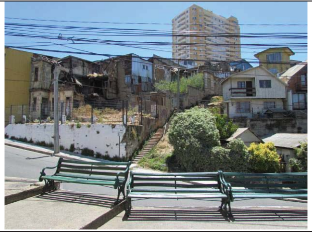
Cerro Barón (outside the WH property). Urban sector destroyed.