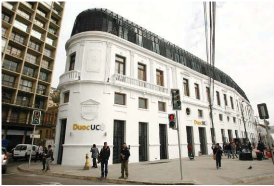
Cousiño Building. Recently restored.