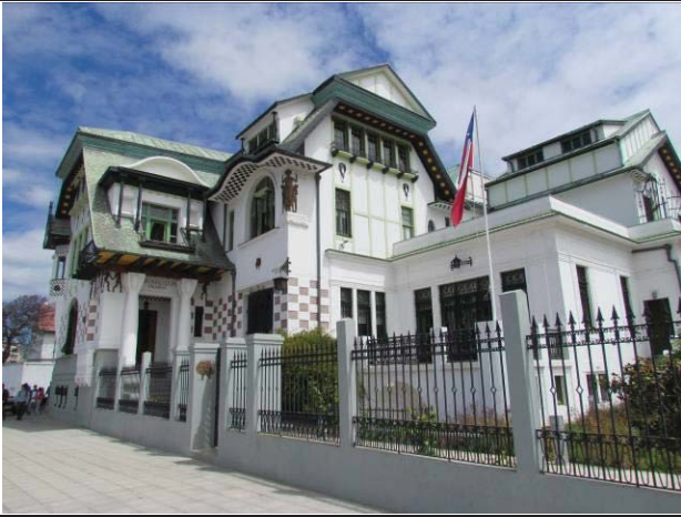
Baburizza Palace, recently restored.