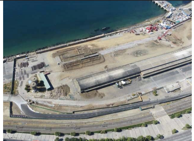
Archaeological evidences of port infrastructure, next to Bolívar Warehouses.