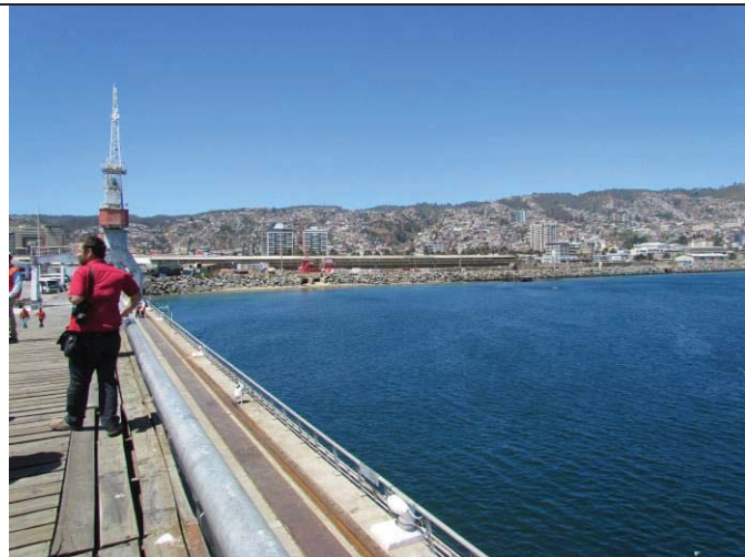
Puerto Barón and Bolívar Warehouses from Baron Pier.