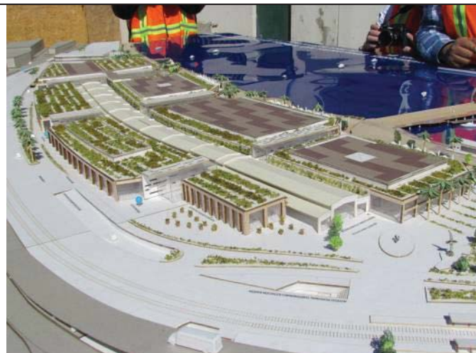
Model of the Baron Mall. The Bolívar Warehouses are subsumed within the Mall project.