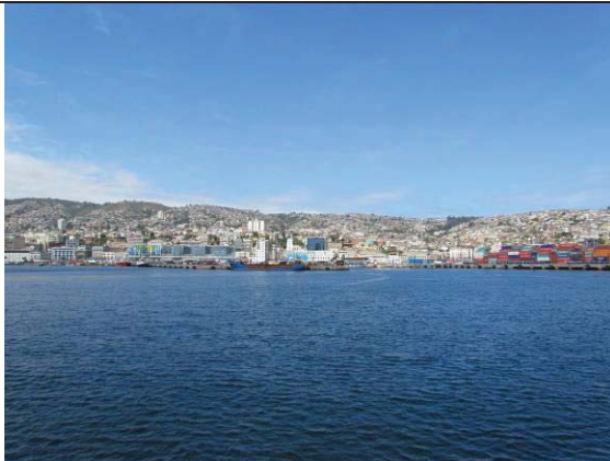
The WH Site as part of the amphitheatre.