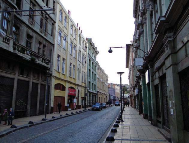
Plain: Serrano Street. Proper recovery of public space.