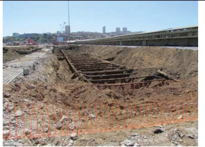
Archaeological evidence of port infrastructure next to Bolívar Warehouses.