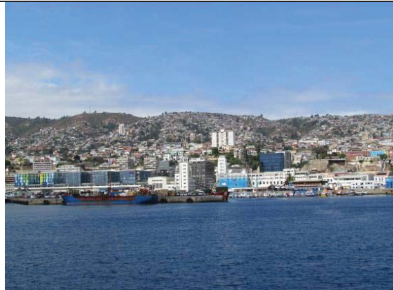
The WH Site as part of the amphitheatre.