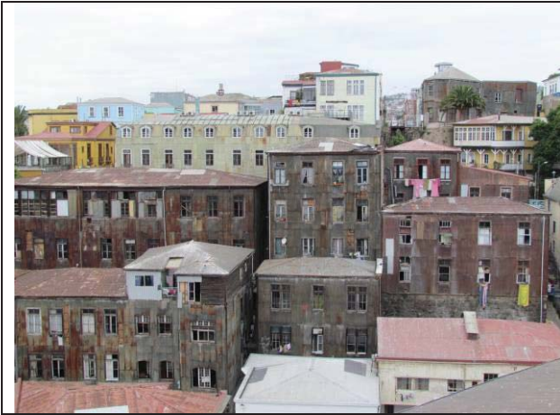
Cerro Alegre. Urban sector without recovering.