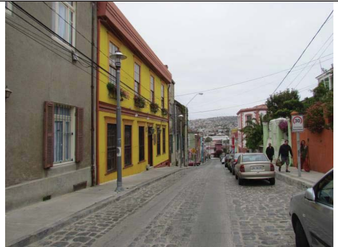
Cerro Alegre. Recovery of public space with traditional materials.