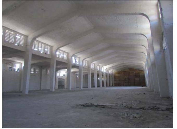
Bolívar Warehouses, sector to be demolished.