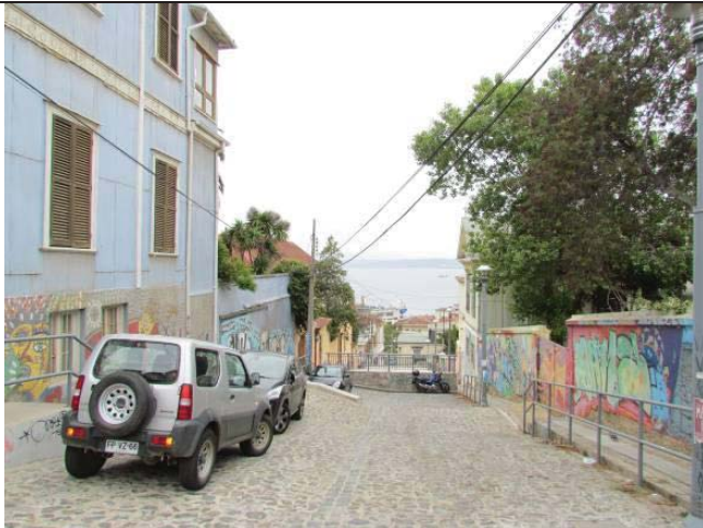
Cerro Alegre. Recovery of public space with traditional materials.