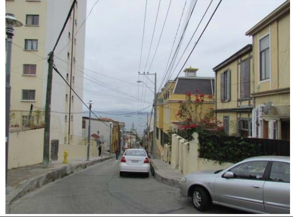
Cerro Alegre. Inappropriate renewal of public space.