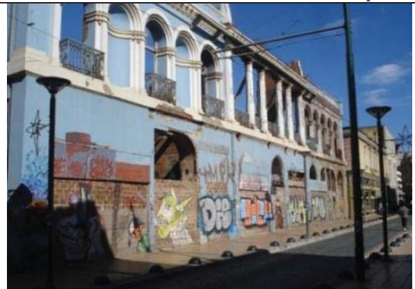
Subercaseaux Building, in Serrano Street (source: web). Destroyed by fire..