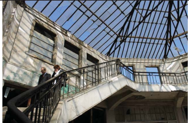
Mercado Puerto. Current status of the internal space.