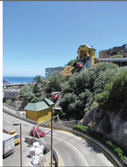
Elevador Barón, recently restored.