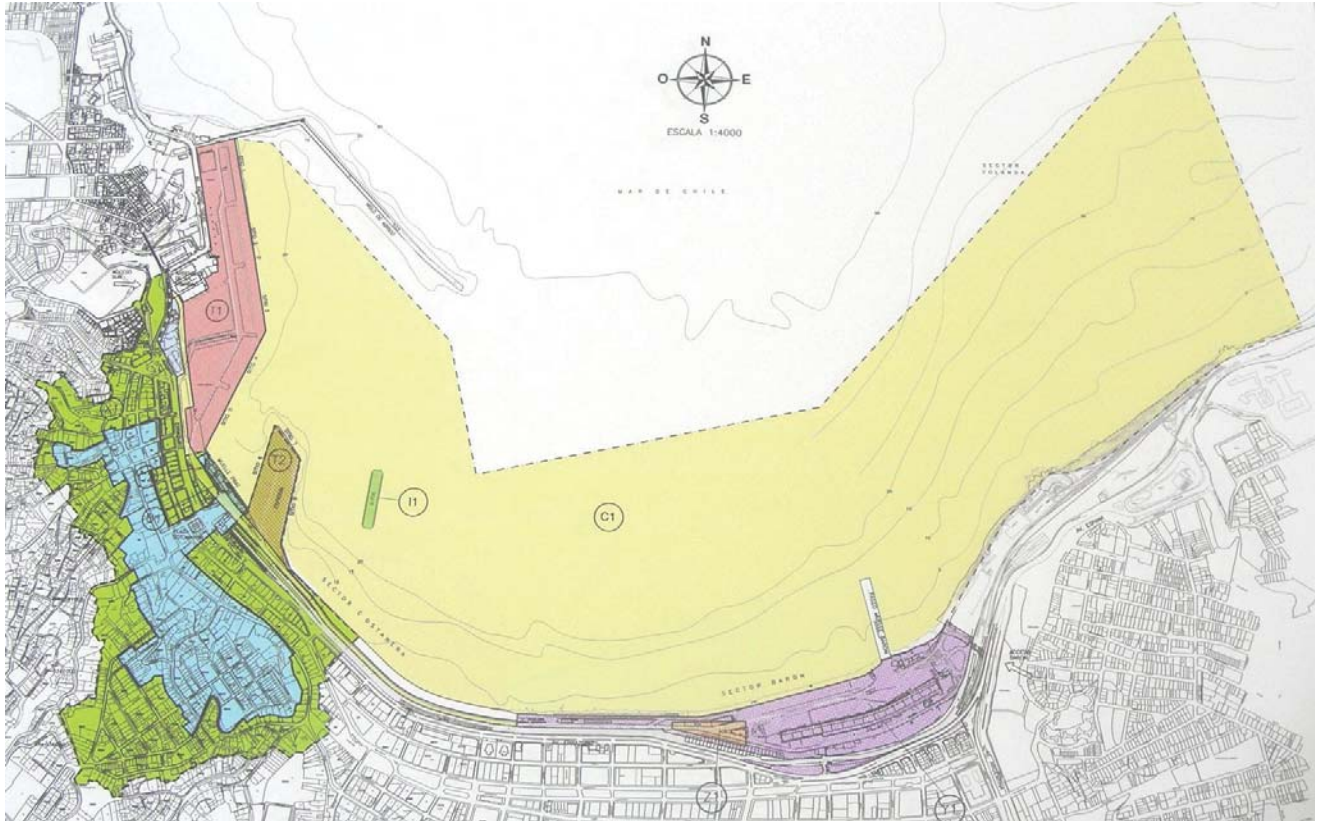
Plan showing the current situation of Puerto Valparaíso, the WH Site and its Buffer Zone (on the left), and Puerto Barón (on the right)