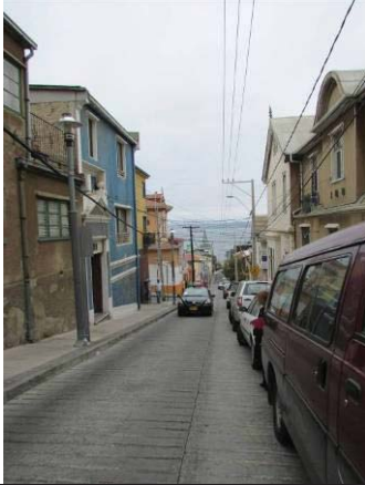
Cerro Alegre. Inappropriate renewal of public space.