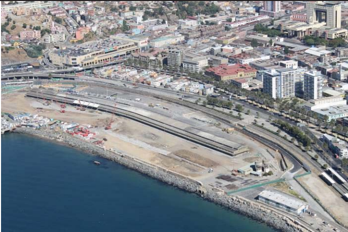
Puerto Barón and Bolívar Warehouses from the air.