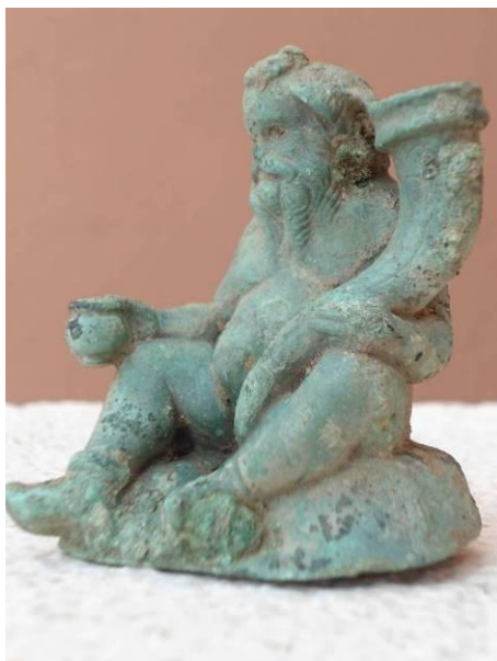
Dionysus, the bronze sculpture