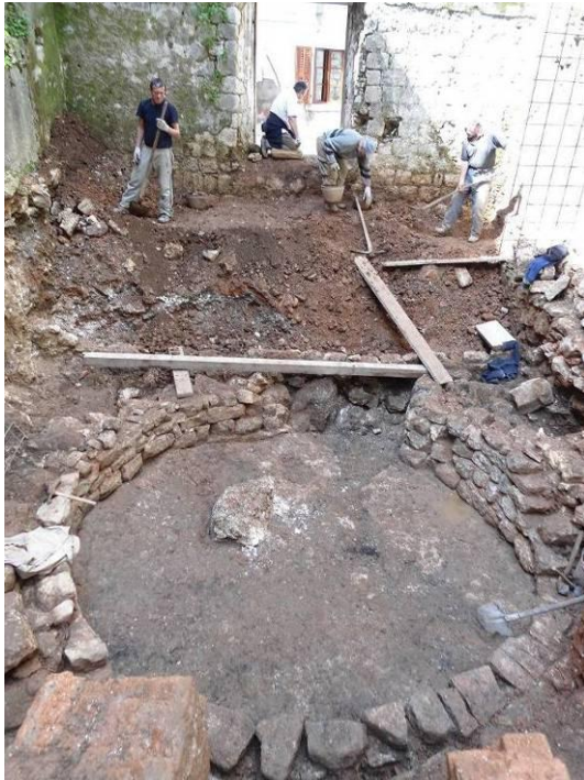
Circular finding during the research