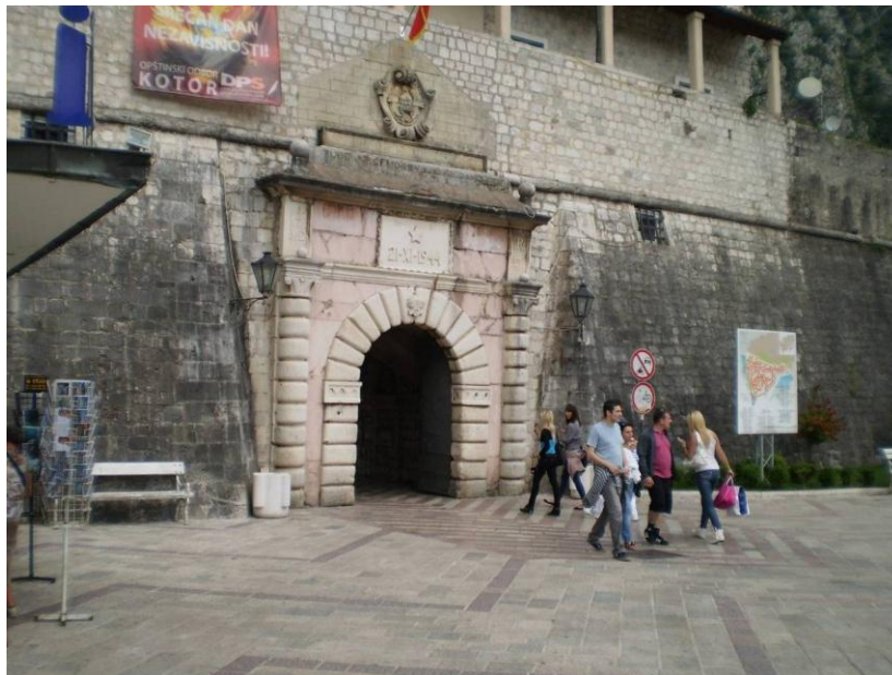
The Western town gate of Kotor