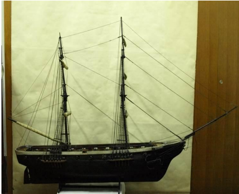
Model of sailboat „Adriana“, after the implementation of conservation measures