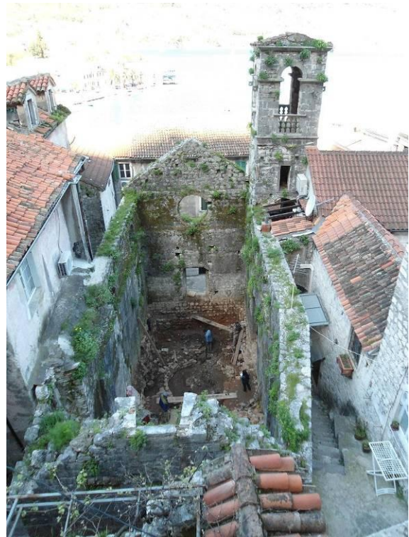
The Church during the reconstruction

After an unsuccessful siege of the city and repel on the attack, the church was not rebuilt in the same place, but the Convention Franciscan Order initiated construction of the new church and monastery in the city around 1668.