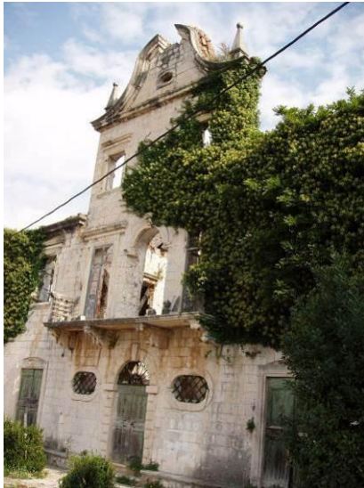
Dabinović-Kokot Palace 2004