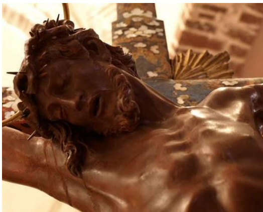
„Raspeće“, detail of the face and part of the chest after the implemented conservation measures

Creating a conservation project and implementation of conservation measures on polychrome wooden sculpture " Raspeće " by the Venetian sculptor Andrea Brustolon dimension Cross 210 x 135 x 8.7 cm, body 102 x 75 cm, first half of the eighteenth century, the Church of Blažena Djevica (the Virgin temple), Prčanj