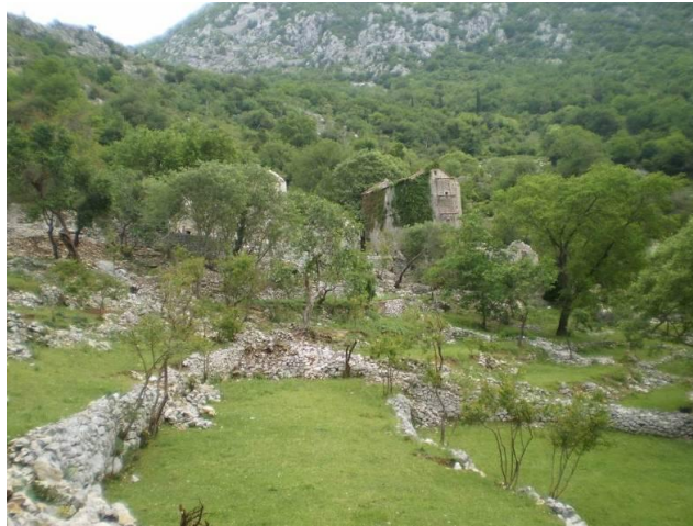
View at the complex Maali from the southwest side