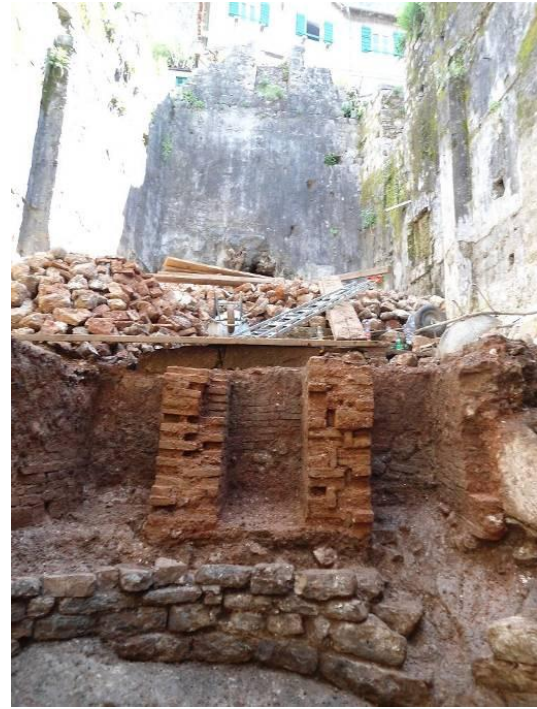
Disposition of the findings in I and II phase in relation to the interior of the Church

The working hypotheses were set in the interpretation of this finding, which will be defined closer during further studies. The assumption is that the older ring of the circular finding could belong to early medieval fort with a tower near the southern entrance to the city and younger ring could represent adaption of the older areas for the purposes of Garbun (wood charcoal) production, which numerous handicraft workshops in Kotor were supplied with.