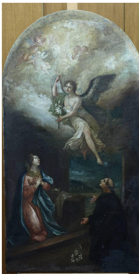
„Blagovijesti“, after the implementation of conservation measures