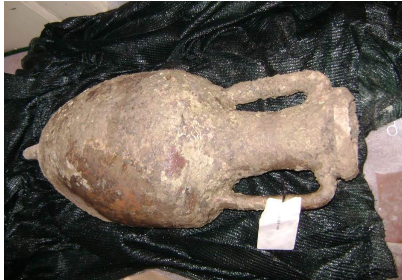
Amphora, condition after it was surfaced

Creating a conservation project and implementation of conservation measures on the amphorae that were surfaced in 2010 during the underwater archaeological research.