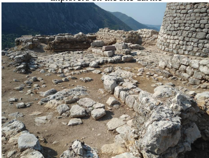
Archeological site - Gradina