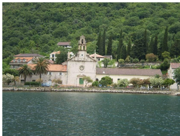
Church and Monastery of St. Nikola, Prčanj

The works included removing of the concrete bench and concrete surface part of the walkways and a new parapet wall - bench was constructed of the stone. In addition, new paving of the surface beside the sea was performed and it was done with the stone pavement. Horticultural arrangement has been retained as was predicted with a conservation guidelines.