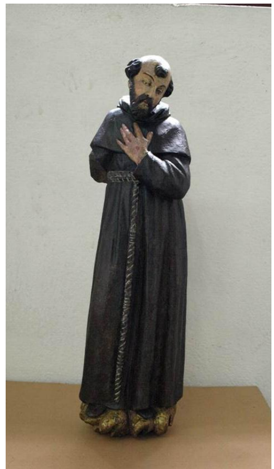
“Franjevac” after the implementation of conservation measures