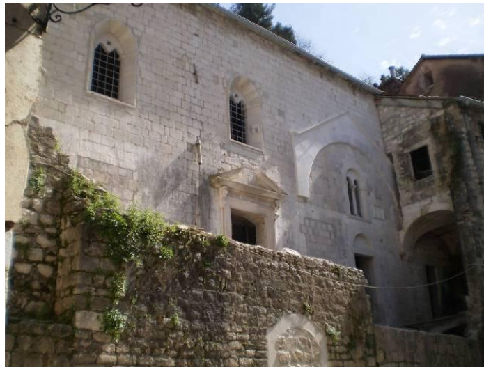
Church of St. Pavle, west facade

During this period an additional project was made which foresees the installation of heating, cooling, electricity, water and sewage systems in the complex adopted to the needs of future application of modern church of St. Pavle (hall for assembly sessions, lectures, concerts, etc...)