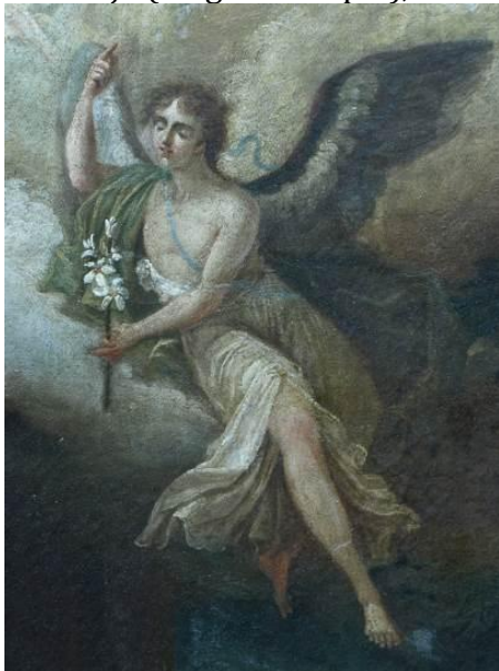
„Blagovijesti“, detail of the play of the angel after conservation measures

Creating a conservation project and implementation of conservation measures in the picture "Blagovjesti" by an unknown author, the nineteenth century, tech. Oil on canvas, dimension 60.8 x 108.3 cm, oval, from the parish Church Rođenja Blažene djevice Marije (Virgin's temple), Prčanj