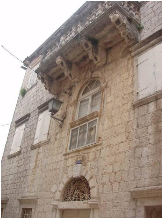
Kolović Palace, facade detail

Implementation of conservation projects are in progress that foresee the recovery and restoration works at the Kolović Palace and the Šestokrilović Palace. These works are carried out in accordance with the approved conservation projects.