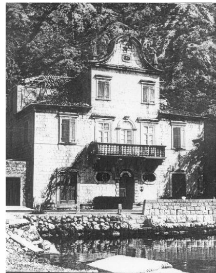
Dabinović –Kokot Palace 1979

Dabinović –Kokot Palace in Dobrota is a representative example of Baroque architecture housing Kotor Bay. It was built in the early XVIII century, during the biggest rise of Dobrota, i.e. prosperity of the maritime trade of the sailing ships whose owners were residents of the developed maritime town. Due to structural damage caused by the earthquake dated April 15th 1979 the palace was left without a roof and has not been renewed. Further degradation of the structure and materials of the palace have been caused by the atmospheric effects and removing elements of stone (doorways, stairs, balcony railings ...).