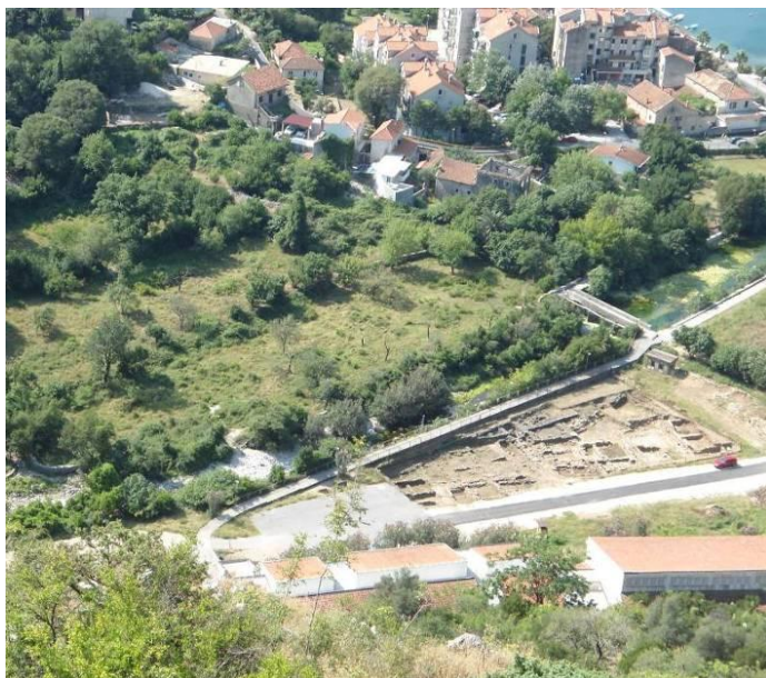
Explorers on the site Carine