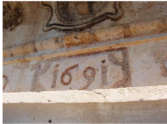
Šestokrilović Palace – Title with year of the construction

Implementation of conservation projects are in progress that foresee the recovery and restoration works at the Kolović Palace and the Šestokrilović Palace. These works are carried out in accordance with the approved conservation projects.