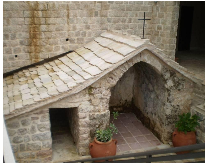
Chapel of St. Trinity in Stoliv, after reconstruction