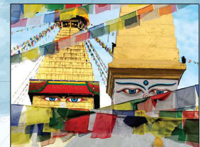
Like a string of jewels, seven groups of religious and historical monuments stretch across Nepal's Kathmandu Valley, attesting to the area's great multicultural and religious diversity. Thamel Hindu temples at Changu Narayan date from the 5th century. At Boudhanath's gilded Buddhist stupas, "all-seeing eyes" watch over 50 Tibetan Buddhist monasteries.