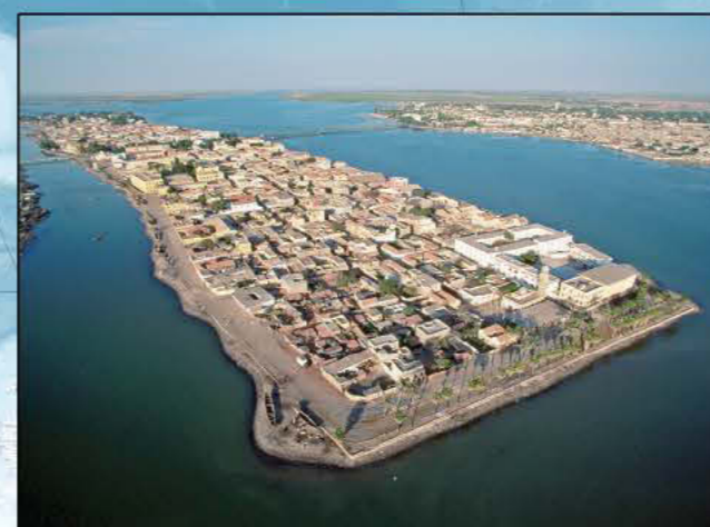
Established as a French colonial outpost in 1659, the island city of Saint-Louis, at the mouth of the Senegal River, today welcomes painted fishing boats instead of European traders seeking gold and slaves. A new canal helps to preserve elegant homes and quays from floods.