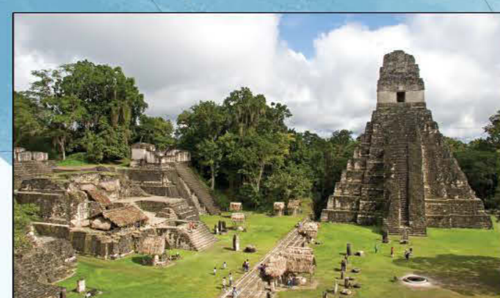
The nine-stepped Maya Temple of the Jaguar rises 47 meters above the Great Plaza of Tikal in Guatemala's lush rain forest. Inhabited from the 6th century A.C. to the 12th century A.D., Tikal was among the most powerful cities in Mesoamerica. At its height, up to 90,000 men, women and children lived and worked there.