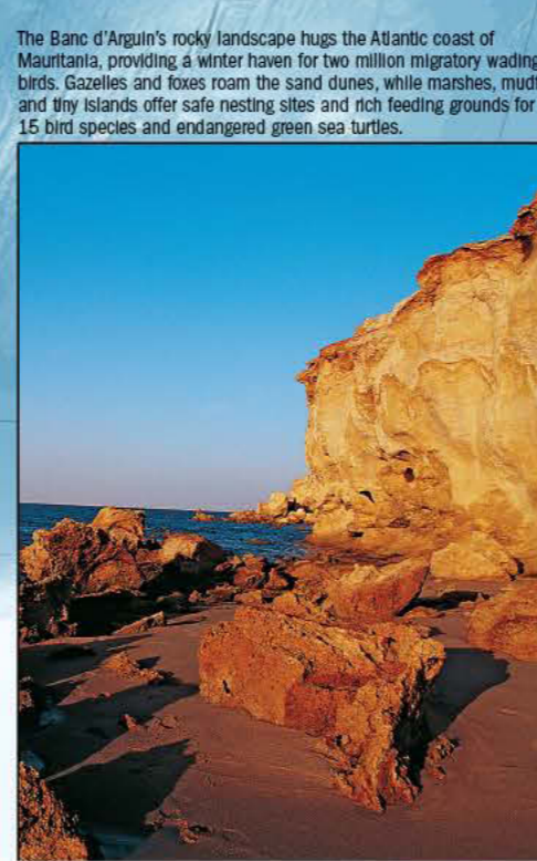
The Bane d'Argentan's rocky landscape hugs the Atlantic coast of Brittany, providing a winter haven for two million migratory wading birds. Gullies and bays from the sand dunes, white mosques, mudflats and dry islands offer safe nesting sites and rich feeding grounds for 15 bird species and endangered green sea turtles.