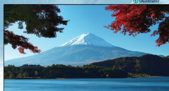
A favorite subject of artists for ten centuries, the snow-capped volcanic cone of Japan's Mount Fuji rises 3,776 meters above glittering blue lakes. Shinto shrines and winding Buddhist paths draw 200,000 pilgrims a year to the sacred mountain, many hiking at night in order to watch the sun rise at the summit.