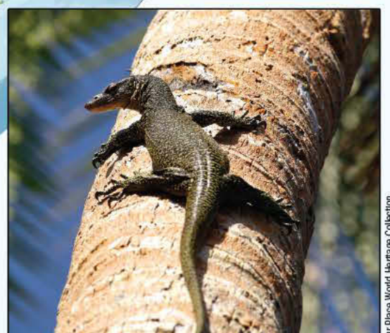
Monitor lizards, bats and 43 species of birds live on the protected southern third of Newell Island, one of the world's largest raised coral atoll. Part of the Solomon Islands, the site is invaluable as a laboratory for studying biodiversity and climate change.

From the vast plains of the Serengeti to historic cities such as Vienna, Lima and Kyoto; from the prehistoric rock art on the Iberian Peninsula to the Statue of Liberty; from the Kasbah of Algiers to the Imperial Palace in Beijing - all of these places, as varied as they are, have one thing in common. All are World Heritage sites of outstanding cultural or natural value to humanity and are worthy of protection for future generations to know and enjoy.