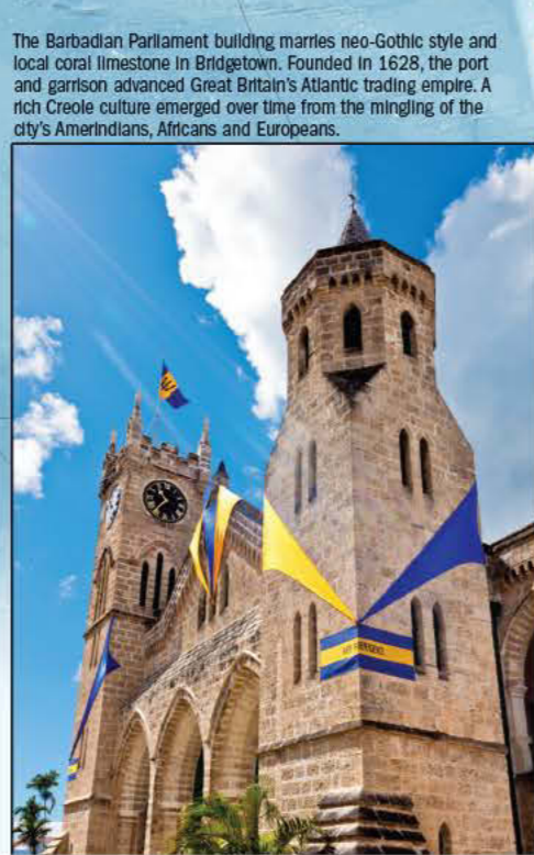
The Bathonian Parliament building marries neo-Gothic style and local coral limestone in Bridgetown. Founded in 1628, the port and garrison attracted Great Britain's Atlantic trading empire. A rich Creole culture emerged over time from the mingling of the city's Amerindians, Africans and Europeans.