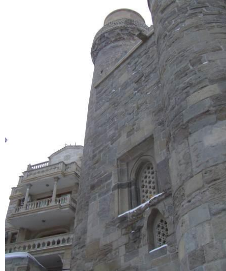
Cleaning and conservation of the two-storey Caravanserai and the accomplished conservation of the Muhammed Mosque and the minaret