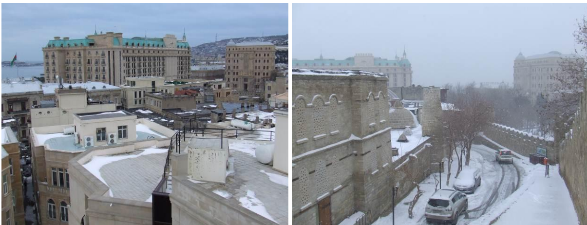
The Four Seasons hotel (green roofing) seen from the Muhammed Mosque's minaret and the city wall

The mission was informed that no further demolitions or large scale developments have been approved by SHAHAR subsequent to the previous Monitoring Reports.