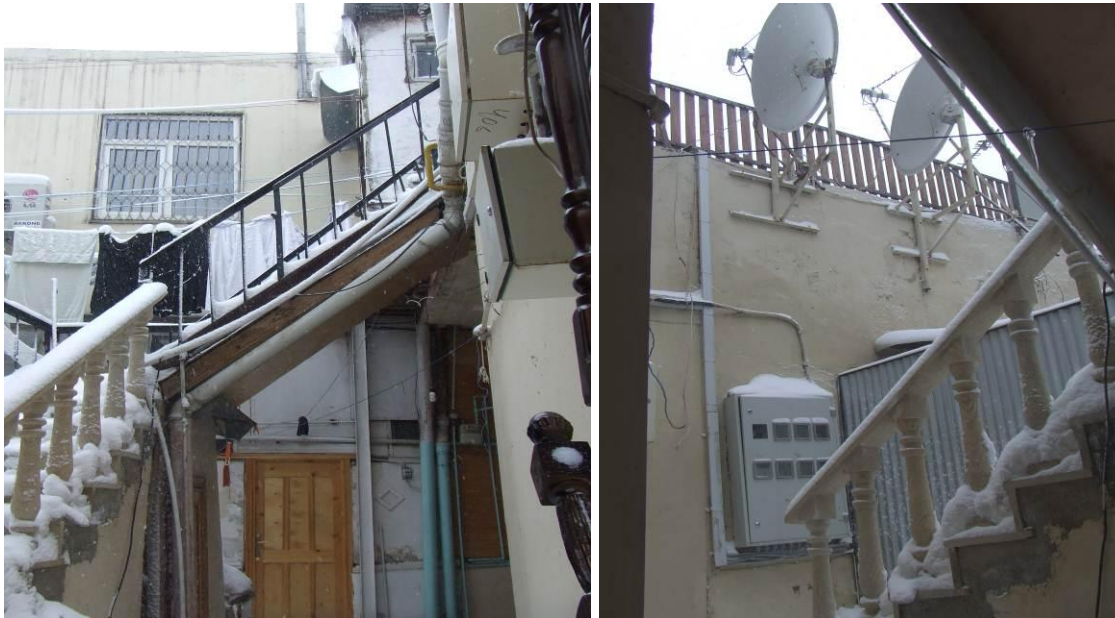
The inner yard of a living house next to the Shirvanshah's Palace