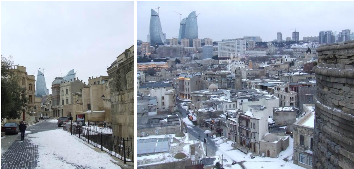
General views from the Walled City: new development surrounding the WH site further behind its buffer zone

The state of conservation was reviewed by the mission at three levels: the setting and context, the Walled City and its urbanity and the built architectural fabric.