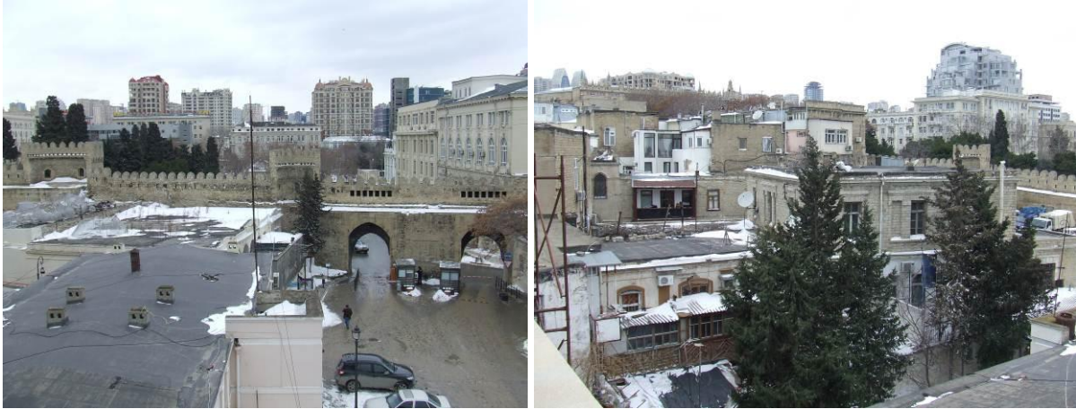
View of the Double Gate and Medieval City Wall out to the XIX - early XX c. historic city centre with the controversial recent development

Concerning the World Heritage property and its buffer zone, the main threats are derived from increased tourist activities, including its subsidiary-effects, and the impacts on the sustainability of the local community living and working within the walls and the activities in the buffer zone, especially the park views towards the Caspian Sea.