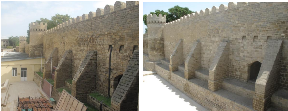
Conservation works (before and after) including removal of temporary additions

The mission considers that the State Party has made great strides in implementing the decisions of the World Heritage Committee, but there are still many actions to be done especially at the macro level. The GIS for the Walled City is very comprehensive and the activities of the stone restoration team comes with capacity building which can be seen in the works now being executed by the local craftsmen. (see maps)