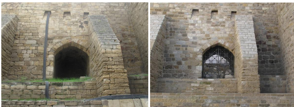
The recently restored part (before and after) of the medieval city defence wall

The newly created SHAHAR computerised GIS archive is expected to be employed as an effective tool for monitoring and supervision of the Walled City management and enforcement of regulations. The mission experts advised the SHAHAR leaders to continue comprehensive data collection in cooperation with private experts, antiquarians, local residents and other potential partners. The collected data then could be used for concluding comparative analytical historic studies, HIAs, planning and development of research, conservation and restoration projects as well as backgrounds for monitoring and regulatory activities.