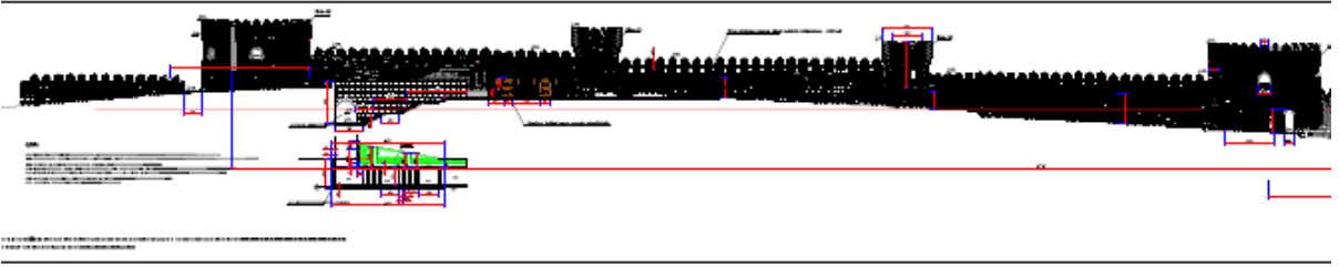
From the documentary survey for the conservation works