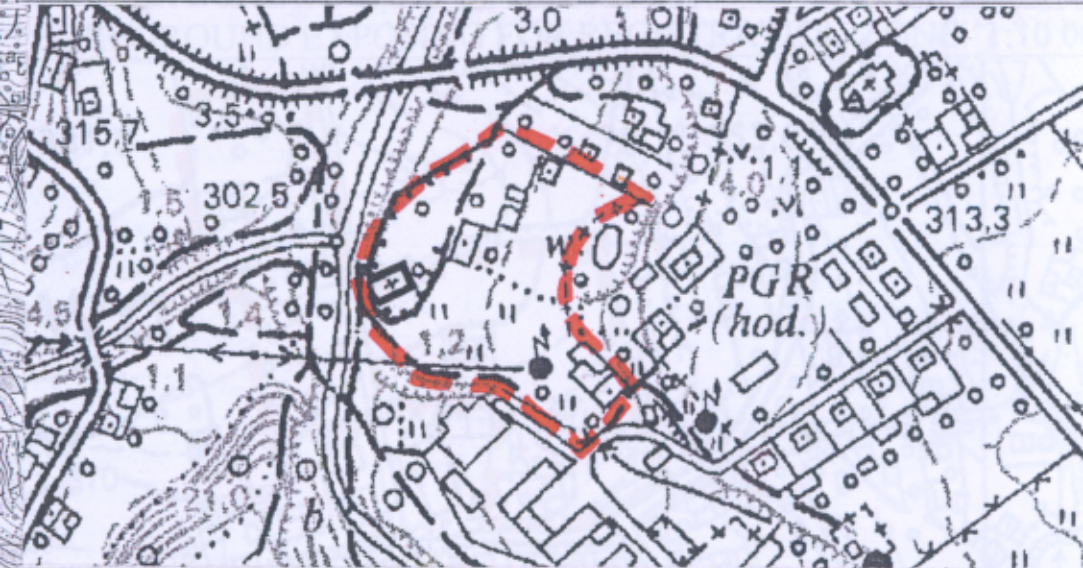
CHURCH GROUP – REGISTRATION ZONE 1:5000