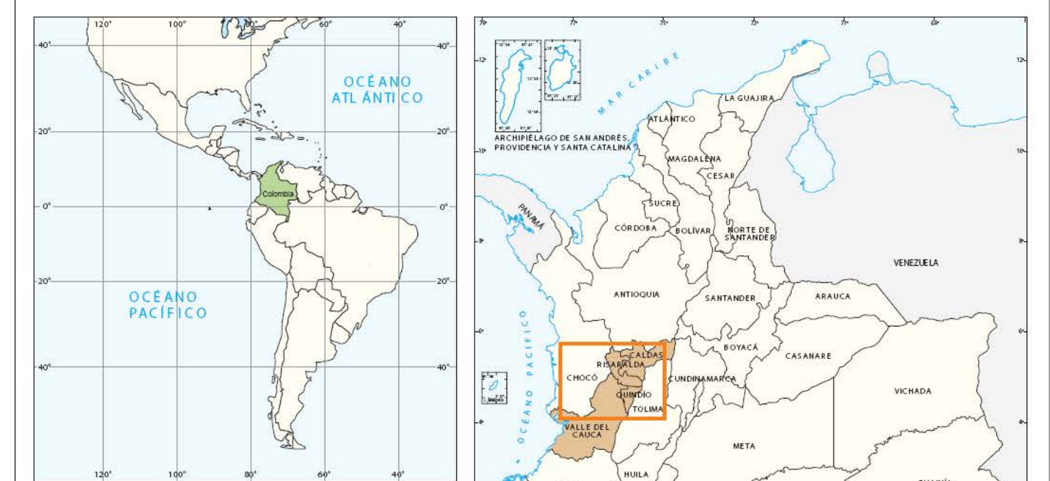
Location within Latin America