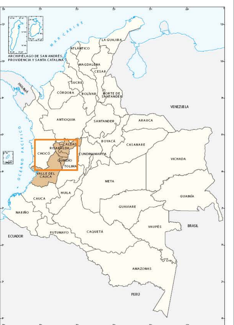
Location within Colombia