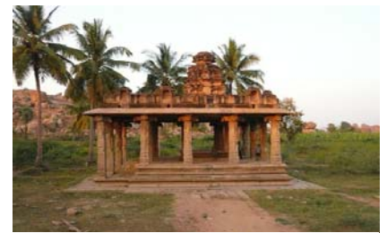
Cultural site inscribed in 1986

Site: The austere, grandiose site of Hampi was the last capital of the last great Hindu Kingdom of Vijayanagar. Its fabulously rich princes built Dravidian temples and palaces which won the admiration of travellers between the 14th and 16th centuries. Conquered by the Deccan Muslim confederacy in 1565, the city was pillaged over a period of six months before being abandoned.