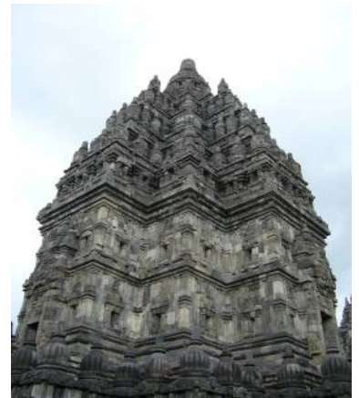
Cultural site inscribed in 1991

Site: Built in the 10 th century, this is the largest temple compound dedicated to Shiva in Indonesia. Rising above the centre of the last of the concentric squares are three temples decorated with reliefs illustrating the epic of the Ramayana, dedicated to the three great Hindu divinities (Shiva, Vishnu and Brahma) and three temples dedicated to the animals who serve them.