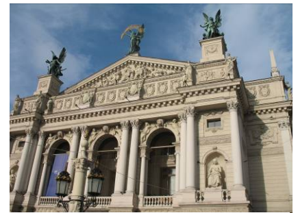
Cultural site inscribed in 1998

Site: The city of L'viv, founded in the late Middle Ages, was a flourishing administrative, religious and commercial centre for several centuries. The medieval urban topography has been preserved virtually intact (in particular, there is evidence of the different ethnic communities who lived there), along with many fine Baroque and later buildings. In its urban fabric and its architecture, L'viv is an outstanding example of the fusion of the architectural and artistic traditions of Eastern Europe with those of Italy and Germany.