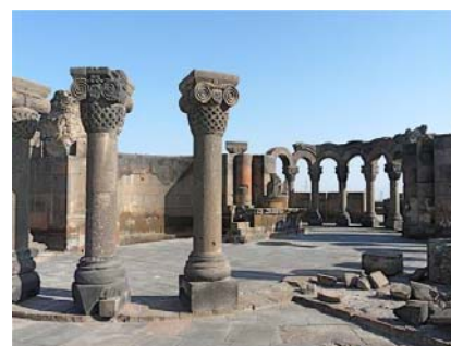
Cultural site inscribed in 2000

Site: The cathedral and churches of Echmiatsin and the archaeological remains at Zvartnots graphically illustrate the evolution and development of the Armenian central-domed cross-hall type of church, which exerted a profound influence on architectural and artistic development in the region. Damaged by an earthquake in the 10th century and unearthed nearly a thousand years later in the early 20th century, the construction of the cathedral has been deduced from written history and from the ruins of the structure itself by the combined efforts of archaeologists, historians, and architectural specialists.