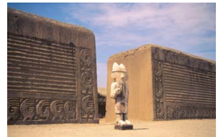
Cultural site inscribed in 1986 (List in Danger)

Site: The Chimu Kingdom, with Chan Chan as its capital, reached its apogee in the 15th century, not long before falling to the Incas. The planning of this huge city, the largest in pre-Columbian America, reflects a strict political and social strategy, marked by the city's division into nine 'citadels' or 'palaces' forming autonomous units.