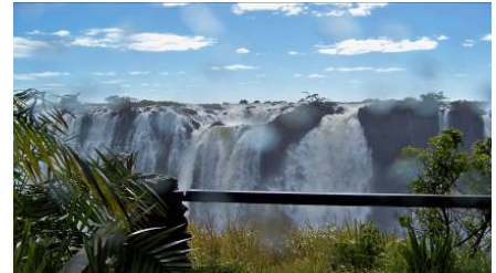
Natural site inscribed in 1989

Site: The Victoria Falls are among the most spectacular waterfalls in the world. The Zambezi River, which is more than 2 km wide at this point, plunges down a series of basalt gorges and raises an iridescent mist that can be seen more than 20 km away. The fragile ecosystem of the riverine rainforest within the waterfalls' splash zone is also of particular interest.