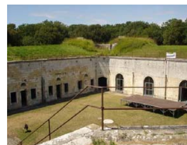
Cultural site submitted in 2002

Site: The Arsenal of Rochefort with the fortifications of the Charente estuary is an ensemble of fortified constructions built in the 17th century. It was created ex nihilo by King Louis XIV and was intended to prevent any enemy from landing. The fort Liédot located on the island of Aix is one of the fortifications. Its strategic position at the mouth of the Charente estuary was fully taken into consideration later by Emperor Napoleon who decided to build an “indestructible and unviolable fort” in 1810 with stones from the Crazannes quarry in the region. The fort was mainly used as a jail.