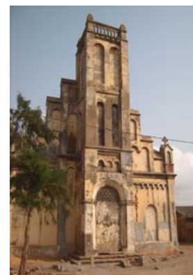
Cultural site submitted in 2000

Site: Birthplace of the Guin community, Aného is a town in southeastern Togo situated 45 km east of the capital Lomé, between the Atlantic Ocean and Lake Togo in Maritime Region. Historically it was known under the name Little Popo and it had a Portuguese slave market. It later became the first German capital of Togo in the 1880s. It gradually declined in importance after the capital was transferred to Lomé in 1897, a decline exacerbated by coastal erosion. The town's main industries are farming and fishing, while it is still a centre for voodoo. Notable buildings include Aneho Protestant Church built in 1895 and Aneho Peter and Paul Church, cathedral of the Roman Catholic Diocese of Aného, dating from 1898.