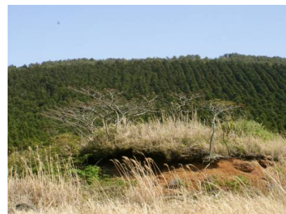
Natural site inscribed in 2007

Site: Jeju Volcanic Island and Lava Tubes together comprise three sites that make up 18,846 ha. It includes Geomunoreum, regarded as the finest lava tube system of caves anywhere, with its multicoloured carbonate roofs and floors, and dark-coloured lava walls; the fortress-like Seongsan Ilchulbong tuff cone, rising out of the ocean, a dramatic landscape; and Mount Halla, the highest in Korea, with its waterfalls, multi-shaped rock formations, and lake-filled crater. The site, of outstanding aesthetic beauty, also bears testimony to the history of the planet, its features and processes.