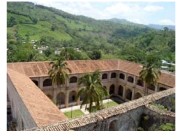
Cultural site submitted in 2001

Site: Eight churches were built in the 16 th century under the guidance of Dominican friars whose goal was to evangelise the Zoque people, a culture which was heir to one of the most ancient cultures in Mesoamerica. The building project was originally of European design, but it soon acquired local features of Mexican Colonial art. The presence of these churches triggered the development of a school of gilded and painted sculpture. The Convent of Santo Domingo Tecpatán is now the focal point of efforts to recover the use of the Zoque language.