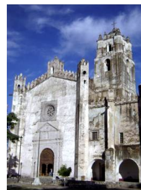
Cultural site inscribed in 1994

Site: These 14 monasteries stand on the slopes of Popocatepetl, to the south-east of Mexico City. One of them is the ex-convent of Yecapixtla built in the 16 th century. They are in an excellent state of conservation and are good examples of the architectural style adopted by the first missionaries – Franciscans, Dominicans and Augustinians – who converted the indigenous populations to Christianity in the early 16th century. They also represent an example of a new architectural concept in which open spaces are of renewed importance. The influence of this style is felt throughout the Mexican territory and even beyond its borders.