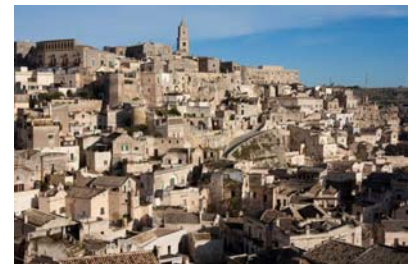
Cultural site inscribed in 1993

Site: The Sassi and the Park of the Rupestrian Churches of Matera are the most outstanding, intact example of a troglodyte settlement in the Mediterranean region, perfectly adapted to its terrain and ecosystem. The first inhabited zone dates from the Palaeolithic, while later settlements illustrate a number of significant stages in human history. The spectacular rocky landscapes of Matera gather more than 150 rocky churches.