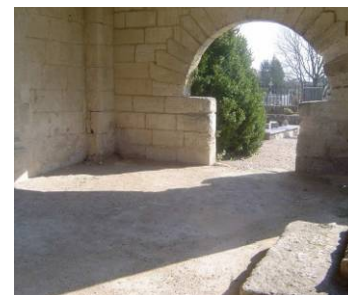
Cultural site inscribed in 1999

Site: Viticulture was introduced to this fertile region of Aquitaine by the Romans, and intensified in the Middle Ages. The Saint-Emilion area benefited from its location on the pilgrimage route to Santiago de Compostela and many churches, monasteries and hospices were built there from the 11 th century onwards. It was granted the special status of a 'jurisdiction' during the period of English rule in the 12 th century. It is an exceptional landscape devoted entirely to wine-growing, with many fine historic monuments in its towns and villages.