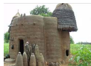
Cultural site inscribed in 2004

Site: The Koutammakou landscape in north-eastern Togo, which extends into neighbouring Benin, is home to the Batammariba whose remarkable mud tower-houses (Takienta) have come to be seen as a symbol of Togo. In this landscape, nature is strongly associated with the rituals and beliefs of society. The 50,000-ha cultural landscape is remarkable due to the architecture of its tower-houses which are a reflection of social structure; its farmland and forest; and the associations between people and landscape.