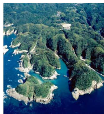
Cultural site inscribed in 2007

Site: The Iwami Ginzan Silver Mine in the south-west of Honshu Island is a cluster of mountains, rising to 600 m and interspersed by deep river valleys featuring the archaeological remains of large-scale mines, smelting and refining sites and mining settlements worked between the 16th and 20th centuries. The site also features routes used to transport silver ore to the coast, and port towns from where it was shipped to Korea and China. The mines contributed substantially to the overall economic development of Japan and south-east Asia in the 16th and 17th centuries, prompting the mass production of silver and gold in Japan. The mining area is now heavily wooded. Included in the site are fortresses, shrines, parts of Kaidô transport routes to the coast, and three port towns, Tomogaura, Okidomari Yunotsu, from where the ore was shipped.