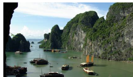
Natural site inscribed in 1994

Site: Ha Long Bay, in the Gulf of Tonkin, includes some 1,600 islands and islets forming a spectacular seascape of limestone pillars. Because of their precipitous nature, most of the islands are uninhabited and unaffected by a human presence. The site's outstanding scenic beauty is complemented by its great biological interest.