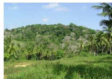
Cultural site inscribed in 2008

Site: The Mijikenda Kaya Forests consist of 11 separate forest sites spread over some 200 km along the coast containing the remains of numerous fortified villages, known as kayas, of the Mijikenda people. The kayas, created as of the 16 th century but abandoned by the 1940s, are now regarded as the abodes of ancestors and are revered as sacred sites and, as such, are maintained as by councils of elders. The site is inscribed as bearing unique testimony to a cultural tradition and for its direct link to a living tradition.