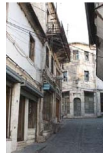
Cultural site inscribed in

Project activities: The project will take place in the centre of Gjirokastra and run restoration activities in close collaboration with professional artists, public heritage authorities and other NGOs. The volunteers and locals will also take part in workshops in order to increase their awareness about the importance of cultural and architectural heritage.