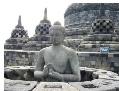
Cultural site inscribed in 1991

Site: The Borobudur temple, a famous Buddhist temple dating from the 8th and 9th centuries, is located in central Java. It was built in three tiers: a pyramidal base with five concentric square terraces, the trunk of a cone with three circular platforms and, at the top, a monumental stupa. The walls and balustrades are decorated with fine low reliefs, covering a total surface area of 2,500 m 2 . Around the circular platforms are 72 openwork stupas, each containing a statue of the Buddha.