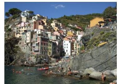
Cultural site inscribed in 1997

Site: The Ligurian coast between Cinque Terre and Portovenere is a cultural landscape of great scenic and cultural value. One of the five villages is Riomaggiore. The layout and disposition of the small towns and the shaping of the surrounding landscape, overcoming the disadvantages of a steep, uneven terrain, encapsulate the continuous history of human settlement in this region over the past millennium.