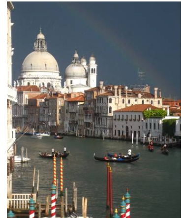
Cultural site inscribed in 1987

The area hosted a convent between 1200 and 1500 and was later used for military purposes until 1950. The military use caused the destruction of the biggest part of the convent. After the demilitarisation process, the island was abandoned for decades. During this time, the vegetation slowly started to cover and ruin the ancient historical site and numerous archaeological rests were stolen.