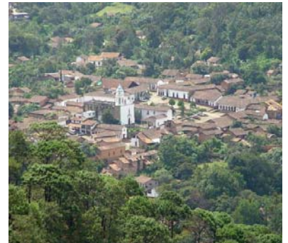
Cultural site submitted in 2001

Site: San Sebastian del Oeste was one the main mining centres in the New Spain during the Colonial period. The town itself spreads over 37 partially settled hectares. Building materials and structural solutions inherited from traditional Spanish architecture resulted in the use of large retaining walls and baseboards to protect buildings from moisture. Features such as public squares, original stone pavements, plastered mud-brick walls, archways are part of an integrated typology and constitute the town's distinctive traits. The biodiversity is likewise an extremely important feature of this site. San Sebastian del Oeste is a clear example of the important role played by the environment in shaping the urban image of rural settlements.