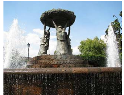
Cultural site inscribed in 1991

Site: Built in the 16 th century, Morelia is an outstanding example of urban planning which combines the ideas of the Spanish Renaissance with the Mesoamerican experience. Well-adapted to the slopes of the hill site, its streets still follow the original layout. More than 200 historic buildings, all in the region's characteristic pink stone, reflect the town's architectural history, revealing a masterly and eclectic blend of the medieval spirit with Renaissance, Baroque and neoclassical elements. Morelia was the birthplace of several important personalities of independent Mexico and has played a major role in the country's history.