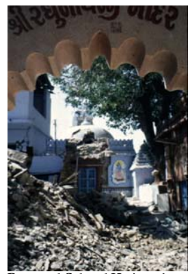
Damaged Cultural Heritage by Earthquake (Gujurat, 2001)

Recently natural and man-made hazards such as earthquakes, fires and terrorism have caused serious and irreversible damage to cultural heritage. Therefore, comprehensive risk management is essential for the protection of cultural heritage from disasters. In this light, the Cultural Heritage and Risk Management project of Ritsumeikan University Research Center for Disaster Mitigation of Urban Cultural Heritage (Rits DMUCH) aims to organize the UNESCO Chair International Training Programme and develop a scientific support network, in order to build the institutional capacity needed to formulate comprehensive risk management plans that are based on the characteristics of cultural heritage and nature of hazards in the regional context.