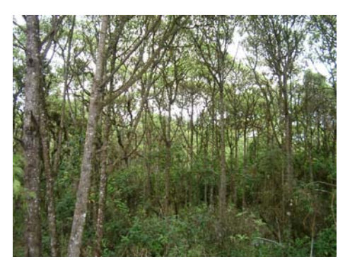
Native vegetation in Santa Cruz