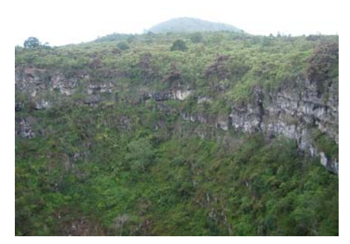
A Caldera on Santa Cruz Island