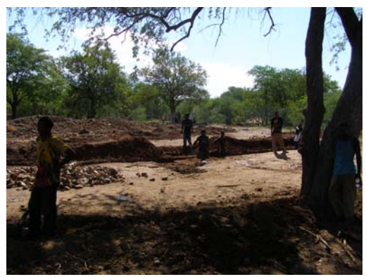
Fig. 6: Balloon project site