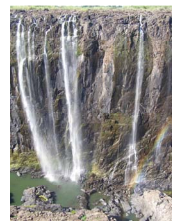
Fig. 2: Falls in Zambia (Eastern Cataract)