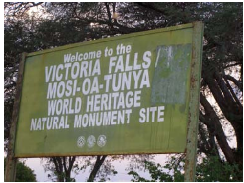
Fig. 9: Only sign in the site where WH status is acknowledged