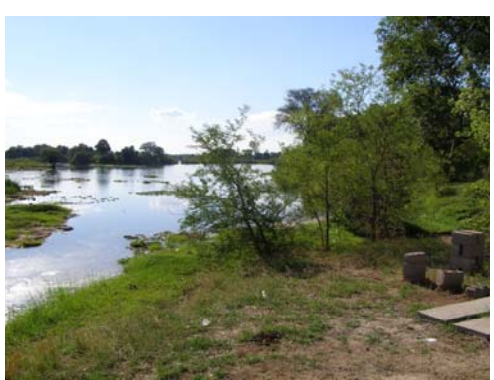
Fig. 7: Site of new hotel complex