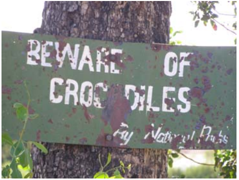
Fig. 10: Poor signage