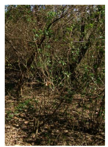
Fig. 3: Lantana weeds