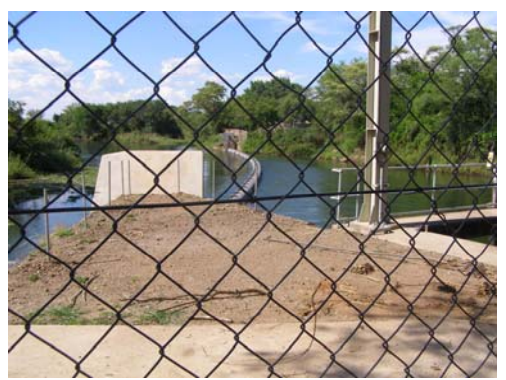
Fig. 5: Water abstraction for power generation