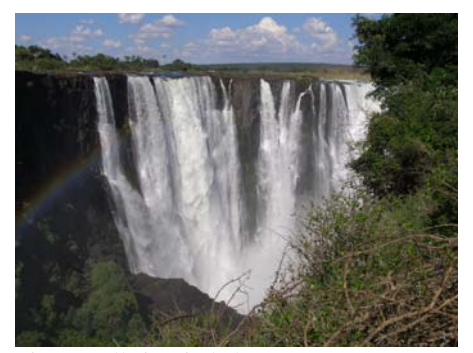
Fig. 1: Falls in Zimbabwe