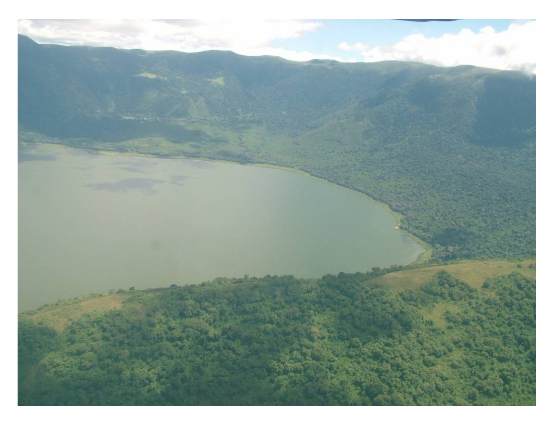
Annex E – Photographs