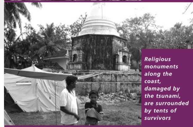
Religious monuments along the coast, damaged by the tsunami, are surrounded by tents of survivors