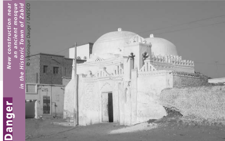
New construction near an ancient mosque in the Historic Town of Zabid

A final Conference Statement called on governments to take all necessary action to reach the goal of reversing the current rate of biodiversity loss by the year 2010.