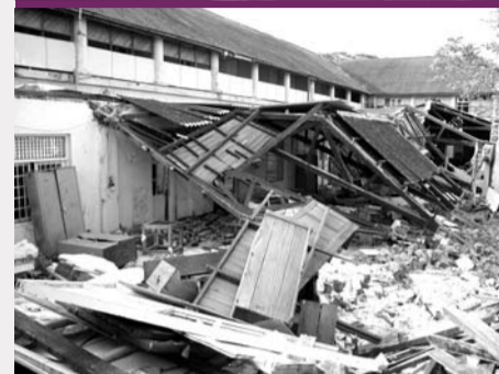
The annex to the old Dutch Hospital at the Old Town of Galle World Heritage site was destroyed by the tsunami