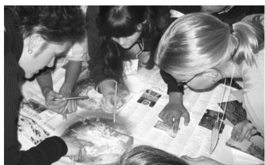
Students participating in the Philadelphia Workshop

As a follow up to this workshop, the WHYH project will be focusing on providing training to educators from across the US on the local and global significance of World Heritage and the rationale for its inclusion in school curricula. The project will enable teachers to develop and implement strategies which will encourage students to protect cultural and natural sites in their communities as well as in the world at large.