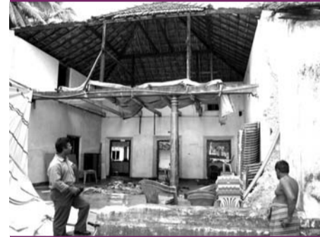
Aside from houses, the tsunami also damaged cultural and spiritual centres