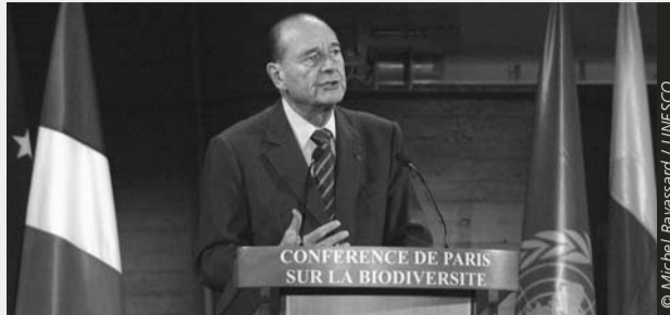
The President of the French Republic, Jacques Chirac

The World Heritage Convention is one of five biodiversity conventions, which include the Convention on Biological Diversity (CBD), the Ramsar Convention on Wetlands, the Convention on the International Trade of Endangered Species (CITES) and the Convention on the Conservation of Migratory Species (CMS). UNESCO thus has an interesting opportunity to contribute significantly to in-situ conservation of biodiver-