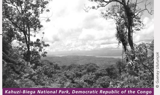
Kahuzi-Biega National Park, Democratic Republic of the Congo