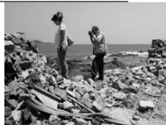
Experts assessing damage to the ramparts of the Old Town of Galle World Heritage site in Sri Lanka