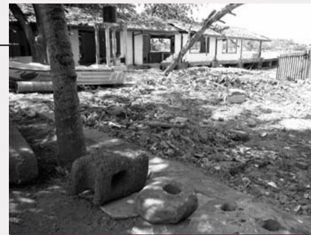
The Maritime Archaeological Unit of Galle was washed away with its collections and equipment

UNESCO, ICCROM and ICOMOS developed action recommendations on cultural heritage risk management which were adopted by the participating Member States during the World Conference on Disaster Reduction in January in Kobe, Japan.