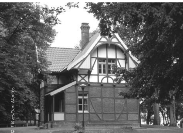
Curonian Spit National Park Information Centre

The Revised Operational Guidelines are available at: http://whc.unesco.org/en/guidelines