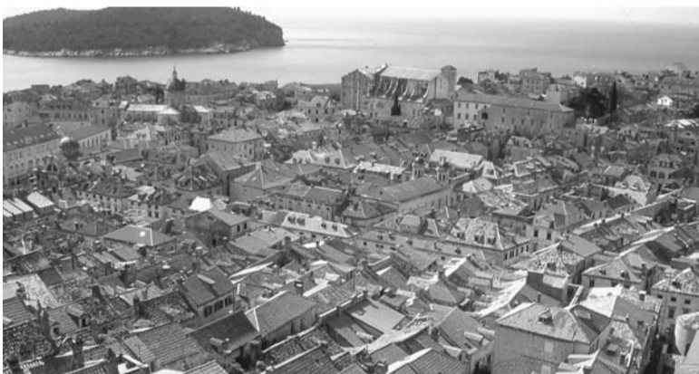
View of the Old Town of Dubrovnik in Croatia

In January, the International Criminal Tribunal for the former Yugoslavia sentenced retired General Pavle Strugar of the Yugoslav Peoples' Army to eight years in prison for war crimes against the civilian population and the destruction and willful damage to a number of historical and cultural sites in the Old Town of Dubrovnik, Croatia, during the 1991 siege of the medieval Croatian town, a site inscribed on the World Heritage List in 1979.