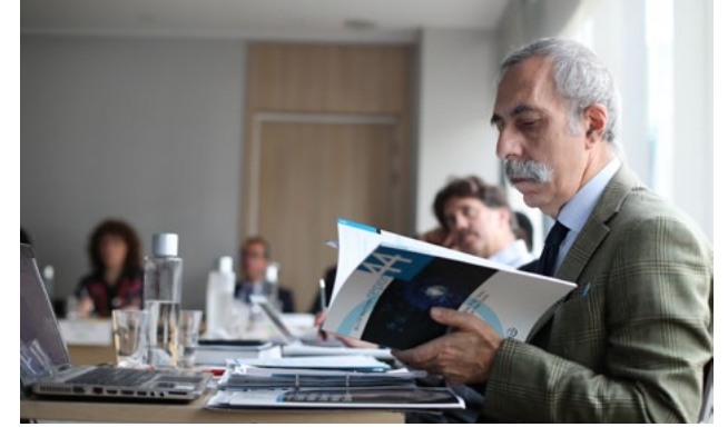
Participants of the 2018 expert workshop, Monte Carlo

As publication of a Tentative List does not imply expression of any opinion of the World Heritage Committee, World Heritage Centre or UNESCO concerning the legal status of any area included therein, the workshop participants considered that nothing prevents a State Party from including sites beyond their territory or jurisdiction. However, as the Operational Guidelines envisage that properties will be located within the territory of States Parties, further guidance would provide clarity and assist States Parties wishing to add a site in marine areas beyond national jurisdiction to their Tentative List.