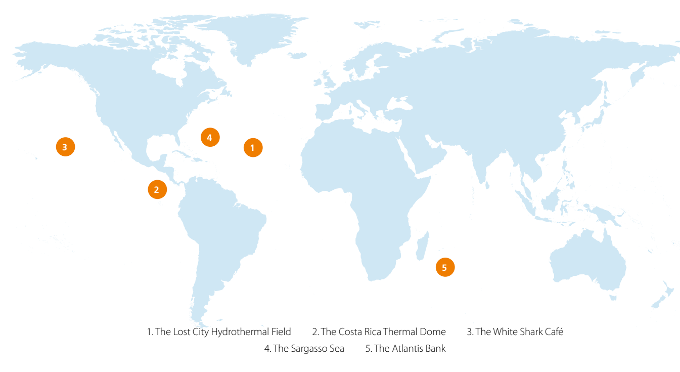
Figure 3: Illustrations of potential Outstanding Universal Value in areas beyond national jurisdiction