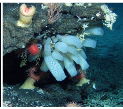
1/ Great white shark at Isla Guadalupe, Mexico, August 2006. Animal estimated at 11-12 feet (3.3 to 3.6 m) in length, age unknown. 2/ A dumbo octopus displays a body posture never before observed in cirrate octopods. 3/ Diverse coral gardens and complex sea-cliff deep-sea communities characterized by large anemones, large sponges and octocorals at the Atlantis Bank, South West Indian Ocean.

Main features that could make up the sites' potential Outstanding Universal Value