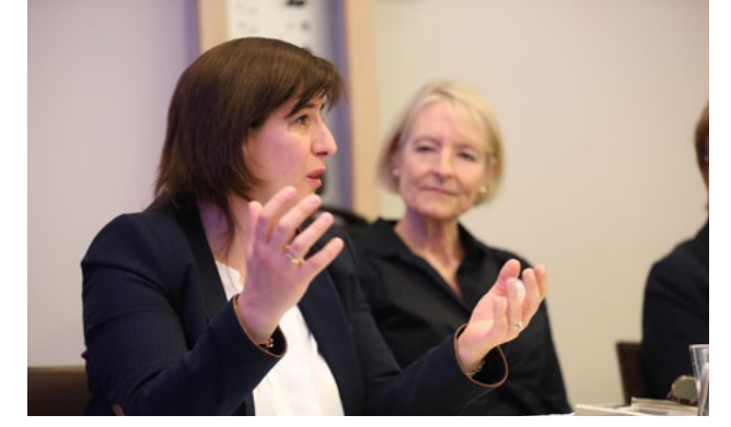
Participants of the 2018 expert workshop, Monte Carlo

However, there is currently no overarching framework for the conservation and sustainable use of marine biodiversity in marine areas beyond national jurisdiction that provides for the coordinated and coherent establishment of cross-sectoral area-