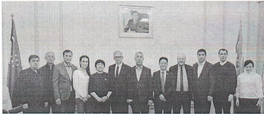
Photo taken at the Ministry of Culture, Tashkent January 12, 2020