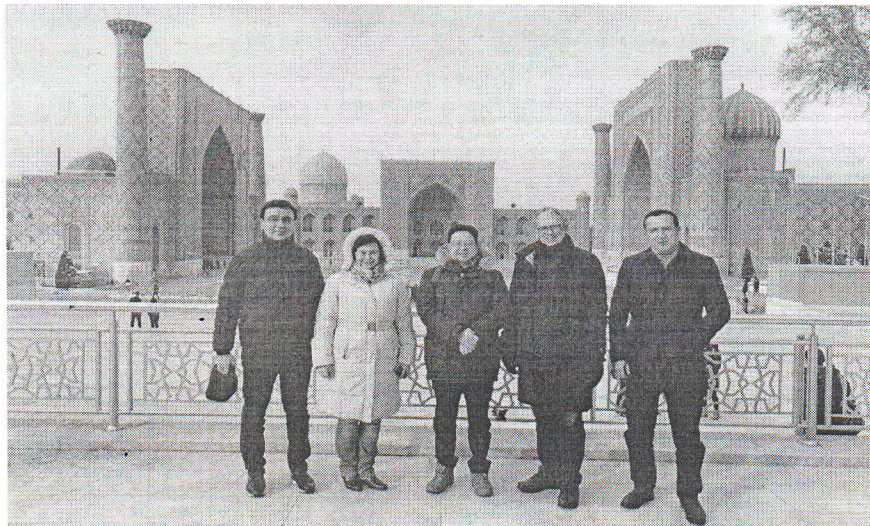
At Registan Ensemble, Samarkand January 15, 2020

The limited resources, both human and financial, of the Samarkand Department for Cultural Heritage remain a concern, especially the limited number and capacity of staff. Also, capacity-building in heritage conservation for decision-makers, architects, planners, engineers and craftsmen is still a critical issue, to be addressed in priority.