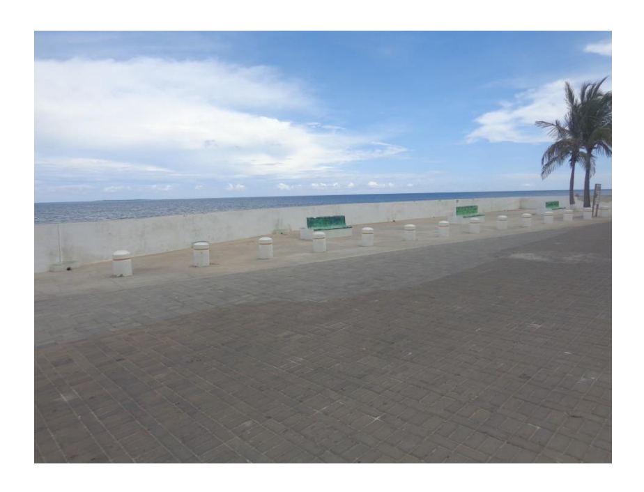
Public square requalified with the reconstruction of the protection wall.