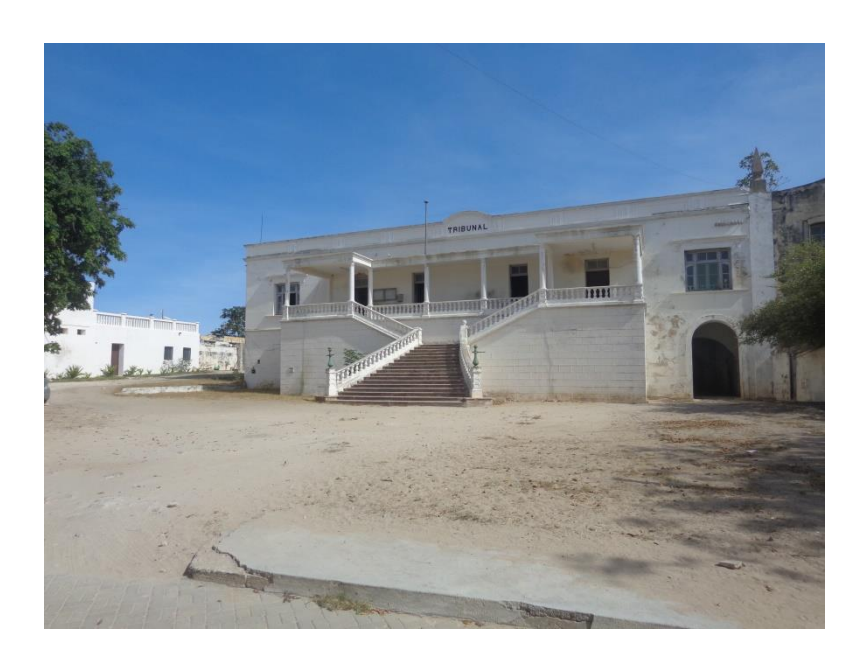
Edifício do Tribunal da Ilha

Answer: Two public institutions that used to occupy buildings in a high state of degradation (District Education Directorate and District Directorate for Planning and Infrastructures) already have new facilities in the continental zone which reduces the carrying capacity and risks associated with their constant use. However, there are still some buildings that claim maintenance and restoration, such as the Court of the Island for example (a monument that is on the list of buildings mentioned in the island's application dossier in 1991). Most public buildings on the Island have been taken precautionary conservation actions to ensure the continuity of the exceptional Universal Value attributed.