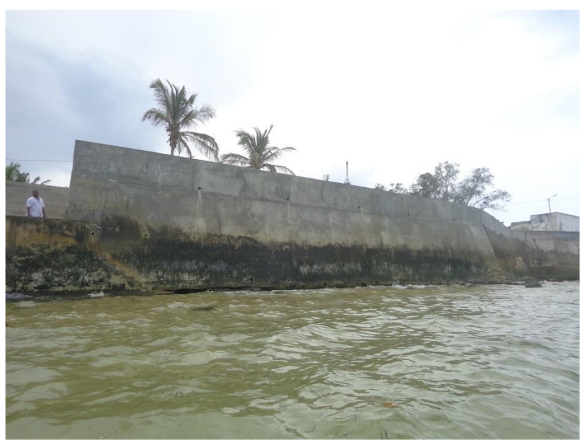
Rebuilt Punch (Seascape), Photo by Claudio Zunguene, GACIM (2019)