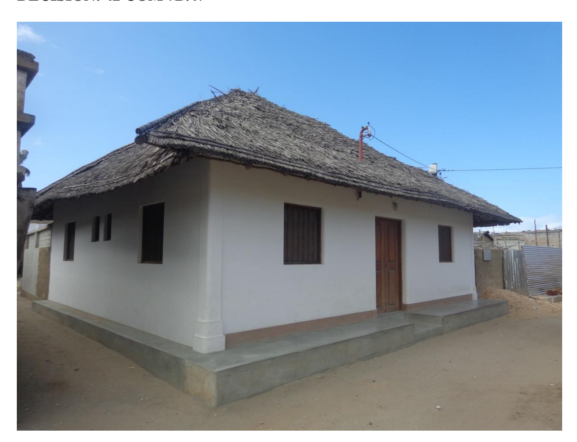
By: MOZAMBIQUE ISLAND CONSERVATION OFFICE (GACIM) IN COLLABORATION WITH THE NATIONAL DIRECTORATE OF CULTURAL HERITAGE

^{\rm 1} Translation and edition by Celio Tiane, National Director of Cultural Heritage