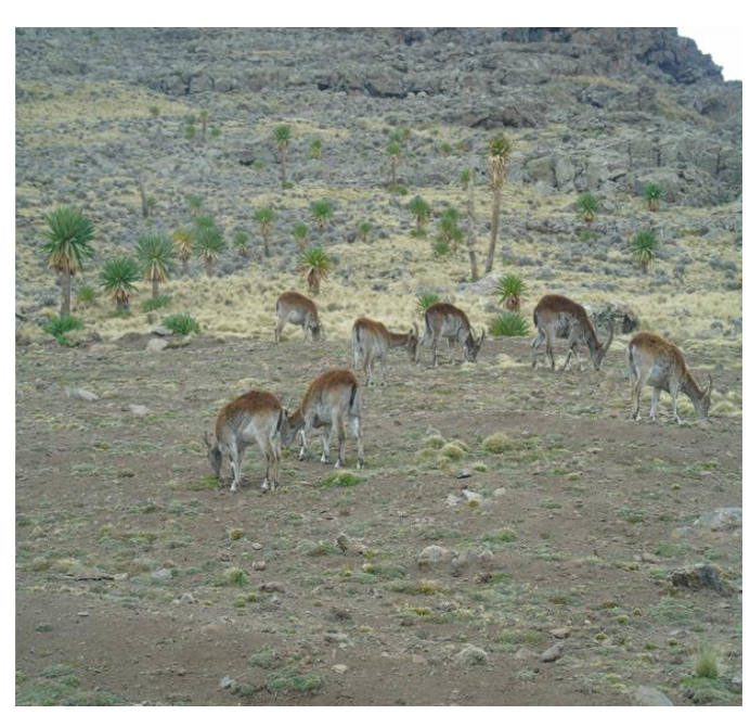
Figure 4: Walia ibex at recovering sites of Buwahit

Recent assessments and field visits conducted to evaluate and monitor the implementation of the grazing pressure reduction strategy showed progressive measures have been achieved so far but more remains to be done in the near future. As part of this effort, communication with rangers and Park officers on site showed resource protection and law enforcement is improving. Major portions of land inside the Park have been set aside as no grazing zones in major parts of Limalimo, Buyit Ras, Michibign, Sankabar, Set Derek, Chennek, Siliki, Mesarerya, Kidus Yared, Gich plateau and Ras-Dashen. The vegetation recovery in the aforementioned areas is promising and wildlife species like Walia ibex, Ethiopian wolf and other antelopes have started expanding their habitat.