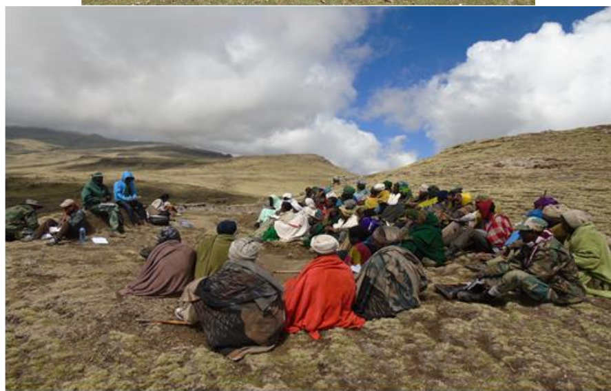
Fig. 5: GPRS implementation awareness raising meetings at village level

Generally, the implementation of the grazing plan in the Park and surrounding areas has continued with the full participation of the local communities and stakeholders. Awareness rising on the value of the Park and implementation of the grazing plan is being continued to the local community. This year it was possible to protect 824 hectare of new area free from grazing (2 percent of the Park area). Since the implementation of the GPRS in 2015, 85 percent area of the Park free from livestock grazing. Currently, the vegetation recovery in these areas has become