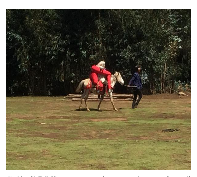
Figure 2: Saddle supplied by SMMMS to transport patients to nearby towns for medical treatment

An NGO, Children in the Cloud, has supported students of the local communities around the Park and provide educational materials which worth approximately € 1,500 (ETB 50,000). The materials include exercise books, pencils, paper, and chalk. This organization has also allocated € 120,000 (ETB 3.8 million) for the construction two-block school in Sona Kebele, Janamora district neighboring the Park. Another NGO, Simien Mountains Mobile Medical Service (SMMMS) provides medical support, materials and training on first aid for to than 2,500 community members living around the Park. University of Michigan's Simien Mountains Gelada Research Project and AWF provided financial support to rehabilitate the springs that provide drinking water a Gich and Sankabar campsites.