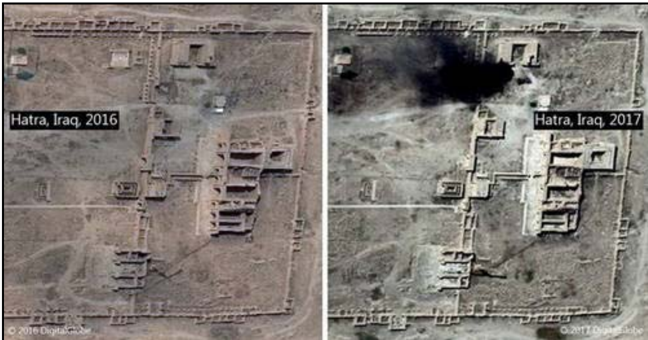
Figure 1 Places of vandalism in the site between 2016-2017