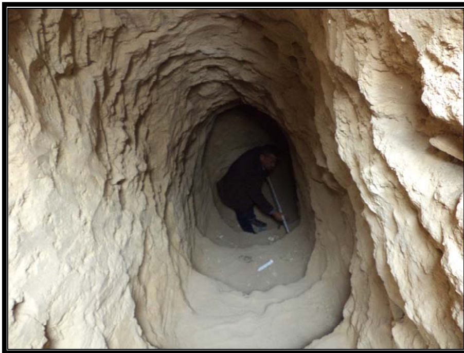
Figure 9 One of the tunnels dug by the forces of terror in Khirbet al-Amsehali

The first is to get the artefacts and antiquities in sites where the shovels of diggers have not been extended after looking for new antiquities in new sites for the purpose of trading them. Second take it as shelters to hide out if they feel danger.