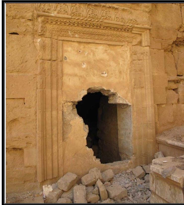
Fig.4 Entrance of one of the rooms opened in the North Iwan

6-For site administration headquarters, furniture and assets at Headquarters, such as machinery and work materials, theft of a fence (BRC) and damage to the on-site antiquities Police building,