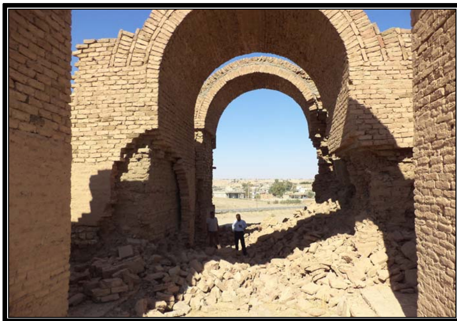
Figure 5 Tabira Gate after destruction

The three gate arches and their shoulders were greatly affected by the explosion caused by the forces of terror (ISIS) at the site.