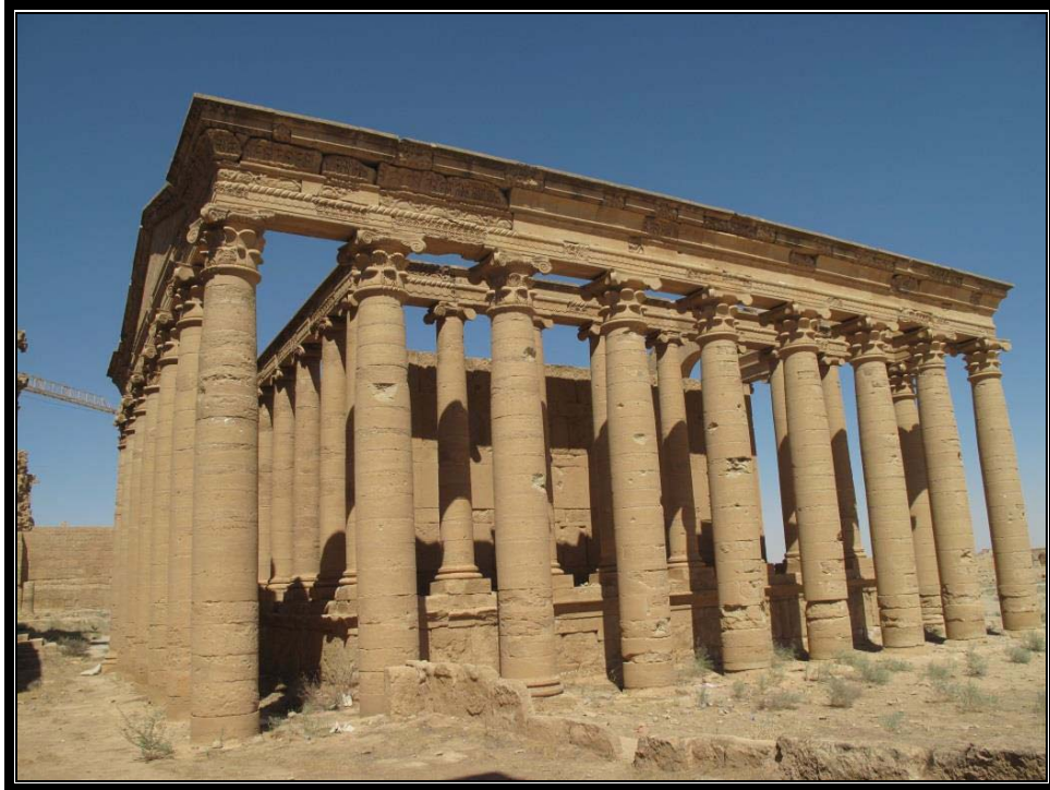
Figure 3 Damage to the columns in Marin temple from the south side

4. Damage in the southern Iwans where the terrorists broke and distorted the statues of the eagles on the walls and some of them is exposed to shooting and dropping some statues on the ground.