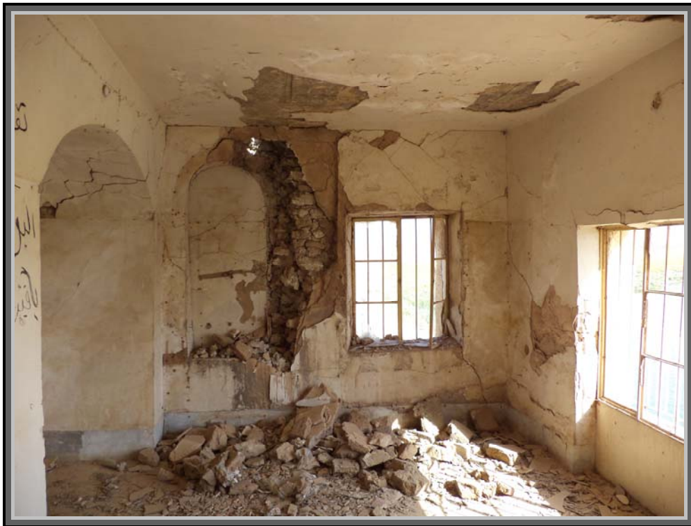
Figure 7 vandalism on the first floor of Headquarters

Construction of the headquarters according to the eastern style where the headquarters consists of an intermediate square surrounded by the building from all sides and since then the headquarters was left until the state board of antiquities and heritage conserved the headquarters and took as a residence for members of the archaeological Revival project of Ashur City.