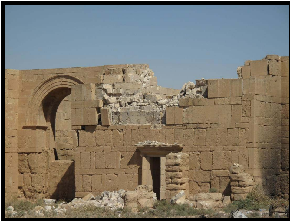
Fig. 2 Damage of the eastern wall of the Great Temple Square as a result of a mortar shell fall

3-The temple of Trinity which is one of the main temples in the city and dedicated to the worship of Marin, Marten and Brmren gods the damage done in this temple where the terrorists broke and distorted all the sculptures carried on the arches that adorn the façade of the outer Iwans.