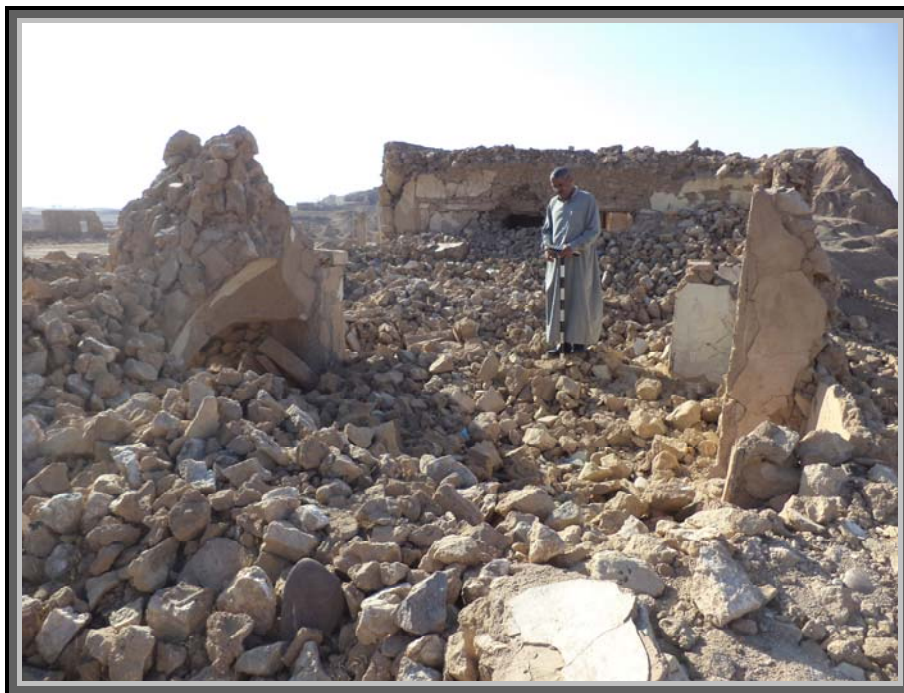
Figure 6 Destruction by the terrorist forces in the palace

In 1978, it was fully conserved by state board of antiquities and heritage to make a local museum of antiquities discovered in the city of Ashur and remained so until the Gulf War, and the palace remained unchanged until the terrorist gangs of ISIS took control of the city and ruined it.