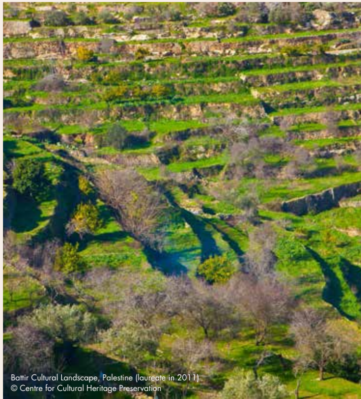
Battir Cultural Landscape, Palestine (laureate in 2011)