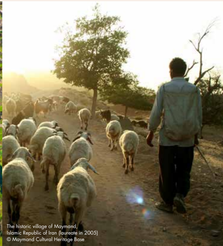
The historic village of Maymand, Islamic Republic of Iran (laureate in 2005)