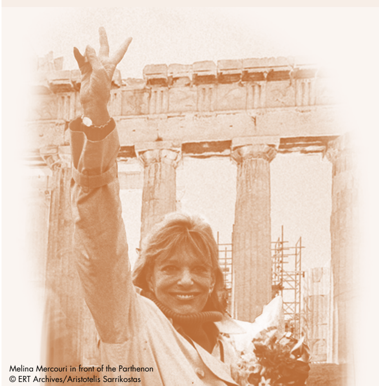
Melina Mercouri in front of the Parthenon