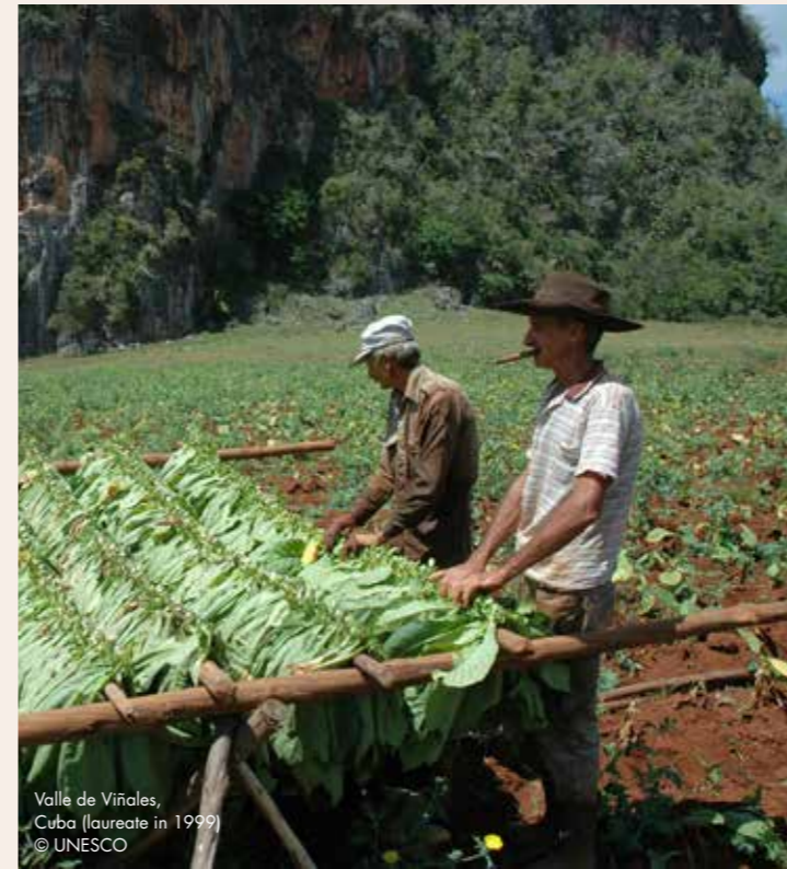
Valle de Viñales, Cuba (laureate in 1999)