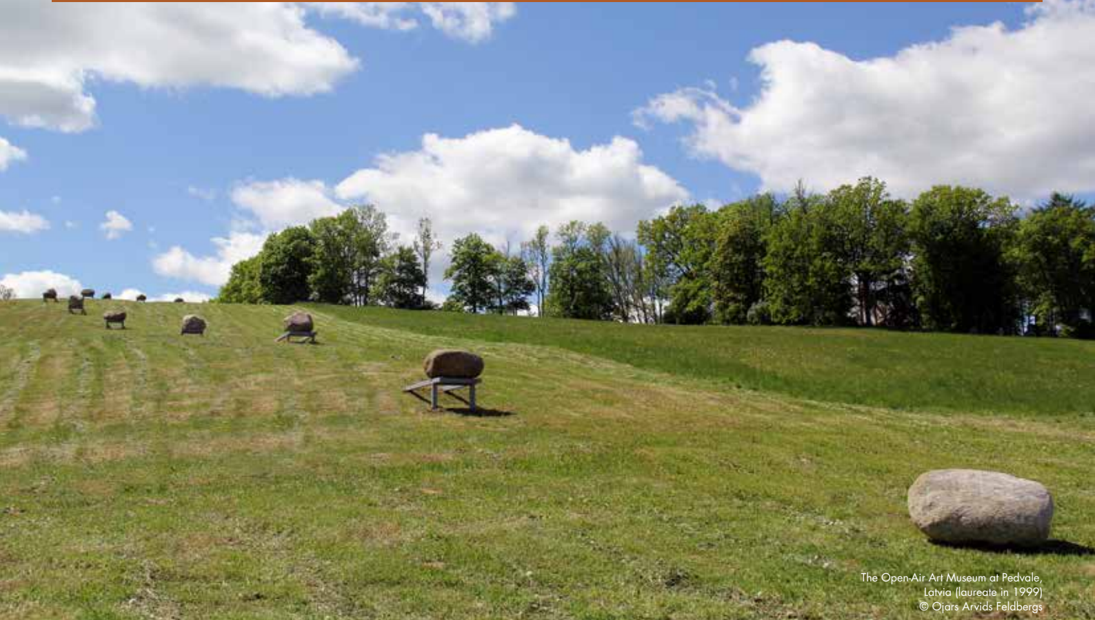
The Open-Air Art Museum at Pedvale, Latvia (laureate in 1999) © Ojars Arvids Feldbergs