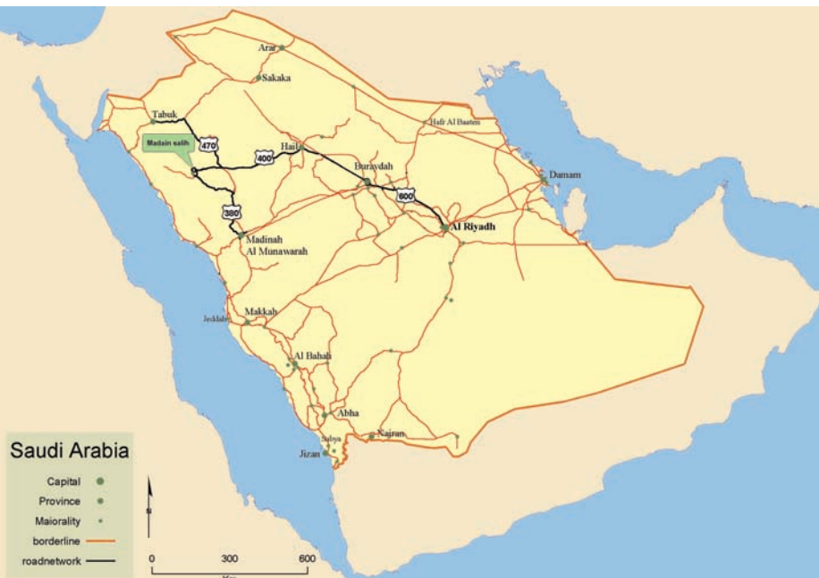
KINGDOM OF SAUDI ARABIA