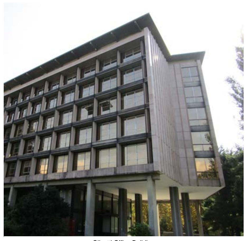
Olivetti Office Building