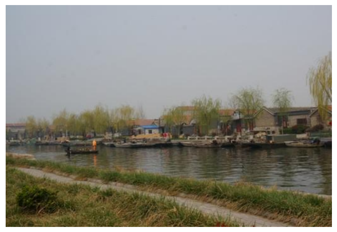
Sanitation engineer on the Canal of Guyang Town, Weishan, Shandong province