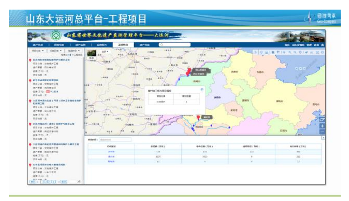
Shandong provincial monitoring platform of the Grand Canal

4.3.2 Whole line tour inspection. Considering the vast spatial dimension of the Grand Canal, the SACH has entrusted the secretariat of the Alliance of Cities for the Conservation and Management of the Grand Canal, i.e. the Grand Canal Conservation and Management Office, to carry out the annual tour inspection along the whole line of the Grand Canal since 2015 to further master the conservation state of different sections and supervise and examine the works of the conservation and management organizations of different areas. The tour inspection covered 85 sections and sites in the 31 property areas of the Grand Canal. The inspection included the conservation state of the physical fabric, the water quality protection, neighboring construction control and landscape conservation. For potential risks discovered in the tour inspection, the SACH has designated staff to make responsive monitoring and urged the areas concerned to make correction. Such efforts have timely removed the potential risks that may endanger the safety of the Grand Canal and ensured the outstanding universal value of the world heritage.