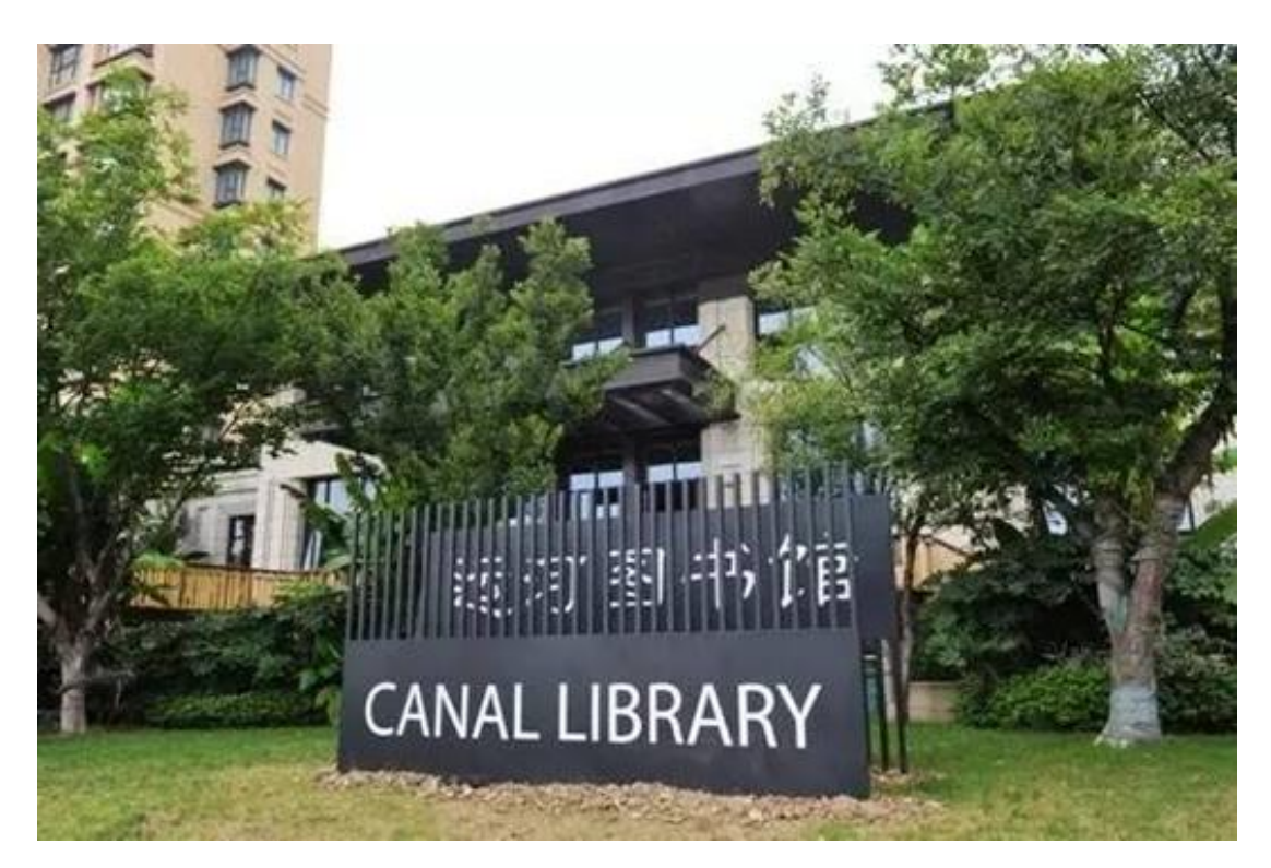
Canal Library by the Suzhou Section of the Grand Canal

changes of the living environment brought by the conservation and utilization of the Grand Canal. Some Canal culture spaces with high quality landscape, distinctive presentation themes and rich utilization functions have gradually formed the special commercial and cultural creation clusters and become important tourist destinations while enriching and facilitating the daily life of residents alongside the Grand Canal.