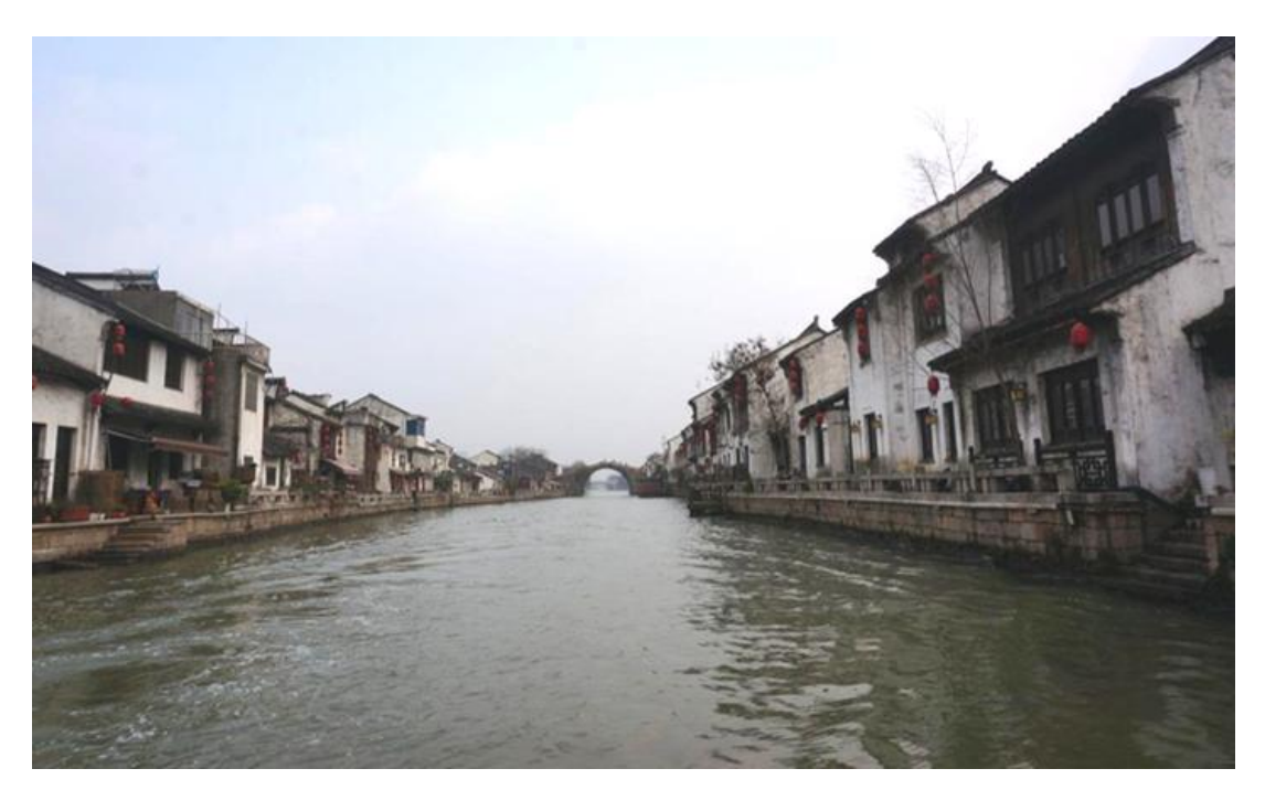
Jiangsu Section of the Grand Canal

three-level property conservation planning system covering the three tiers from the central government to the provincial governments and the prefectural governments. In 2012, the Inter-Provincial and Ministerial Consultation Group for the conservation of the Grand Canal - the Grand Canal consultation administration of the central government of China - publicized and implemented the General Plan for the Conservation and Management of the Grand Canal (2012-2030) and submitted it to the World Heritage Committee and the World Heritage Center for review and approval. The document was examined and approved. In the process of implementing tasks concerning conservation, management, presentation and utilization, and the neighboring area protection and construction control, China has included the abovementioned planning into the urban and rural economic and social development plans of the related areas as the essential basis for formulating administrative decisions related to the Grand Canal. Efforts have been made to continue the conservation, presentation and utilization and environmental control strictly in line with the planning, and give priority to management of construction and environmental control projects of the buffer zones.