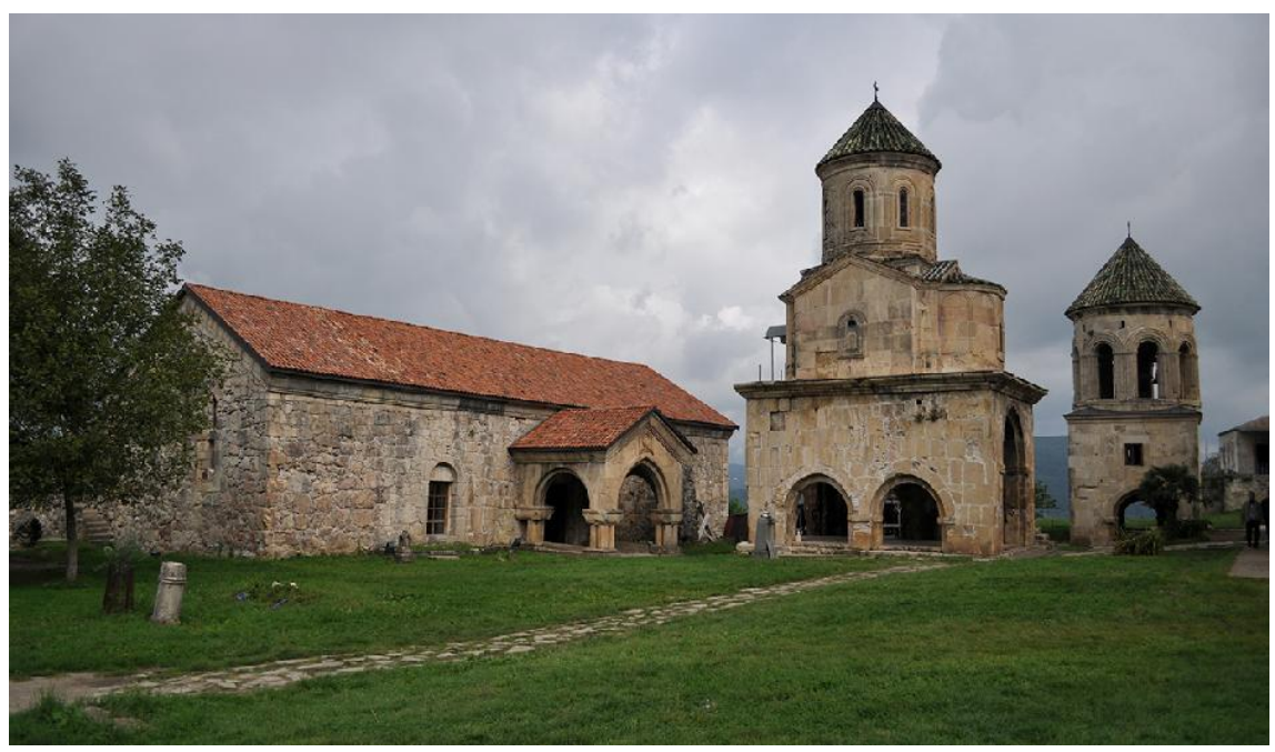
Academy, Church of St Nicholas, and bell-tower seen from the south