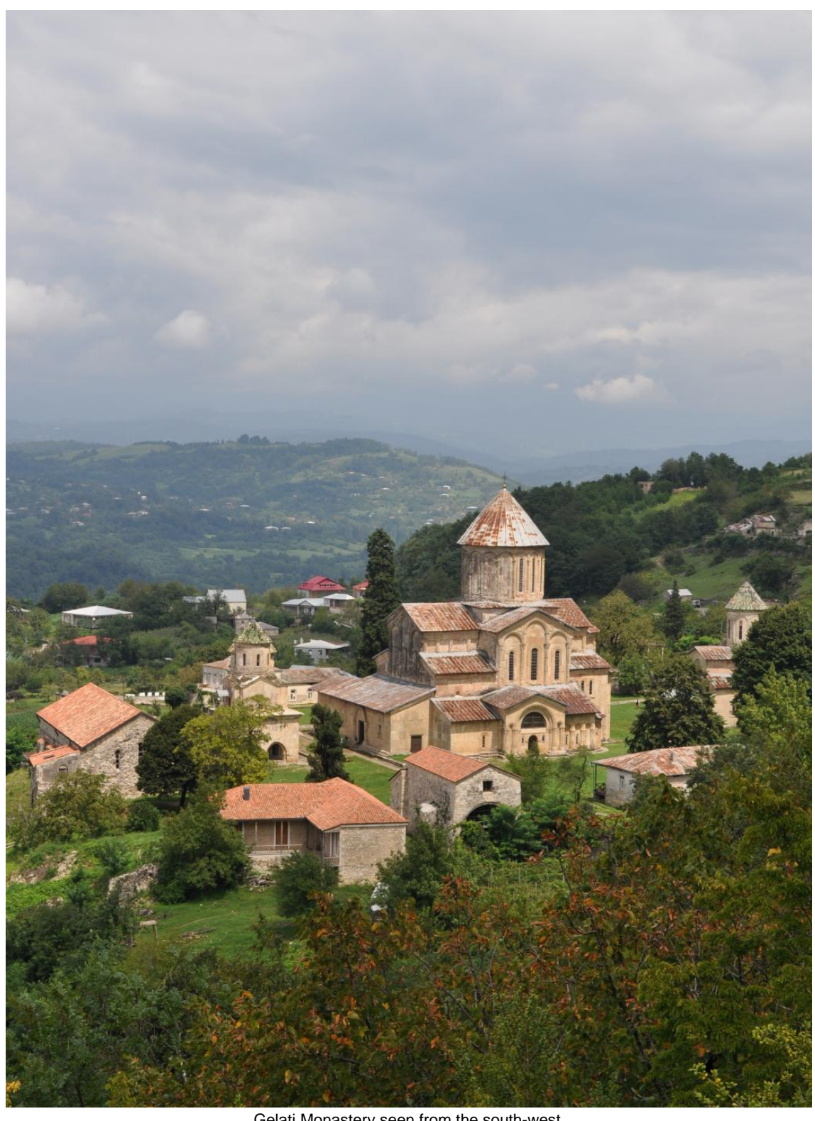
Gelati Monastery seen from the south-west