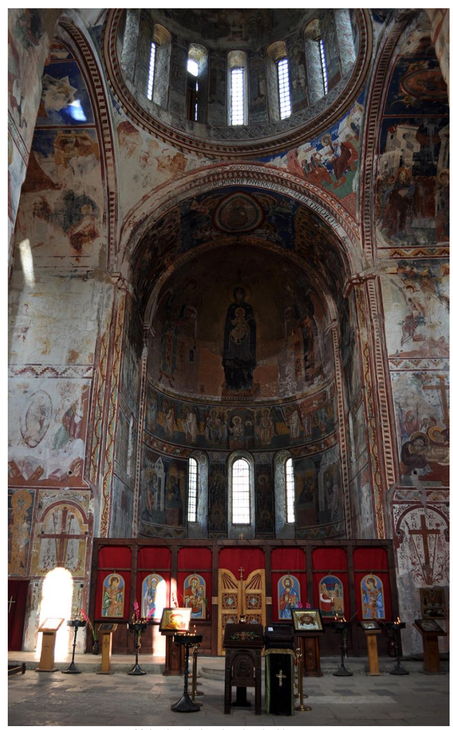
Main church, interior view looking east