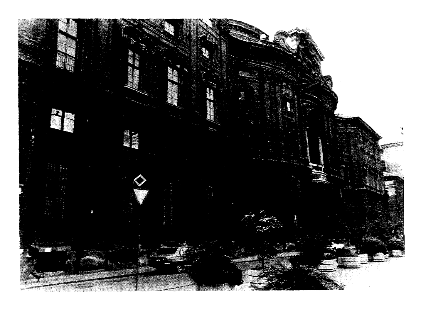
Résidences des Savoie / Residences of the Royal House of Savoy : Palazzo Carignano