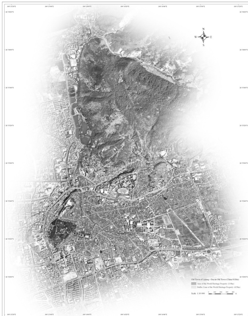
Dayan Old Town - map showing the revised boundaries of the property