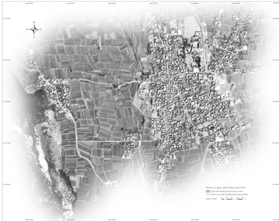
Basha Village - map showing the revised boundaries of the property